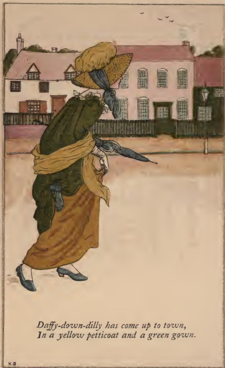
Daffy-down-dilly has come up to town, In a yellow petticoat and a green gown.