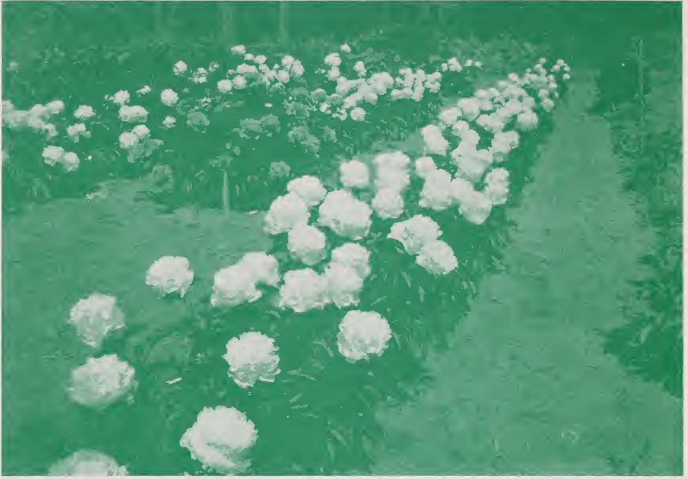
This picture shows the type of growth of the Lin's Peonies

If you do not grow peonies you should. They are about fool proof, need little care and will bloom for many years without replanting.