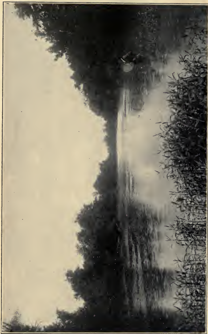
FIG. 5.—A small river as an animal environment. The rapid water conditions of a stream in an early stage of topographic development, such as is shown in Fig. 4, is here replaced by long pools of relatively quietly flowing water, connected by narrow stretches of more rapidly flowing water. Wabash River, Bluffton, Indiana.