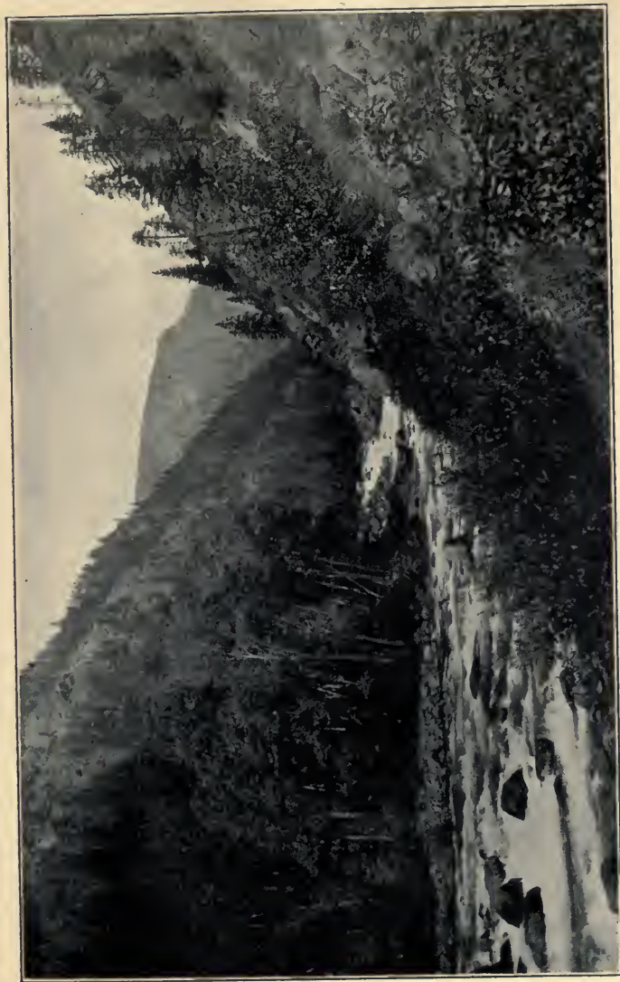
FIG. 4. — A small stream as an animal environment, with the preponderance of rapidly flowing water. Tumwater Cañon, near Wenatchee, Washington.