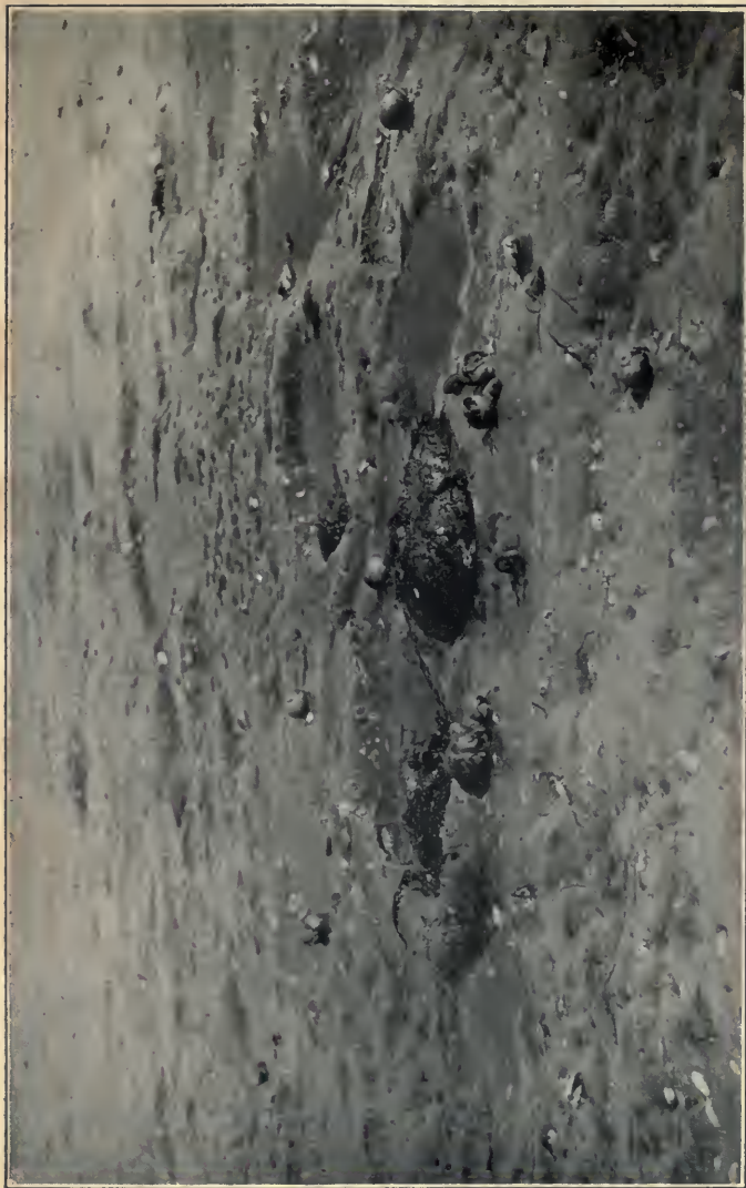
FIG. 3.— Struggle for Existence on a Clam Flat. Showing the destruction of Soft Clams by Horse-shoe Crabs ( Limulus ) and Cockles ( Lunatia ), Rowley Reef, Massachusetts.