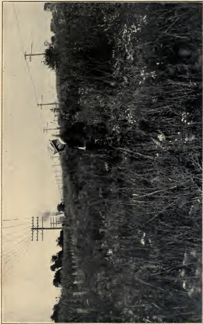
FIG. 6. — Remnant of the (original) prairie animal habitat in central Illinois, Loxa, Illinois. These areas are becoming extinct rapidly.