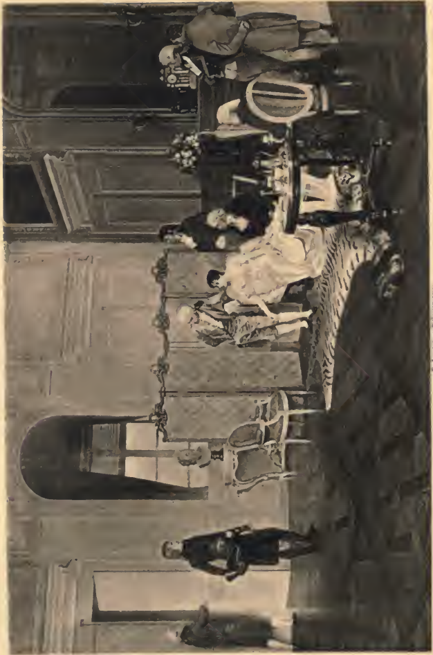
The Apartment by George Bernard Shaw