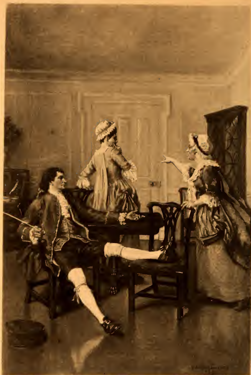
THE THIRTY-THIRD BY THE IN VIRTU PRIMA