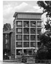
2005 Youth Hostel Frankfurt, Germany