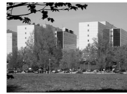
2019 Stockholm University