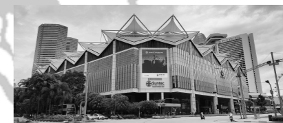
2023 Singapore Suntec Convention Centre