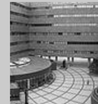
2013 Hong Kong Polytechnic University