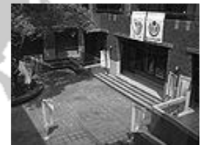
2007 Youth Center Taipei