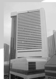
2008 Cape Town Southern Sun Cape Sun Hotel