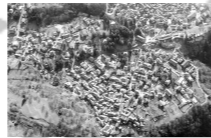
2016 Esino Lario, Lake Como area, Italy