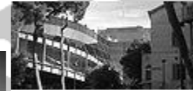
2011 Haifa Auditorium Complex, Israel