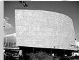
2008 Bibliotheca Alexandrina, Egypt