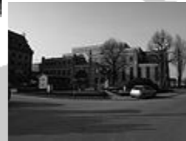
2010 Polish Baltic Philharmonic, Gdańsk