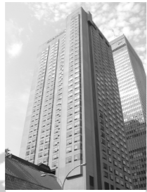
2017 Sheraton, Montréal, Canada