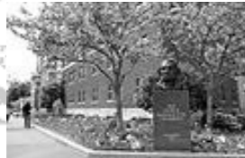
2012 George Washington University