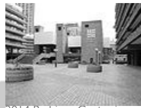
2014 Barbican Centre in London