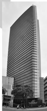
2015 Hilton, Mexico City