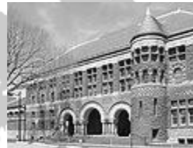
2006 Harvard University