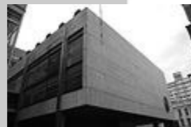
2009 Centro Cultural San Martín, Buenos Aires