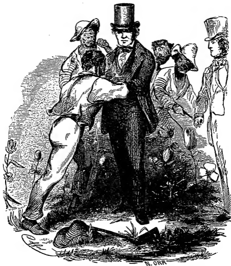
SCENE IN THE COTTON FIELD, SOLOMON DELIVERED UP