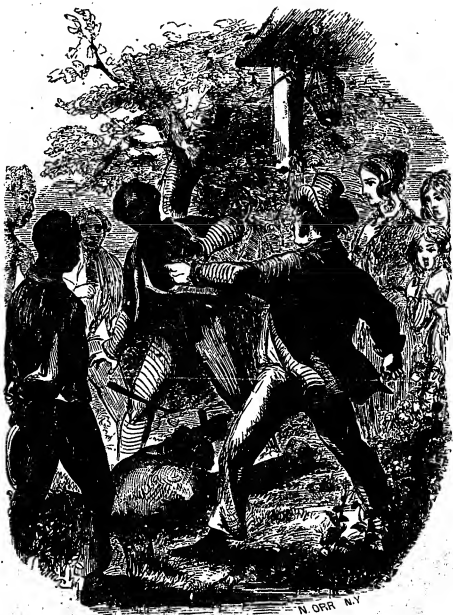
THE STAKING OUT AND FLOGGING OF THE GIRL PATSEY.