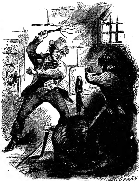
SCENE IN THE SLAVE PEN AT WASHINGTON.