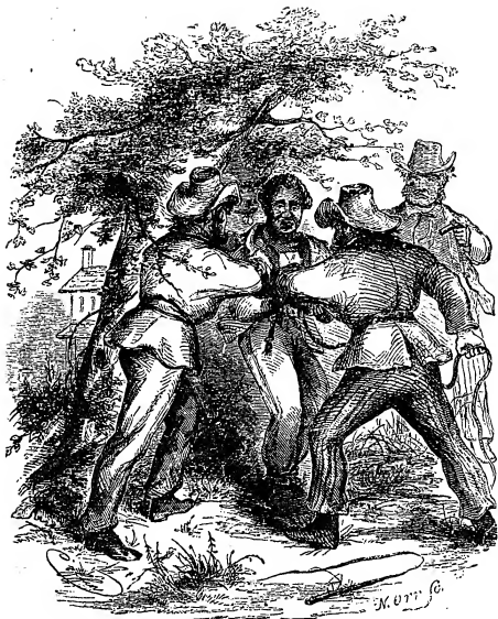
CH. PIN RESCUES SOLOMON FROM HANGING.