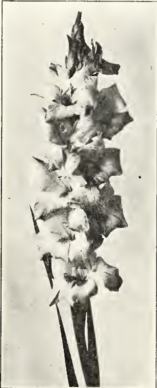
Wings of the Morning