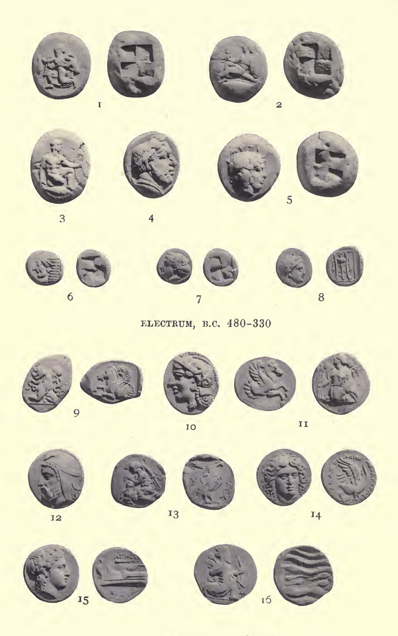
GOLD OF ASIA, B.C. 480-330