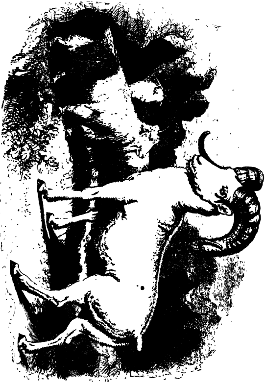
Rocky Mountain Sheep.