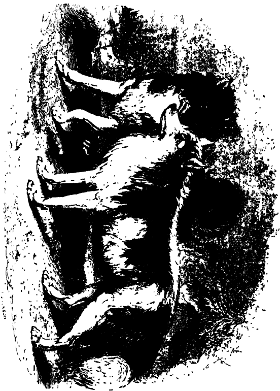
Here Inhab of Mackenzie River Joes.