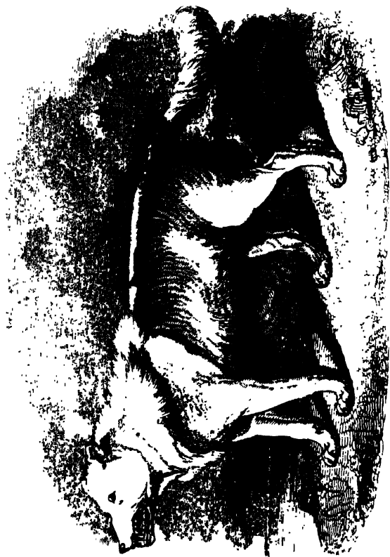
American Gray Wolf