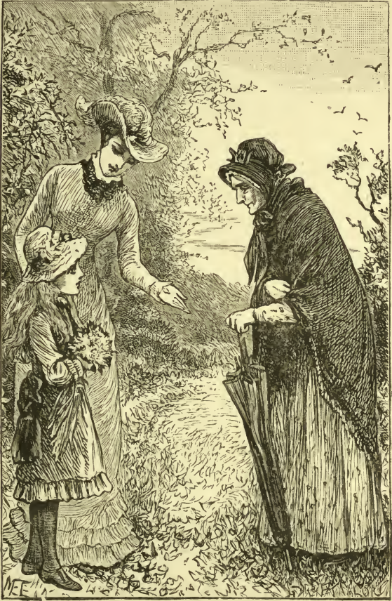
SPECIMEN OF THE ILLUSTRATIONS.