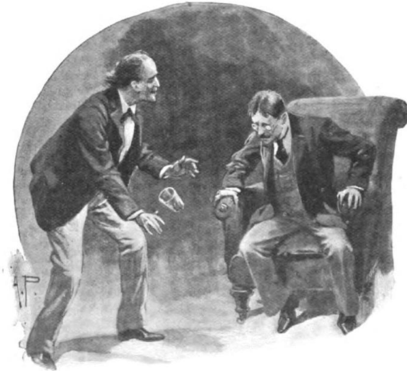
"IT HUNG IN MID-AIR—MOTIONLESS."

"And here," he said, and opened the hand that held the glass. Naturally I winced, expecting the glass to smash. But so far from smashing it did not even seem to stir; it hung in mid-air—motionless. "Roughly