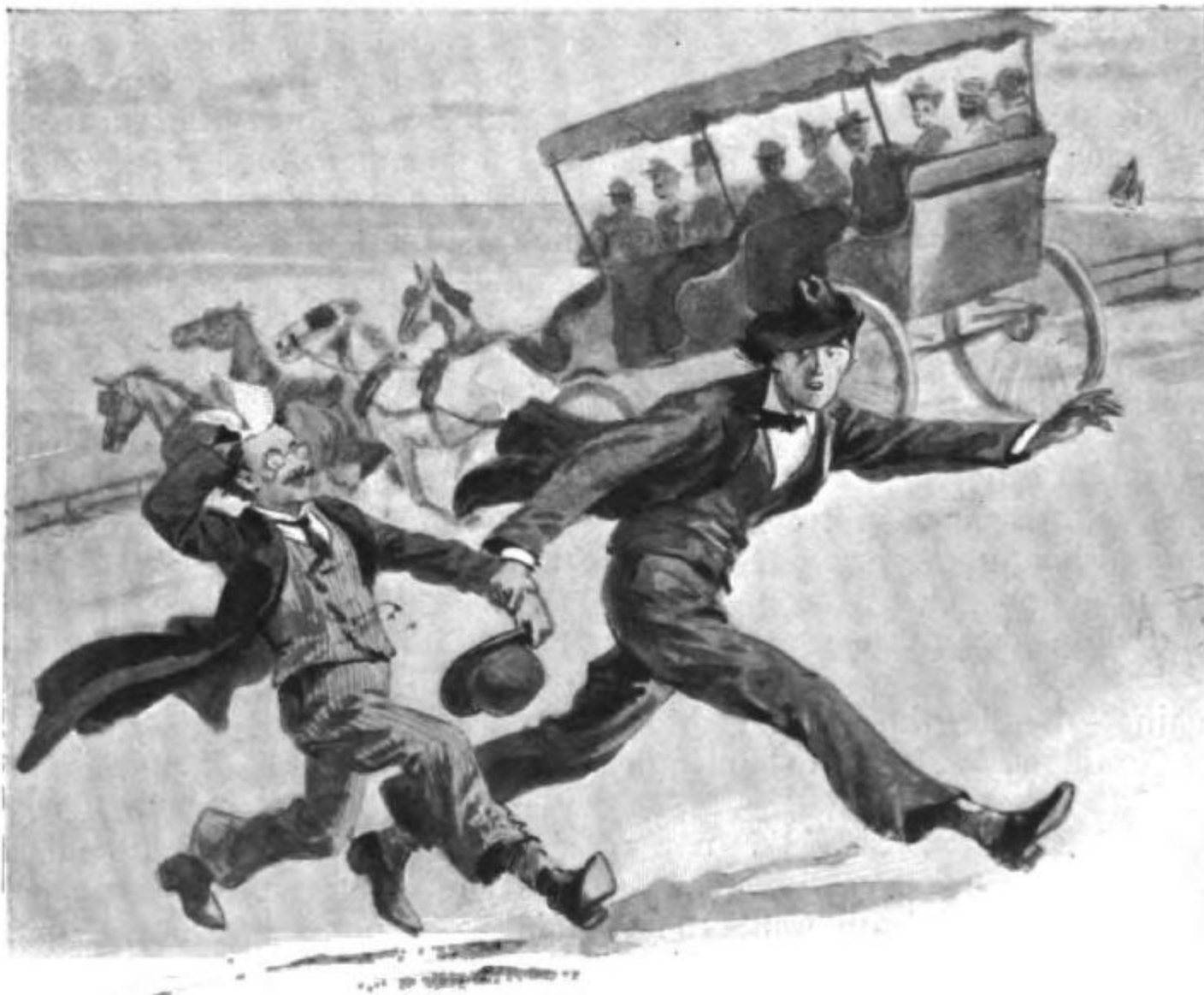
"I PANTED FOR MERCY."

"It does more, much more. It scares me. Come up and see the stuff. Taste it! Try it! It's the most amazing stuff on earth." He gripped my arm and, walking at such a pace that he forced me into a trot, went shouting with me up the hill. A whole char-à-banc -ful of people turned and stared at us in unison after the manner of people in chars-à-banc . It was one of those hot, clear days that Folkestone sees so much of, every colour incredibly bright and every outline hard. There was a breeze of course, but not so much breeze as sufficed under these conditions to keep me cool and dry. I panted for mercy.