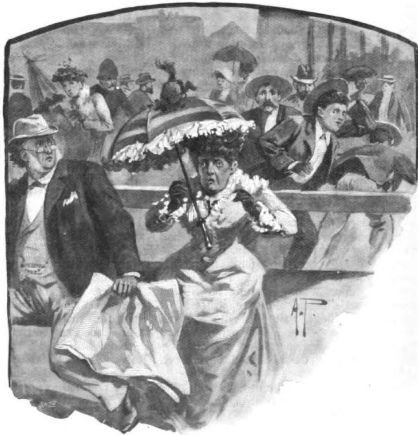
"PEOPLE GOT UP AND TROD ON OTHER PEOPLE."

got out of tune—was arrested by the amazing fact, and the still more amazing yapping and uproar caused by the fact, that a respectable, over-fed lapdog sleeping quietly to the east of the bandstand should suddenly fall through the parasol of a lady on the west—in a slightly singed condition due to the extreme velocity of its movements through the air. In these absurd days, too, when we are all trying to be as psychic, and silly, and superstitious as possible! People got up and trod on other people, chairs were overturned, the Leas policeman ran. How the matter settled itself I do not know—we were much too anxious to disentangle ourselves from the affair and get out of range of the eye of the old gentleman in the bath-chair to