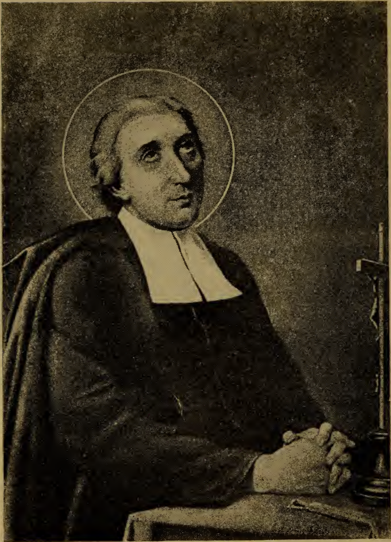
SAINT JOHN BAPTIST DE LA SALLE 1651-1719