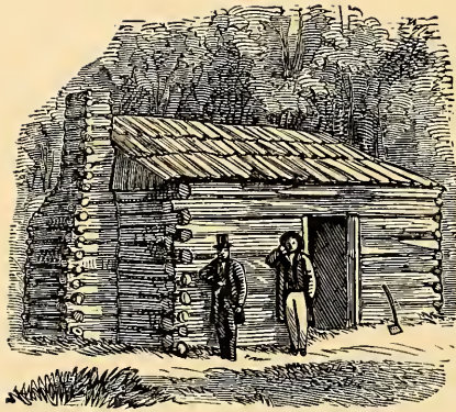
LINCOLN'S FIRST HOUSE IN ILLINOIS.