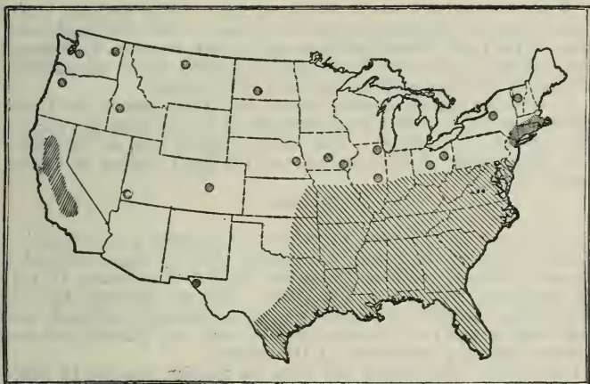
Endemic areas of malaria.—Shaded portions of map show endemic areas. Shaded circles represent localities in which cases of malaria occur and in which the disease is probably endemic.

States and of cities of over 10,000 population. The records of the occurrence of malaria at Army posts were also consulted. The mortality records of the registration area for deaths were examined, but, naturally, gave little information of value, for the reason that malaria may be prevalent without appearing in the records of deaths. This is illustrated by the fact that between 1904 and 1914 there were in the Army in the continental United States, exclusive of Alaska, over 13,000 cases of malaria, while during this time there were only two deaths due to the disease. Between 1907 and 1914 there were over 7,000 cases without a death. Then, too, in civil life malaria frequently is given as a cause of death when the deceased was affected with some condition other than malaria. This is true both in ma-