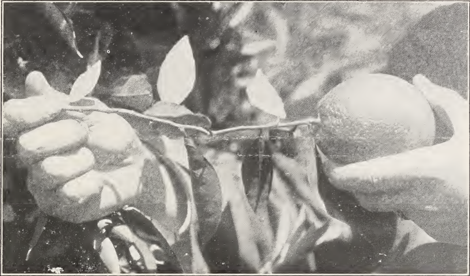
Typical fruit-bearing bud stick from a select Washington Navel Tree, showing the kind of bud wood used by

If, by following the system for propagating nursery stock outlined above, the production of a grove can be increased 25% or even 20%, is it not well worth the extra precaution. "Higher efficiency" is the slogan all along the line today.