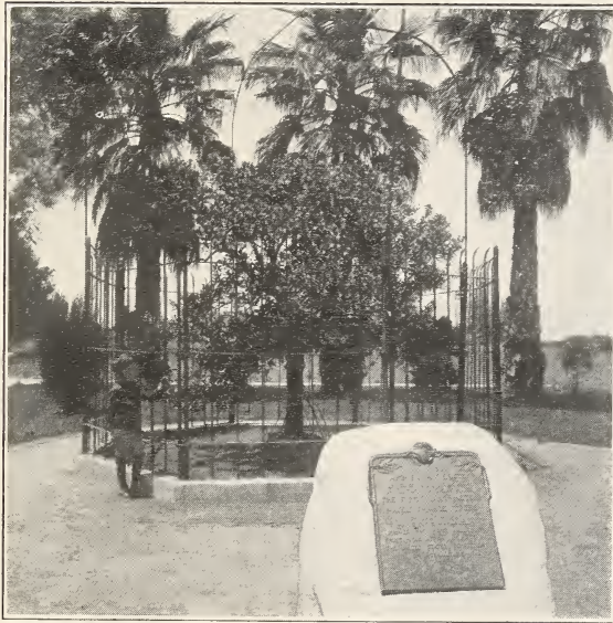
PARENT WASHINGTON NAVEL ORANGE TREE