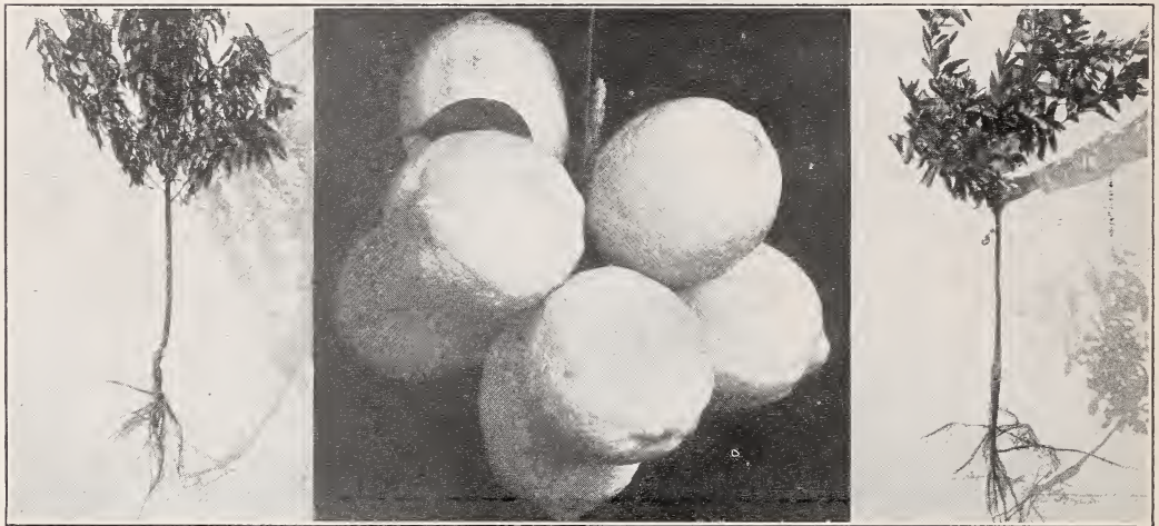
Pedigreed Peach Tree

Remember—quality, reliability and our reputation is behind every order.