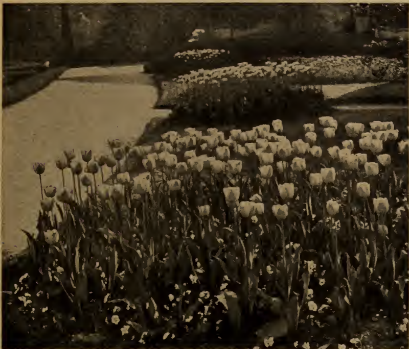
Darwin Tulips bloom later than the other classes. They are quite distinct in size and shape. See page 10