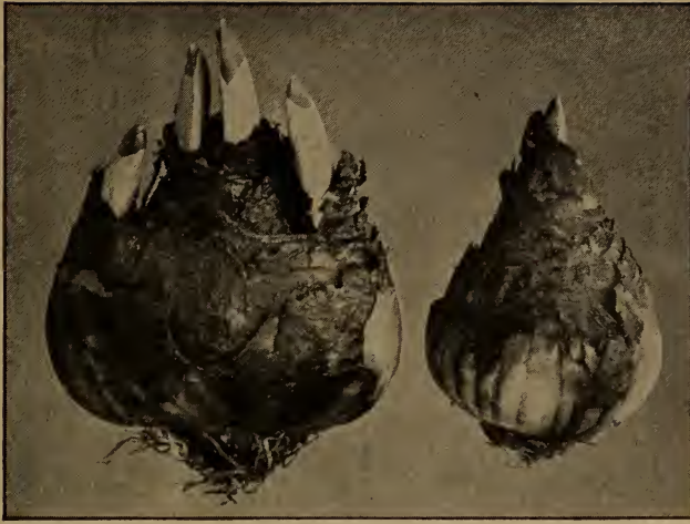
Bulbs of Sir Watkin Narcissus. Showing Farr's "Mother Bulb" in comparison with the ordinary first-size bulb