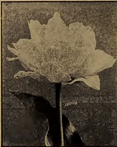
La Candeur is a white double Tulip extensively used for borders and beds

Wilhelm III. Orange-scarlet. Dwarf, useful for front of taller sorts, or in beds. 75 cts. per doz., $5.50 per 100, $45 per 1,000.