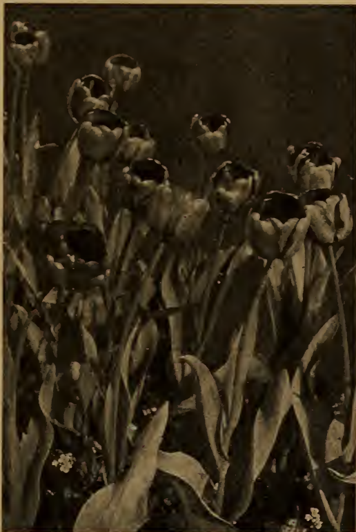
Mr. Farncombe Sanders is a rich scarlet with large blooms

Philippe de Commines. One of the earliest Darwins for forcing; deep purple. $1.25 per doz., $8 per 100, $65 per 1,000.