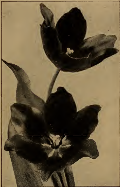
Gesneriana major has exceedingly vivid coloring

Inglescombe Yellow (Yellow Darwin). Large globular flower. 75 cts. per doz., $5 per 100, $40 per 1,000.