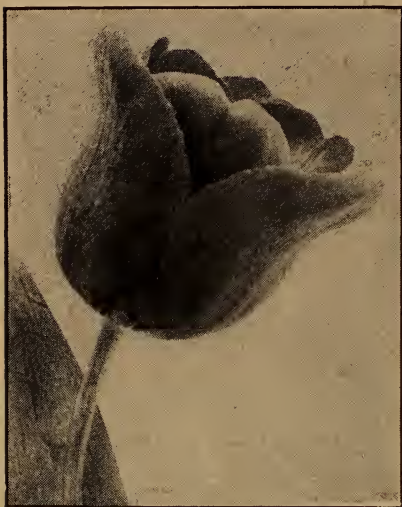
Zulu is startling when used in groups of twenty-five or more