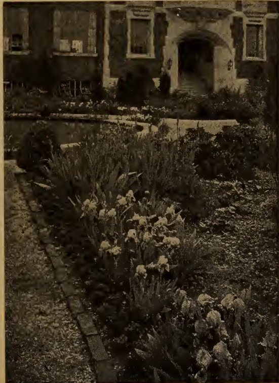
Farr's Irises at the home of "Country Life in America," Garden City, N. Y.

Brilliant coloring is a distinguishing feature of all the tall bearded June-flowering Irises, but some varieties seem to be more richly endowed than their fellows, and therefore need special mention. Among these Iris King is distinct because of the rich lemon-yellow standard and maroon falls which are bordered with yellow. Mithras raises a light yellow standard amid deep yellow falls that are bordered wine-red.