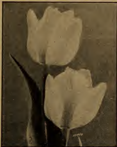
Chrysolora is one of the most popular yellow Tulips for bedding

A choice collection made up from the best named Tulips. The bulbs will bloom at about the same time, and the flower-stems are about the same length—important points when selecting bedding varieties. The mixture is superior in every way. 50 cts. per doz., $3.75 per 100, $35 per 1,000.