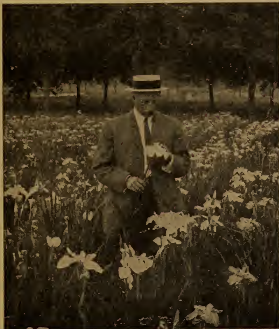
Iris Kaempferi, arrayed in richest blue and purple and gold

30 Wase-Banri. Three white petals, delicately veined blue, dark blue standards, edged white.