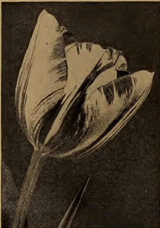
A typical specimen bloom of one of my Single Early Tulips

Chrysolora. A large and extra fine pure golden yellow Tulip; desirable for bedding with red and white sorts. 65 cts. per doz., $4.50 per 100, $40 per 1,000