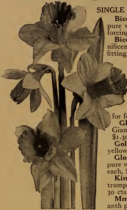
Mme. Plemp. Excellent for border planting