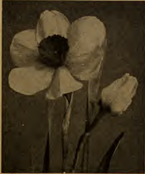
Incomparabilis, Will Scarlett. The contrast between perianth and cup is always well defined

Leedsii, White Lady. Elegantly formed flower, with white perianth and canary-yellow cup. $1.50 per doz., $9 per 100.