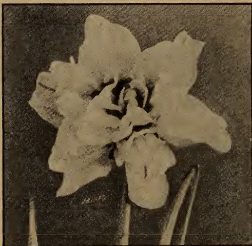
Orange Phoenix is a desirable variety for forcing

Alba-plena odorata. Pure white; for outdoor planting only. 65 cts. per doz., $4 per 100, $36 per 1,000.