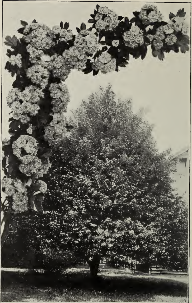
DOUBLE FLOWERED THORN (Tree and Flowering Branch)