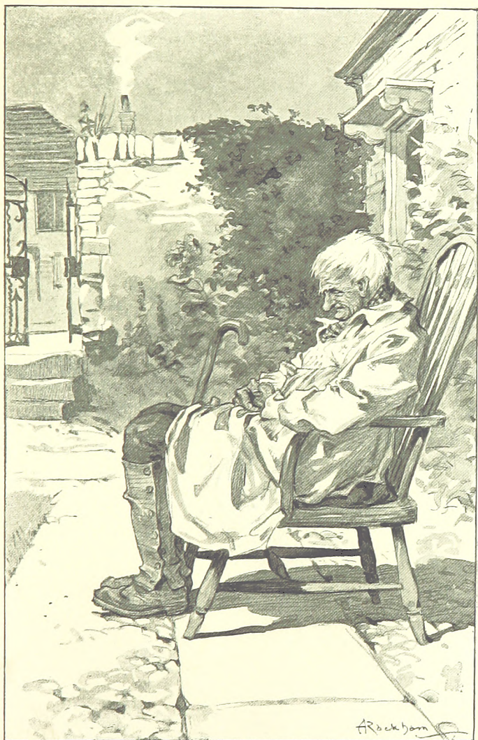
He sits very contentedly in his garden in the summer sunshine, and dozes a great deal