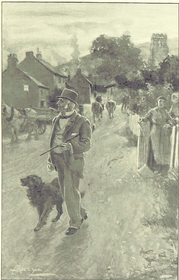
The villagers always follow his stalwart, solitary old figure, with the comment that 'he do bear up wonderful'