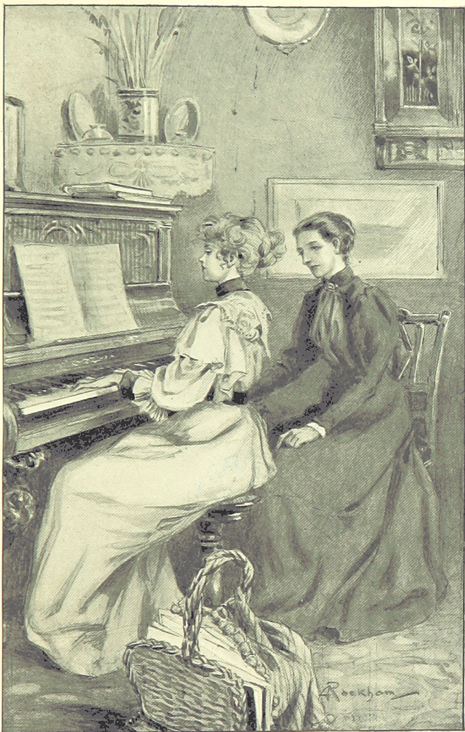
The Eldest Generosity girl bounces about a good deal on the music stool and plays wrong notes maliciously