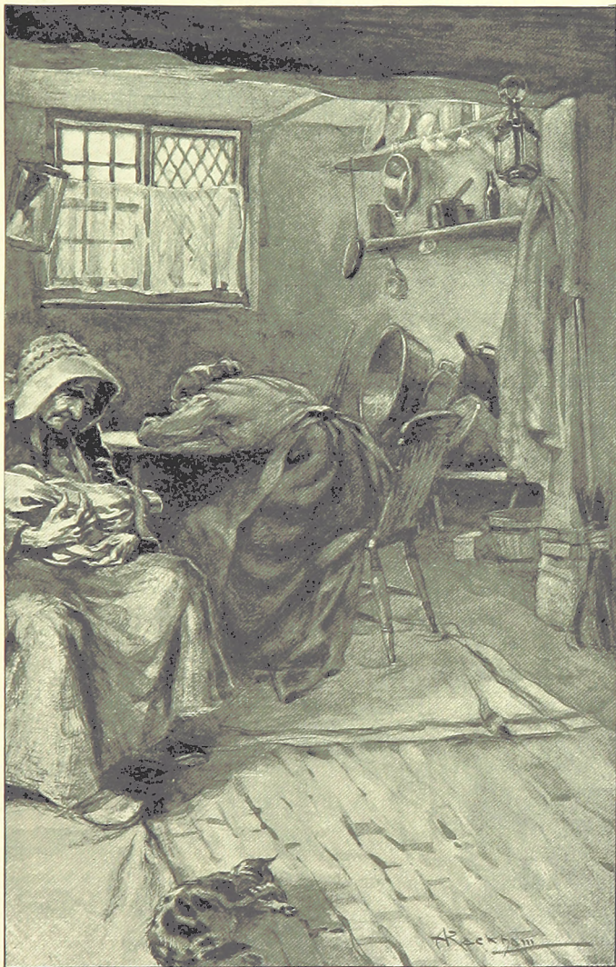
The old woman, rocking Polly's baby to sleep