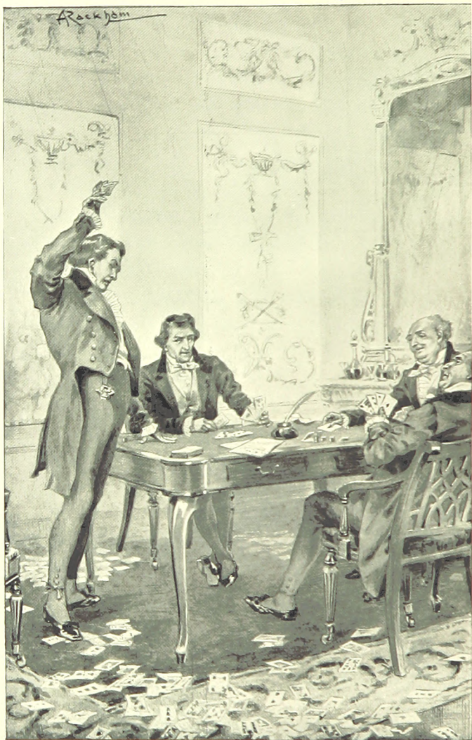
My Lord is young with George IV. He loses a fortune at play