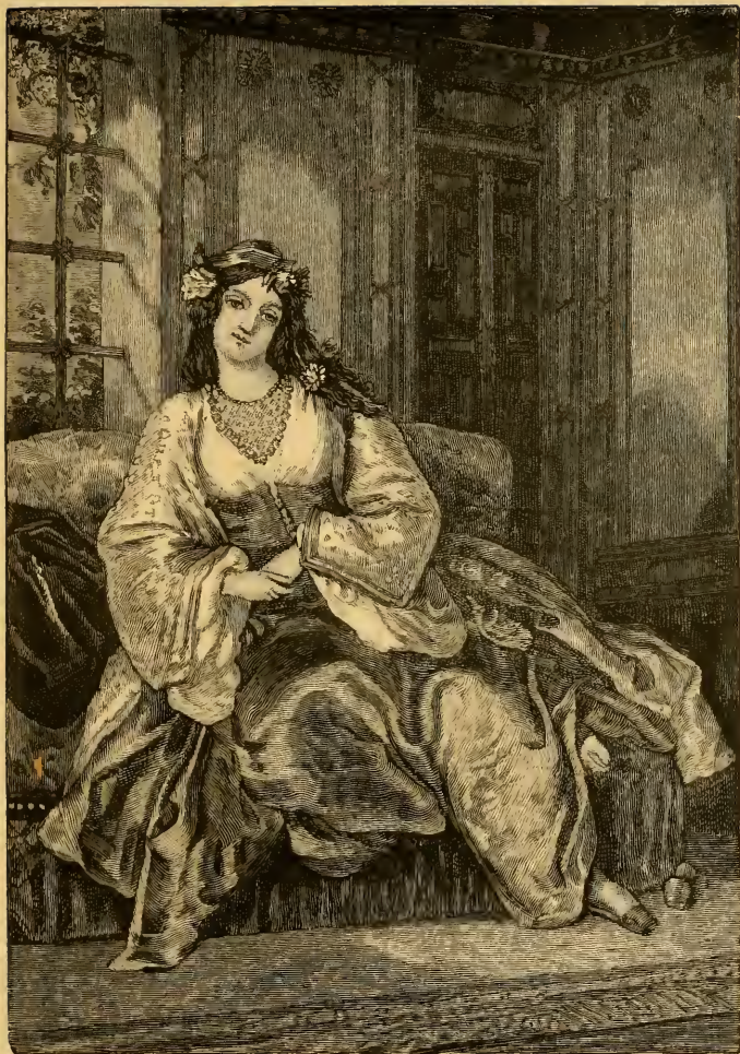
THE MAID OF ATHENS. — Page 508.