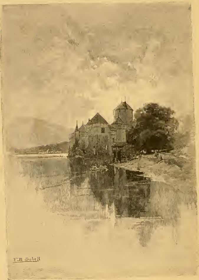
THE CASTLE OF CHILLON. — Page 164.