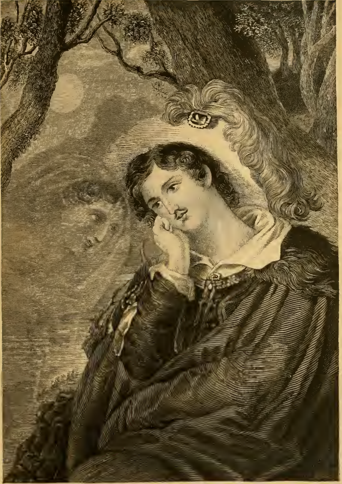
JUAN'S LOVE. — Page 668.