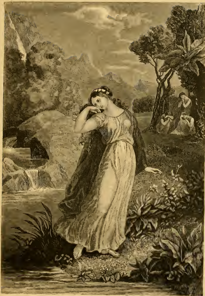
JEPHTHA'S DAUGHTER. — Page 329.