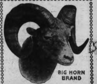
BIG HORN BRAND