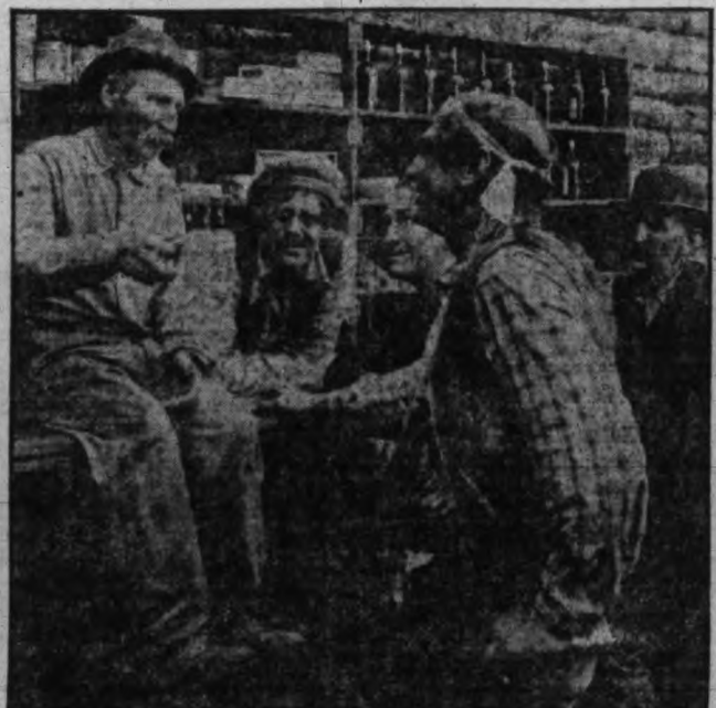
Scene from "The Sign Invisible," the big feature to be shown at the Dom Thursday, Friday and Saturday

At the annual meeting of the Victoria branch of the Canadian Bible the Y. M. C. A., Interesting reports were read, and a lecture on India, il-