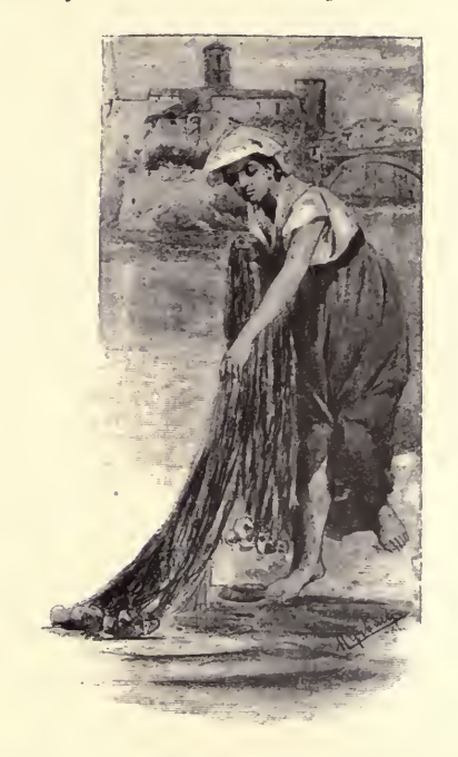
page of a song in a music-seller's window. It so chanced that the girl was heart-whole,

sunlight struck the artist, perhaps even rather trivially, like some coloured print on the title-