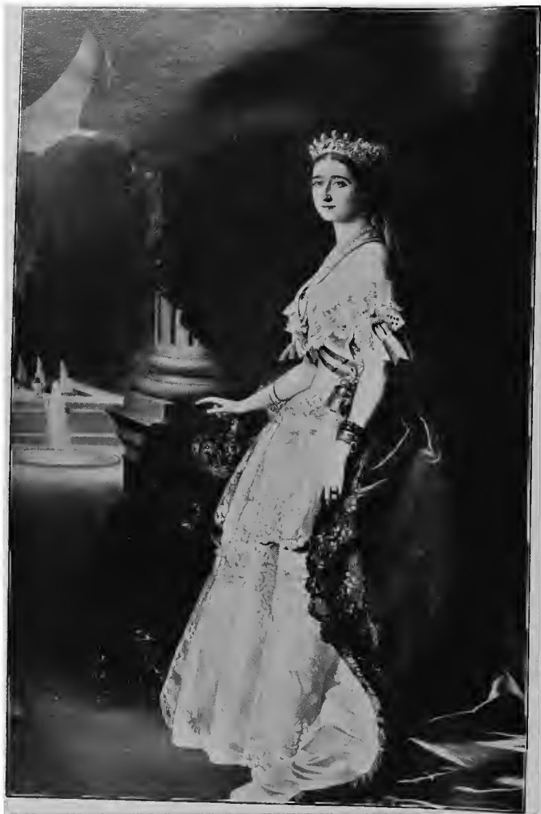
THE EMPRESS EUGÉNIE.