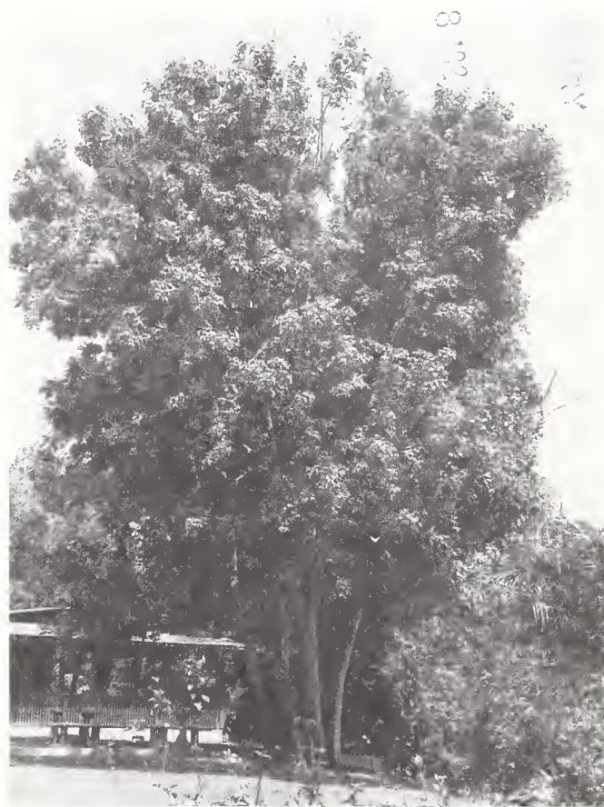
Figure 1. —Clump of young quenepa ( Melicoccus bijugatus ) trees growing in Puerto Rico.

Quenepa was noted on the island of St. John, U.S. Virgin Islands, in association with Maytenus laevigata (Vahl) Griseb. ex Eggers, Guapira fragans (Dum.-Cours.) Little, Ocotea coriacea (Sw.) Britton, Sabinia florida (Vahl) DC., Inga fagifolia (L.) Willd., Bursera simaruba (L.) Sarg., Tabebuia heterophylla (DC.) Britton, Andira inermis (W. Wright) HBK., and Spondias mombin L. (24). On the island of St. Eustatius, Netherlands Antilles, quenepa was noted