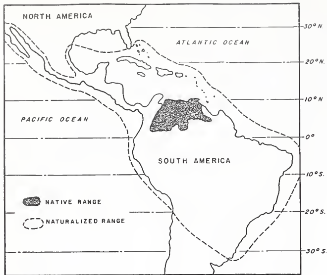
Figure 2. —Approximate native and naturalized ranges of quenepa ( Melicoccus bijugatus ) trees in the Neotropics.

as a minor component of the canopy layer of dry forest on a moderately steep, rocky site. The other species noted were Pisonia subcordata Sw., B. simaruba (L.) Sarg., P. fragrans Dumont-Cours, Capparis indica (L.) Fawc. & Rendle, T. heterophylla (DC.) Britton, and Malpighia emarginata Sessé & Moc. ex DC. (23). Natural forest in the Cañón de Cauca in Colombia supports quenepa in association with Inga spp., Ceiba pentandra Gaertn., Astronium graveolens Jacq., Hymenaea courbaril L., Erythrina glauca Willd., Anacardium occidentale L., T. pentaphylla Heml., Acrocomia antioquiensis Posada-Arango, S. mombin L., and many other species (5).