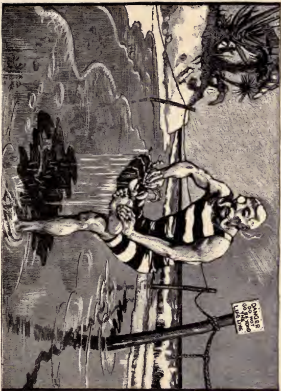
ONE OF THE BENEFICIARIES AT PALM BEACH (From a tin-type taken on the spot)