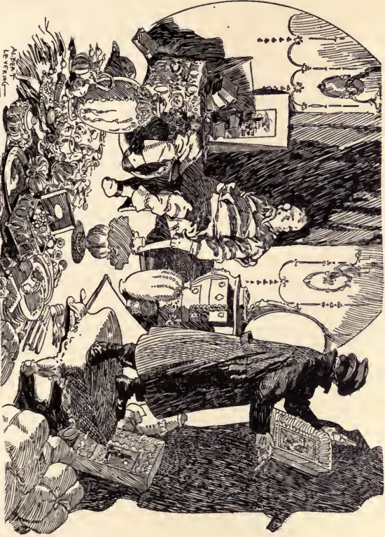
"AS KEEN AND HIGH-HANDED A PERFORMANCE AS I EVER WITNESSED"