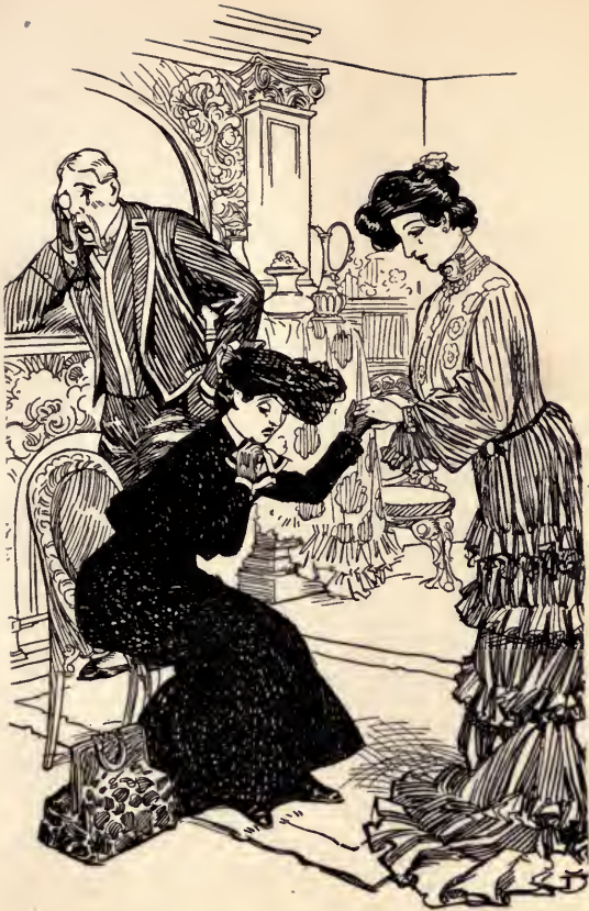
“HER SLIGHT LITTLE FIGURE CONVULSED WITH GRIEF”