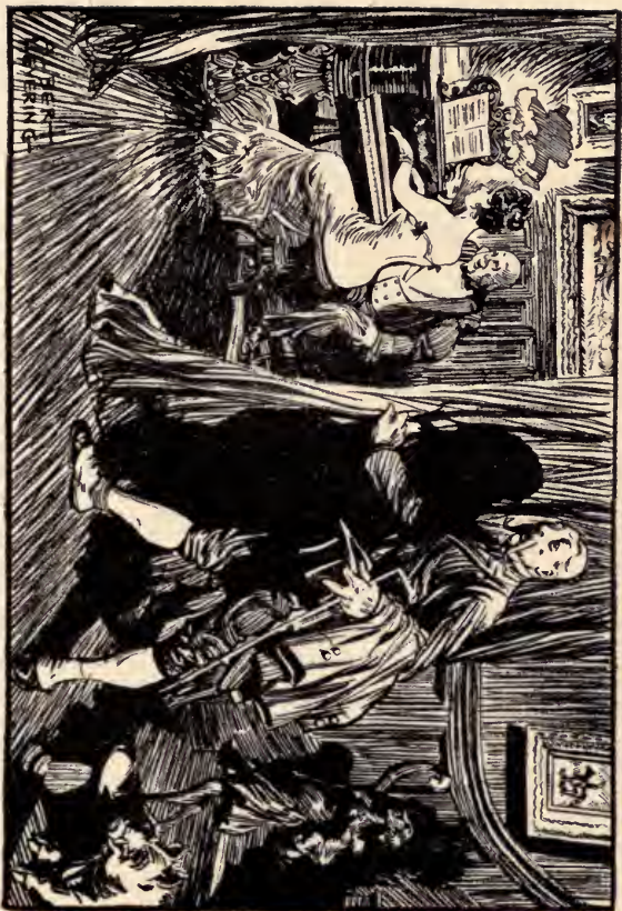
“HENRIETTE WAS TESTING THE FIFTY-THOUSAND-DOLLAR PIANO”