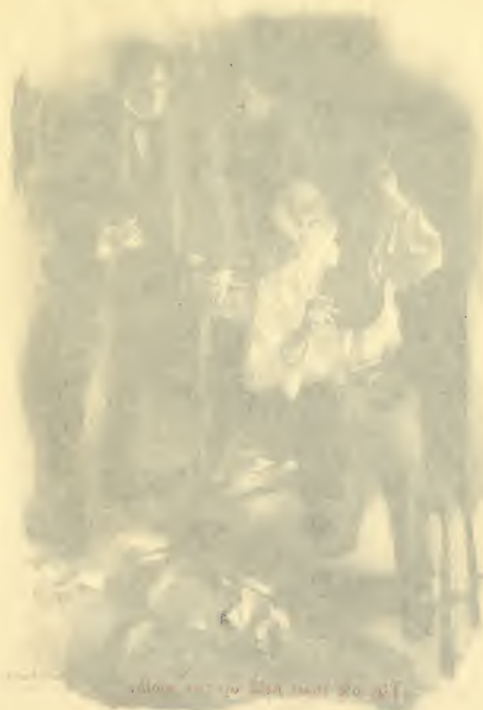
The old town hall of the north.