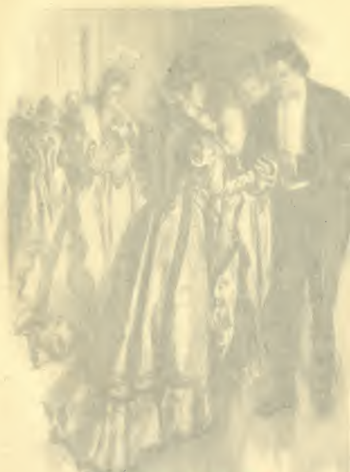
BEFORE THE GREAT DEPARTURE

Copyright 1918 by the American Red Cross Society