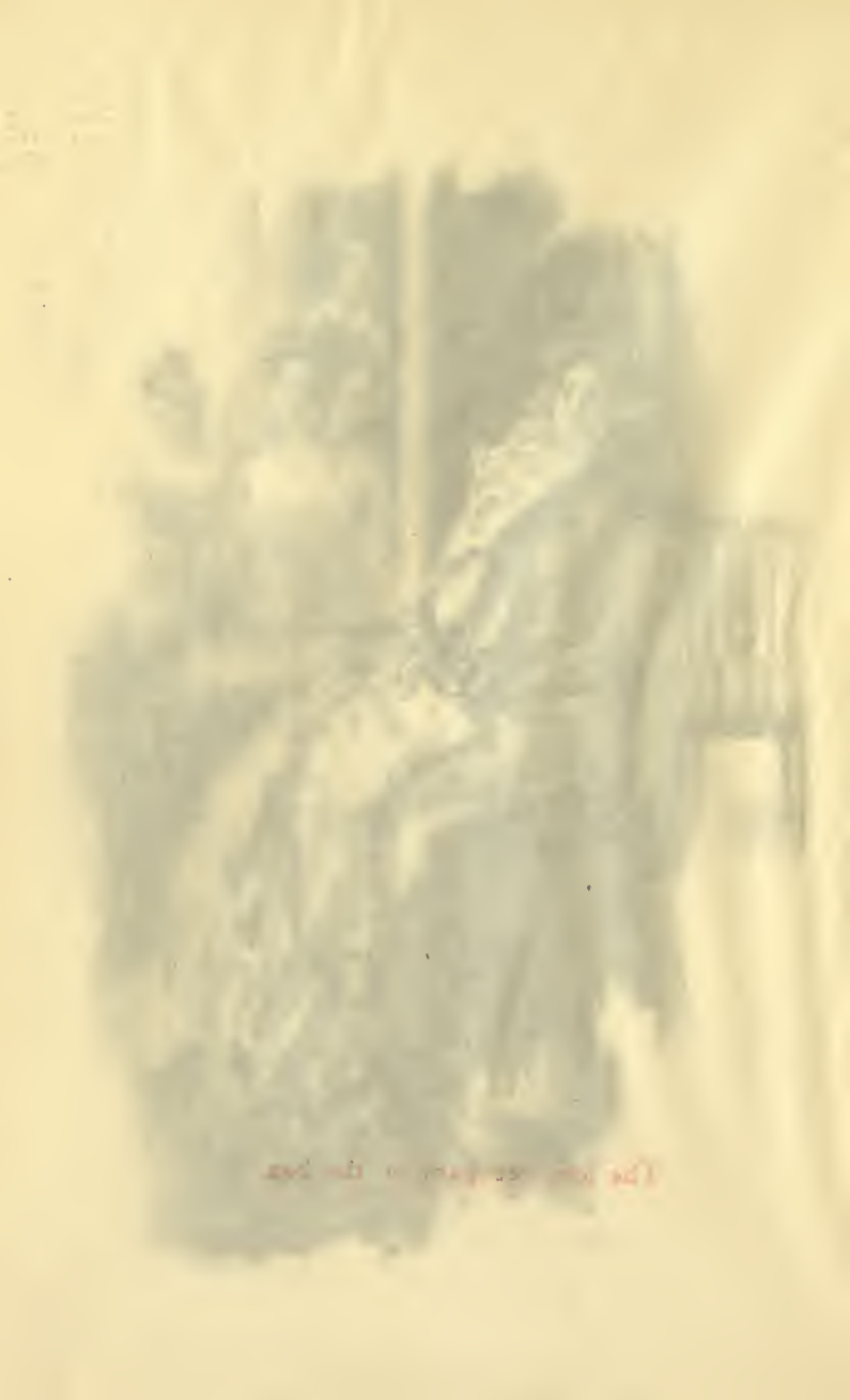
The last moment of the day