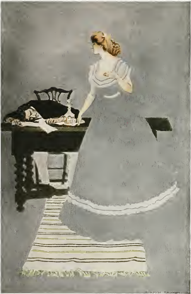
" Then she left the room again "