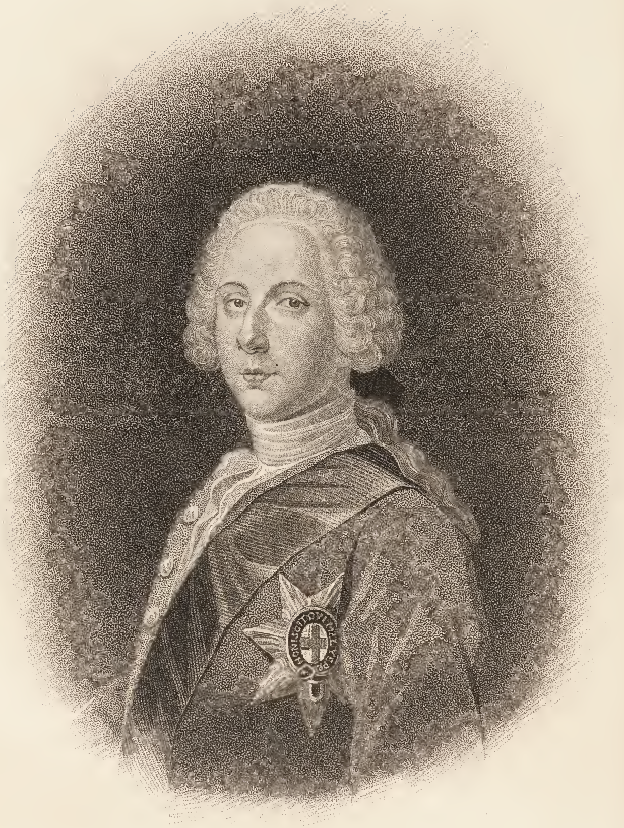
PRINCE CHARLES EDWARD STUART.