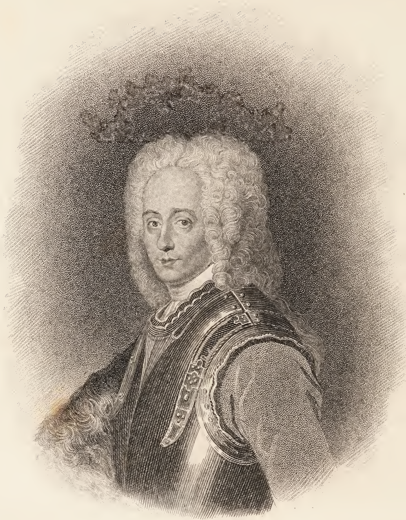
JAMES STUART, THE CHEVALIER DE ST GEORGE.