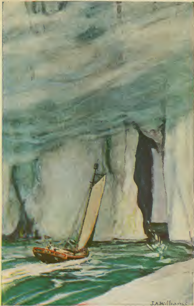
"My father shouted: 'Breakers ahead!'"