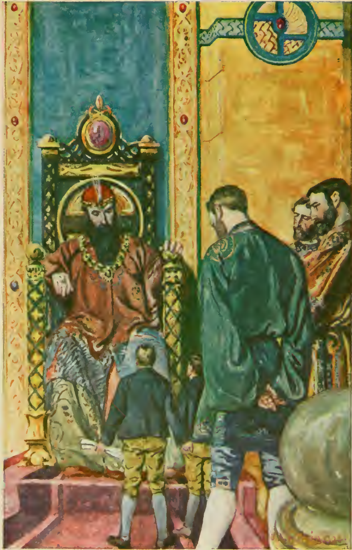
"We were brought before the Great High Priest."