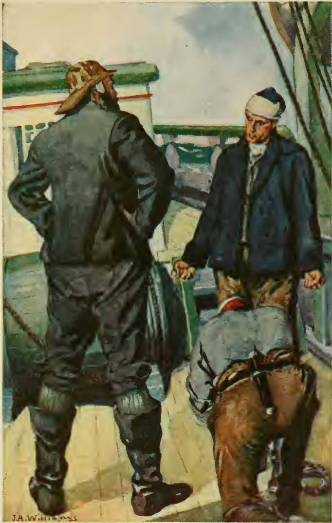
"Whereupon I was put in irons."