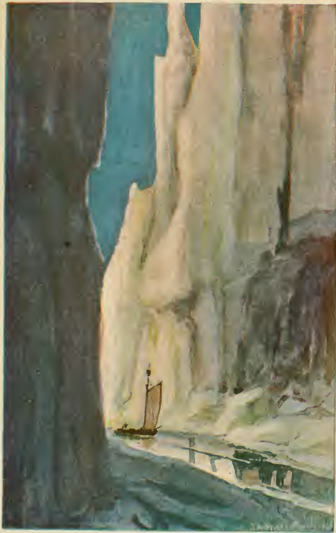
"A vessel larger than our little fishing sloop could not have threaded its way among the icebergs."