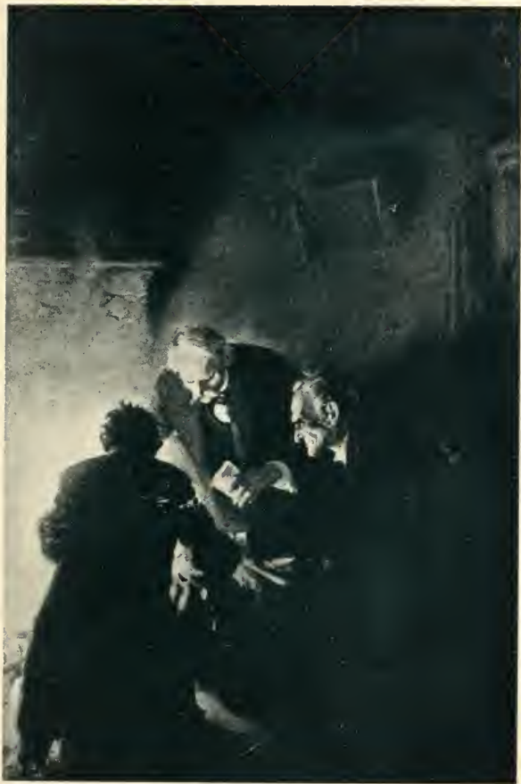
INSTINCTIVELY THEY ALL KNELT DOWN.