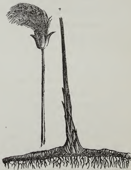
THE PAPYRUS PLANT.

new materials for paper stock. It is in this department that great results have been attained. In less than half a century, the machines have entirely superseded the diminutive hand-mills which sparsely dotted the country, and gigantic establishments have risen up in their places. Paper-mill villages, and banking institutions even, have grown out of this flourishing branch of industrial art, and we behold with satisfaction and amazement, what has been brought about by the aid of a commodity so insignificant in the eyes of the world as linen and cotton rags.