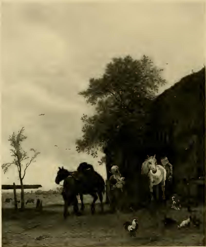
BARNYARD SCENE BY PAULUS POTTER