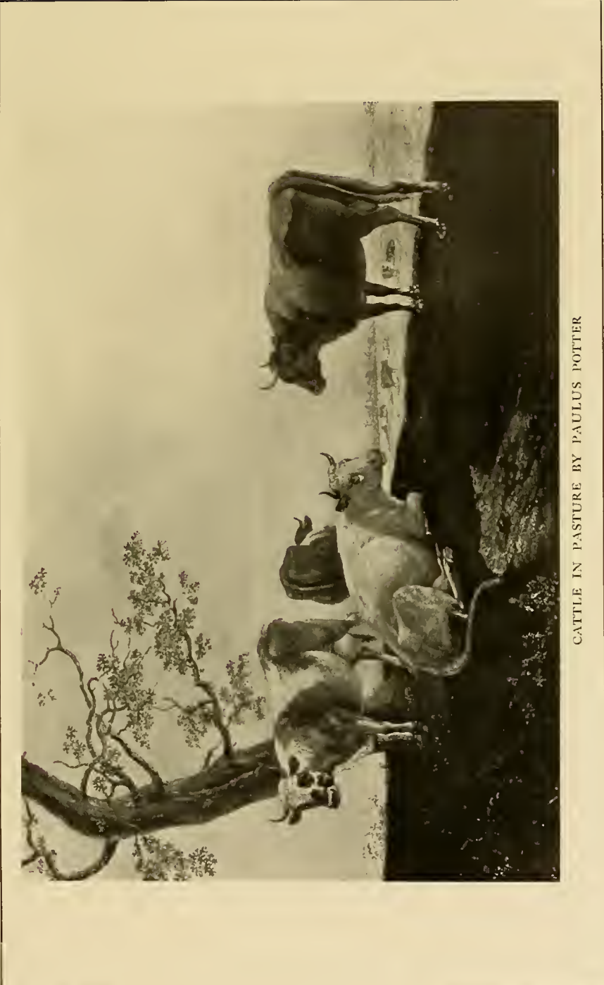
CATTLE IN PASTURE BY PAULUS POTTER