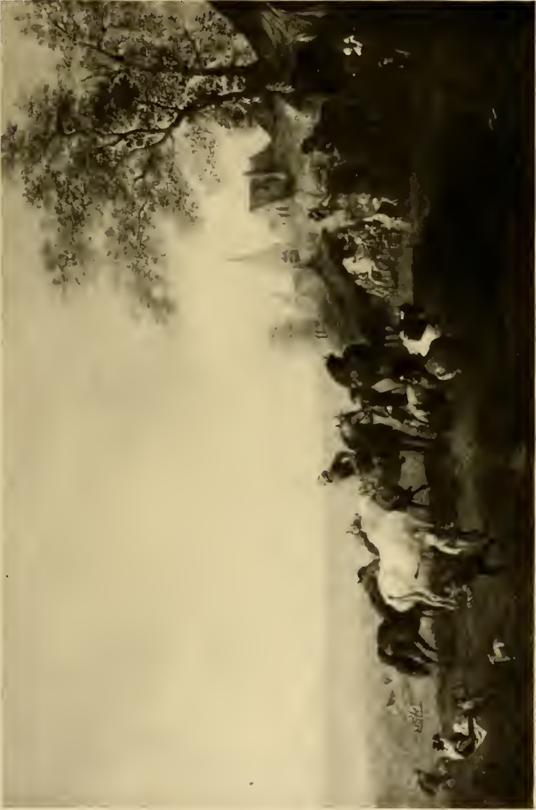
HORSE FAIR BY PHILIPS WOUWERMAN