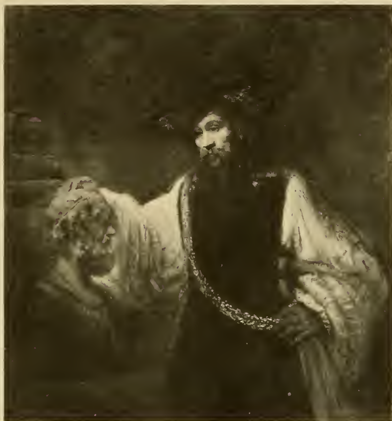
THE SAVANT BY REMBRANDT