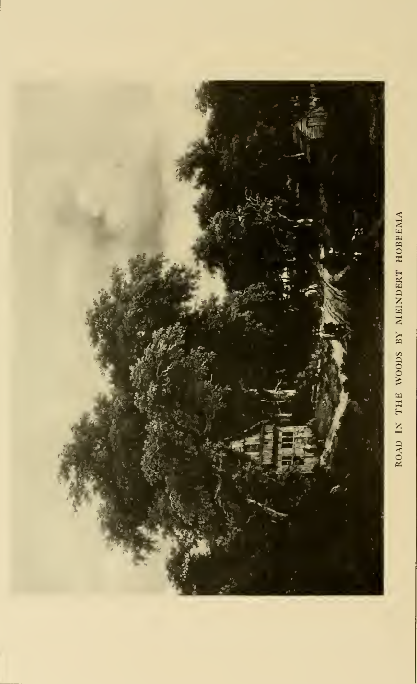
ROAD IN THE WOODS BY MEINDERT HOBBERMA