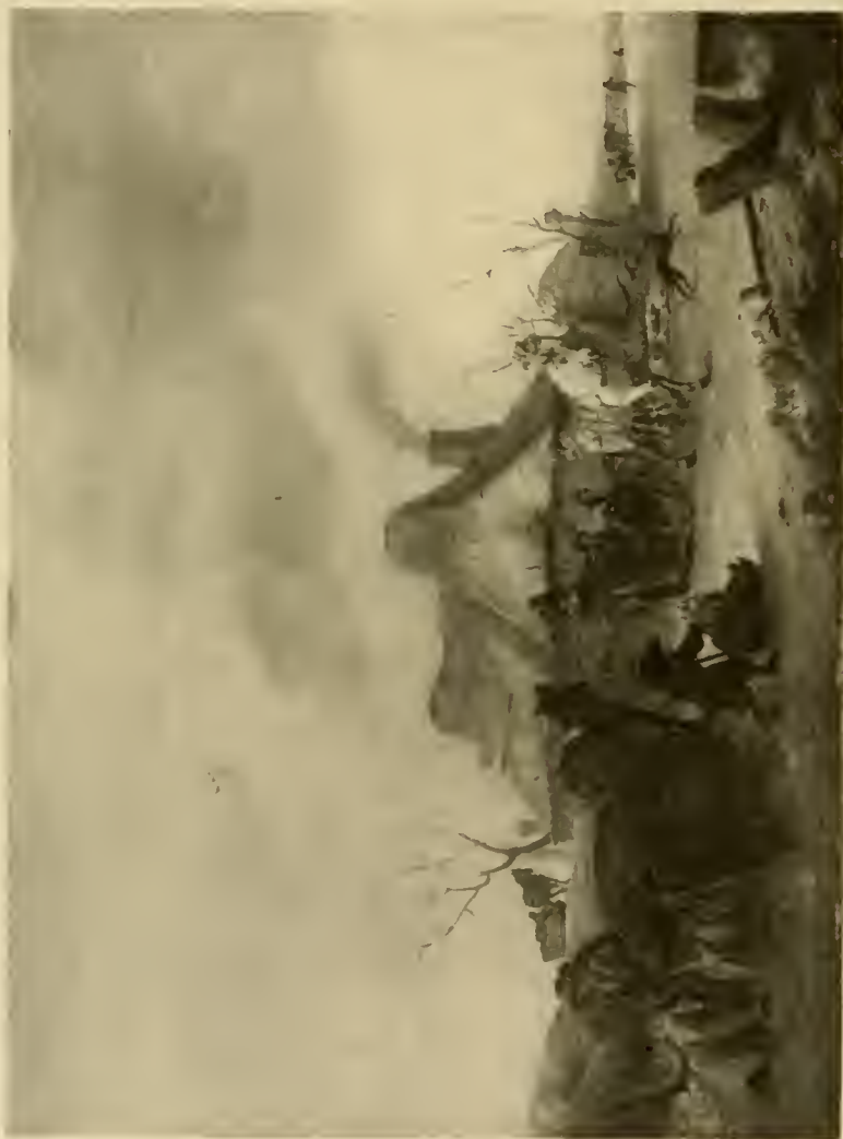
FROZEN CANAL BY PHILIPS WOUWERMAN