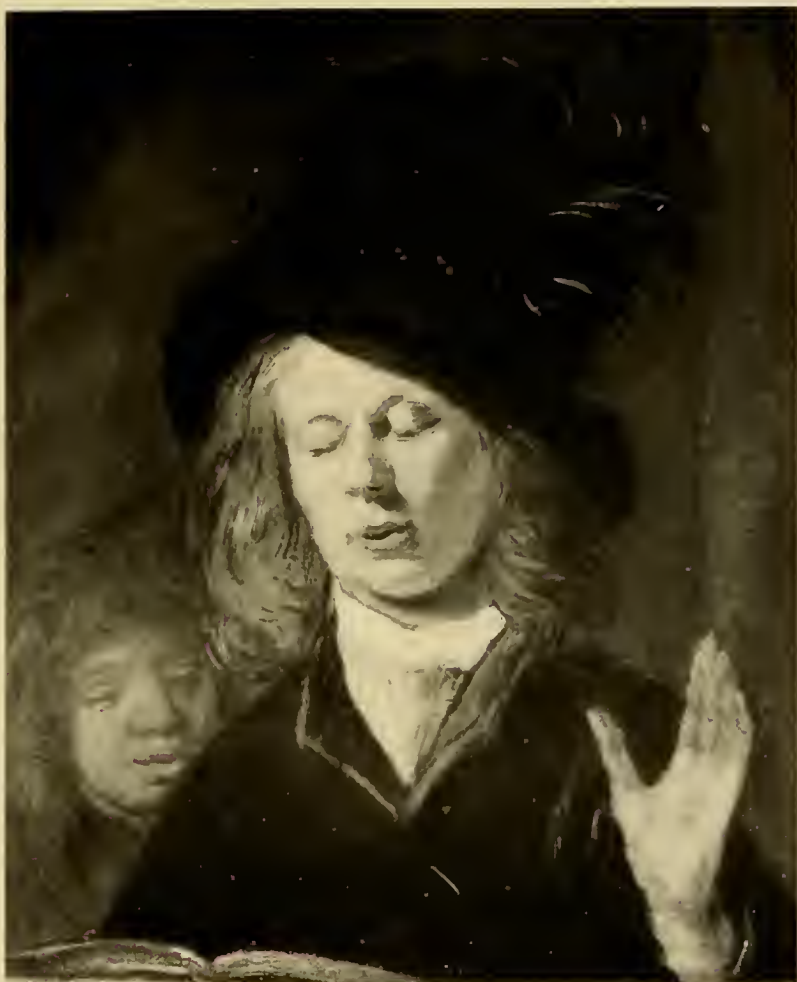
SINGING BOYS BY FRANS HALS