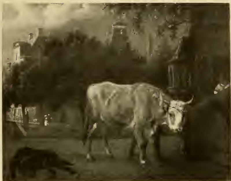
BULL IN THE STREET BY JAN VAN DER HEYDEN