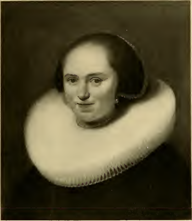
PORTRAIT OF A YOUNG WOMAN BY REMBRANDT