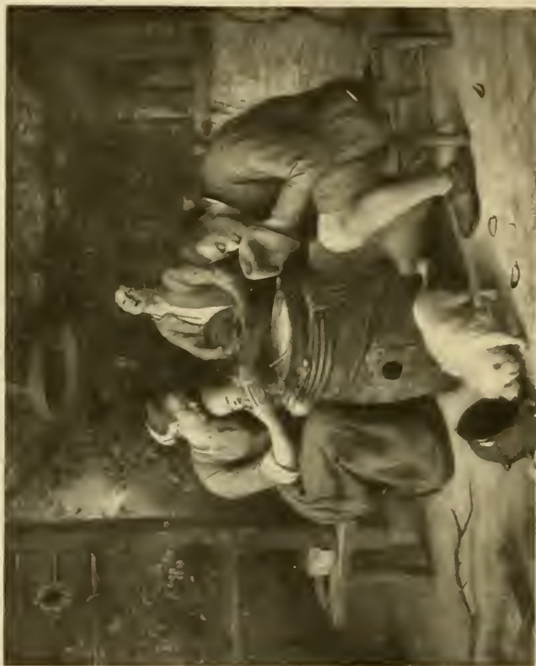
GRACE BEFORE MEAT BY JAN STEEN