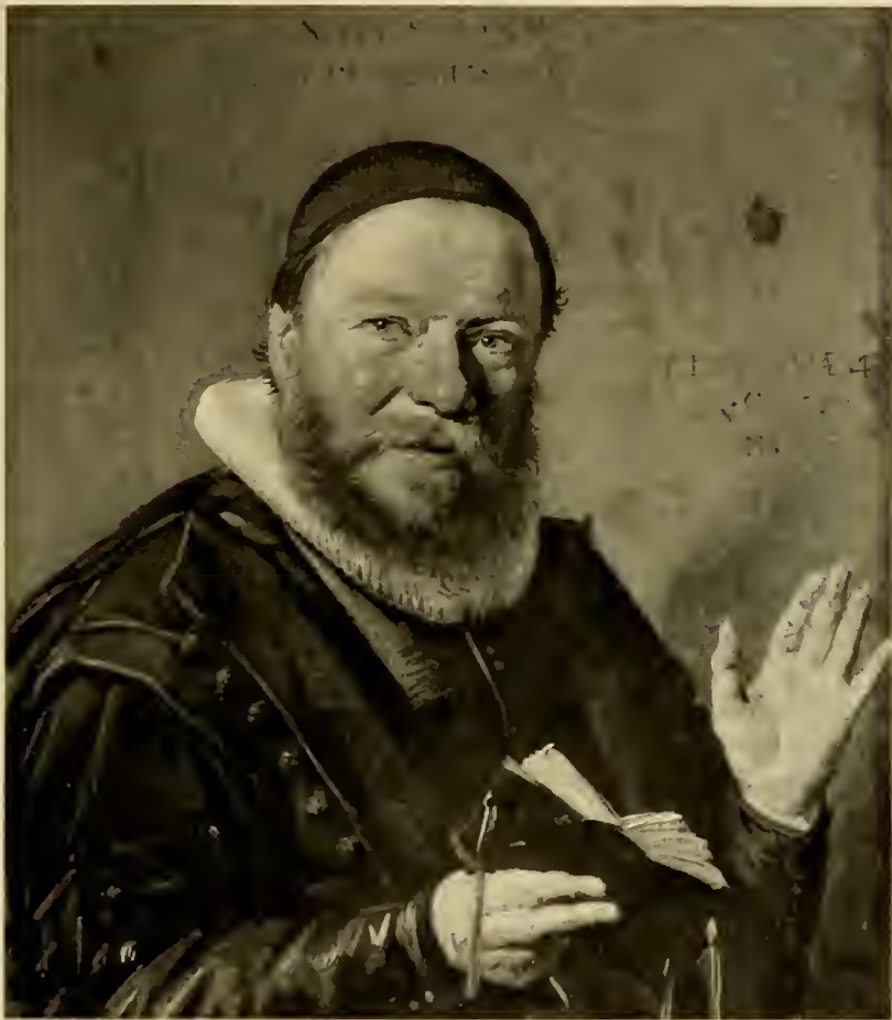
THE REV. CASPAR SIBELIUS BY FRANZ HALS