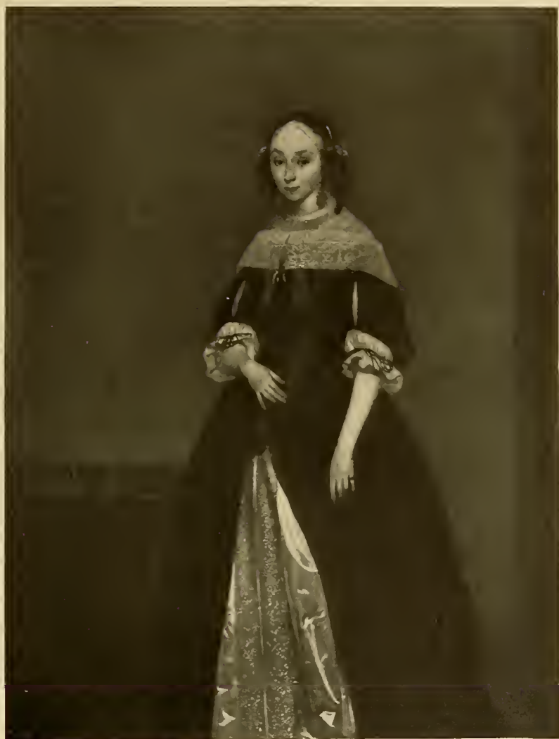
- PORTRAIT OF A LADY BY GERARD TERBORCH