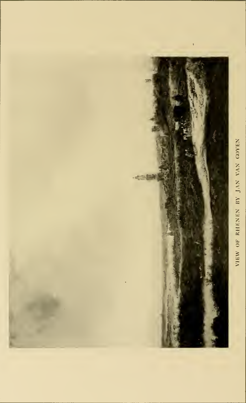
VIEW OF RIIENEN BY JAN VAN GOYEN