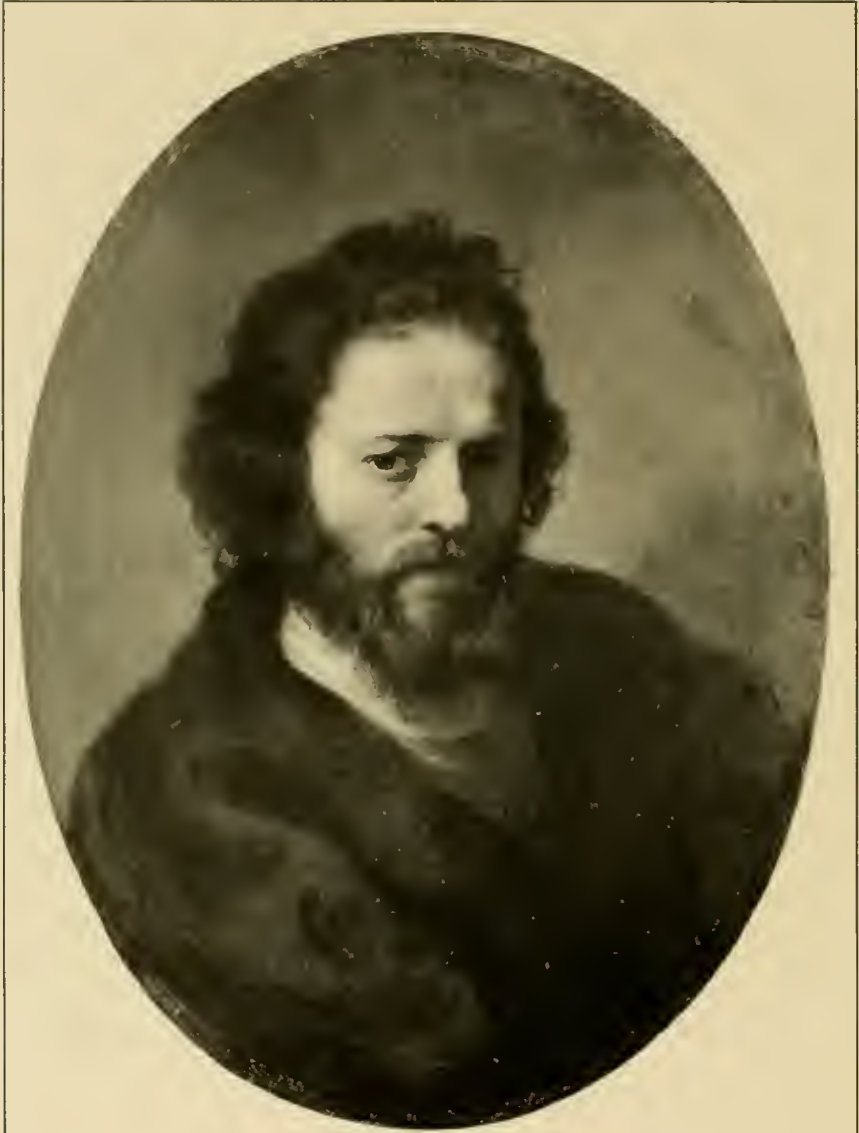
SAINT JOHN THE BAPTIST BY REMBRANDT