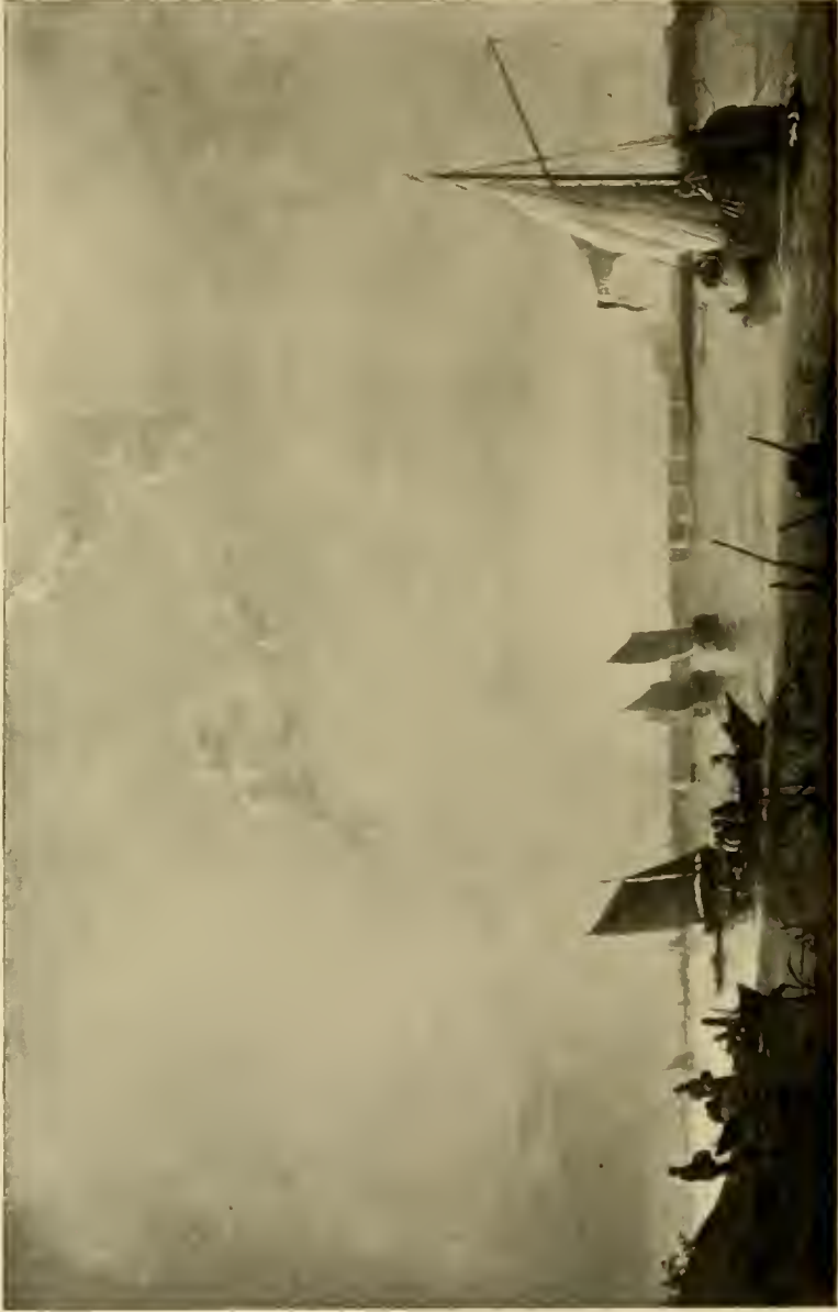
THE MAAS NEAR DORDRECHT BY AELBERT CUYP