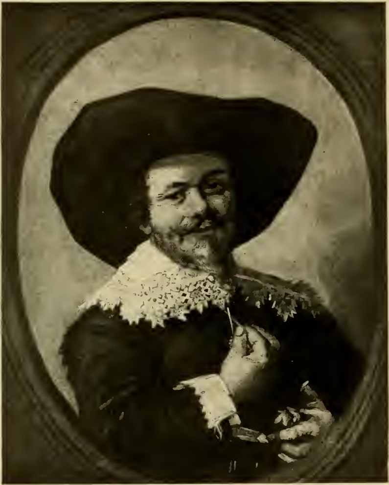
WILHEM VAN HEYTHUYSEN BY FRANS HALS