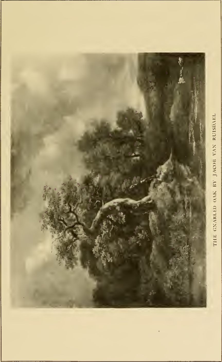
THE GNARLED OAK BY JACOB VAN RUISDAEL