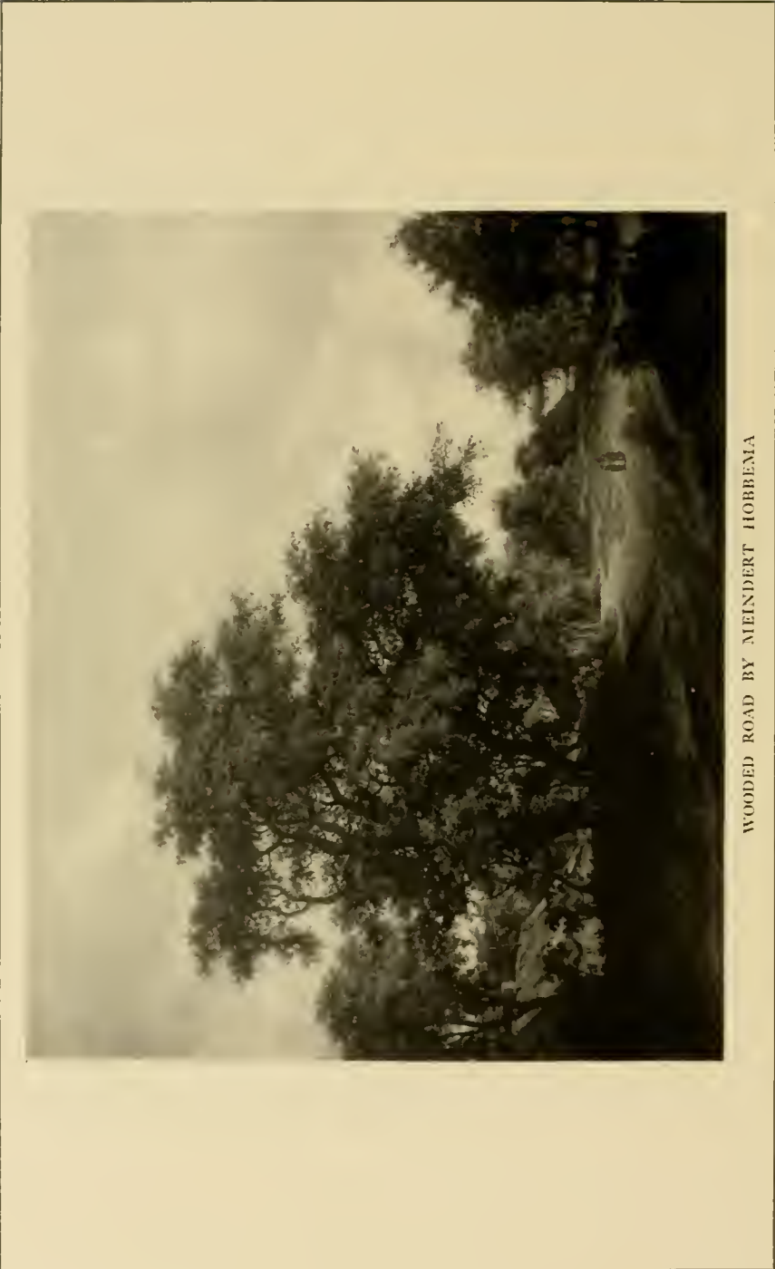
WOODED ROAD BY MEINDERT HOBBERMA