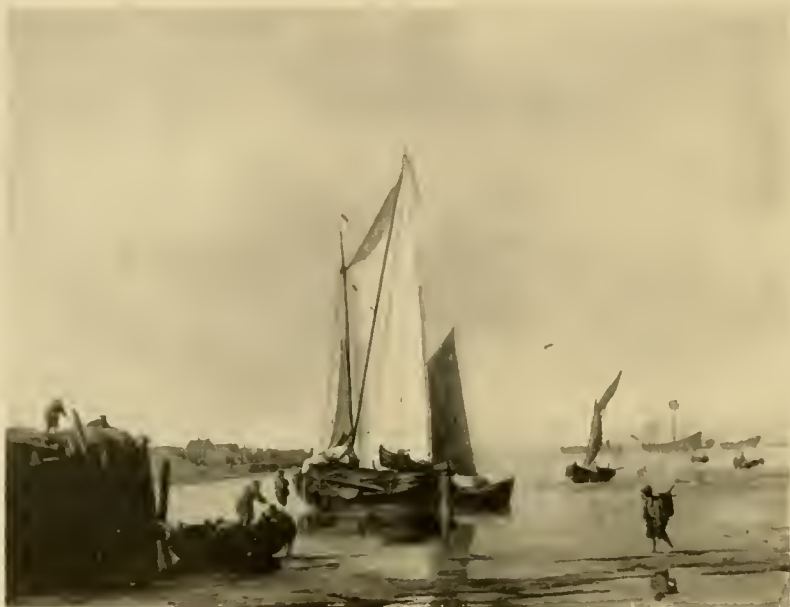
CALM SEA BY WILLEM VAN DE VELDE