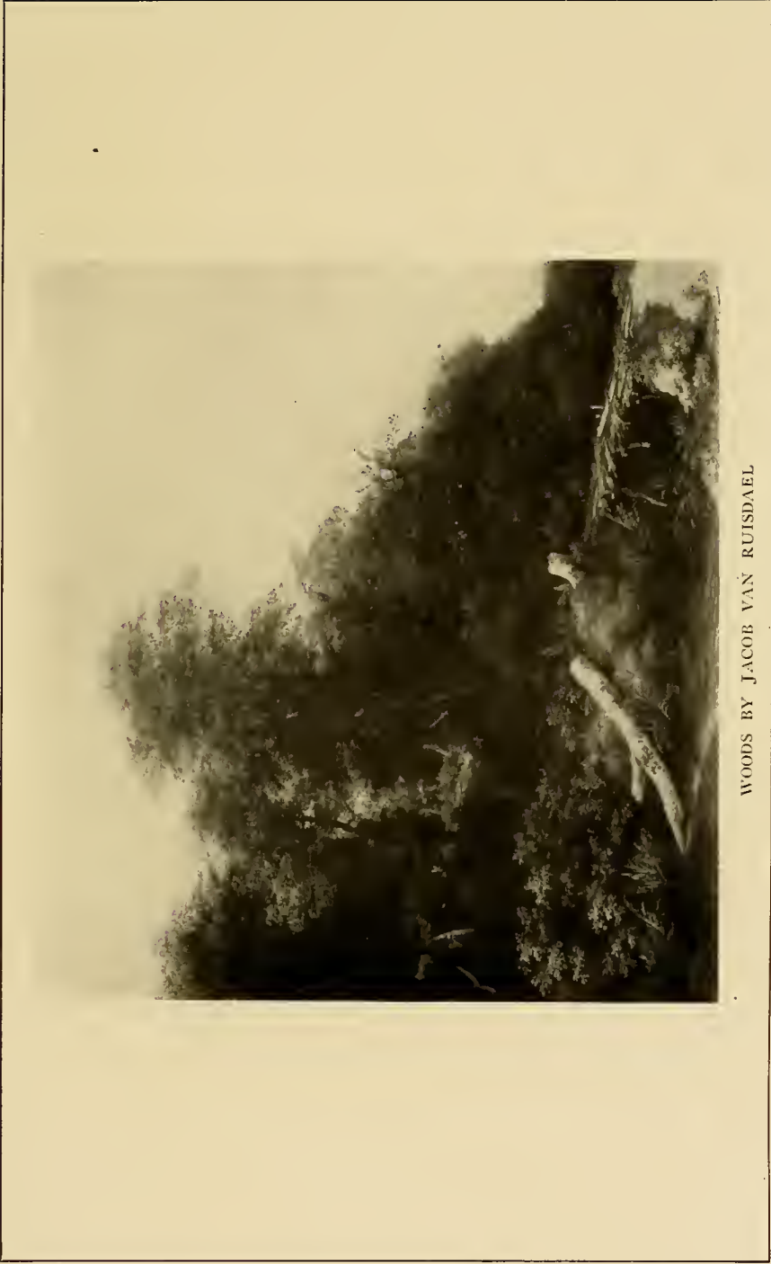
WOODS BY JACOB VAN RUISDAEL