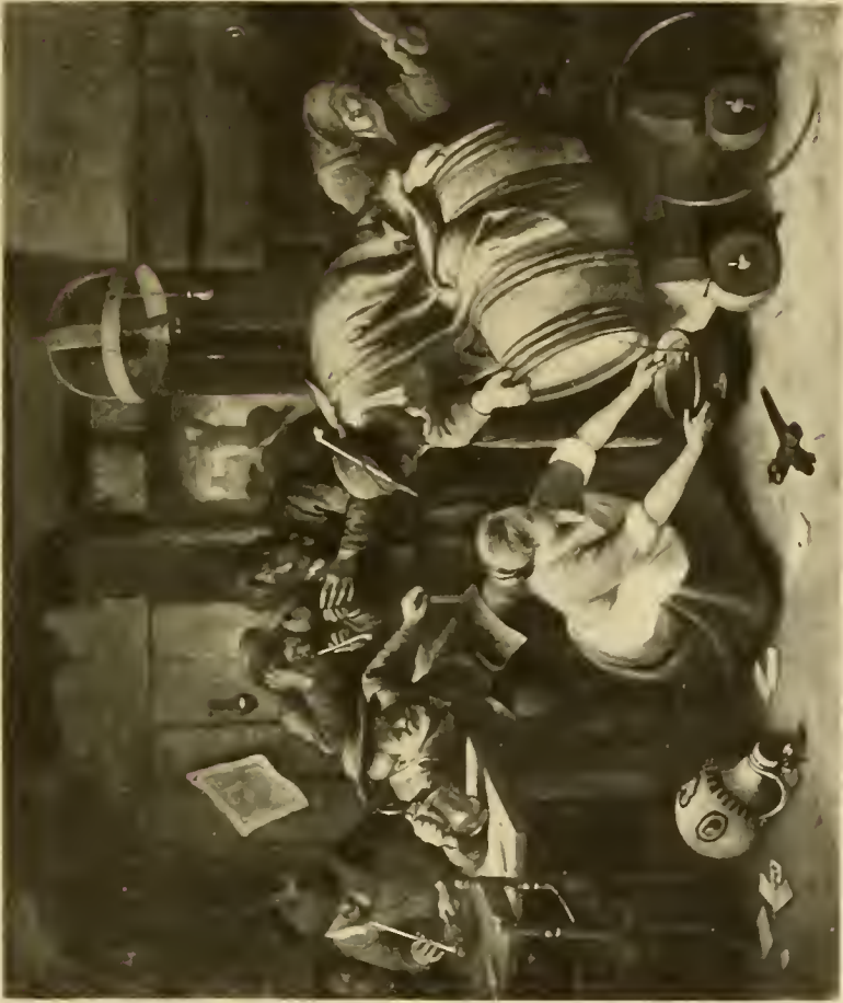
THE DRAINED CASK BY JAN STEEN