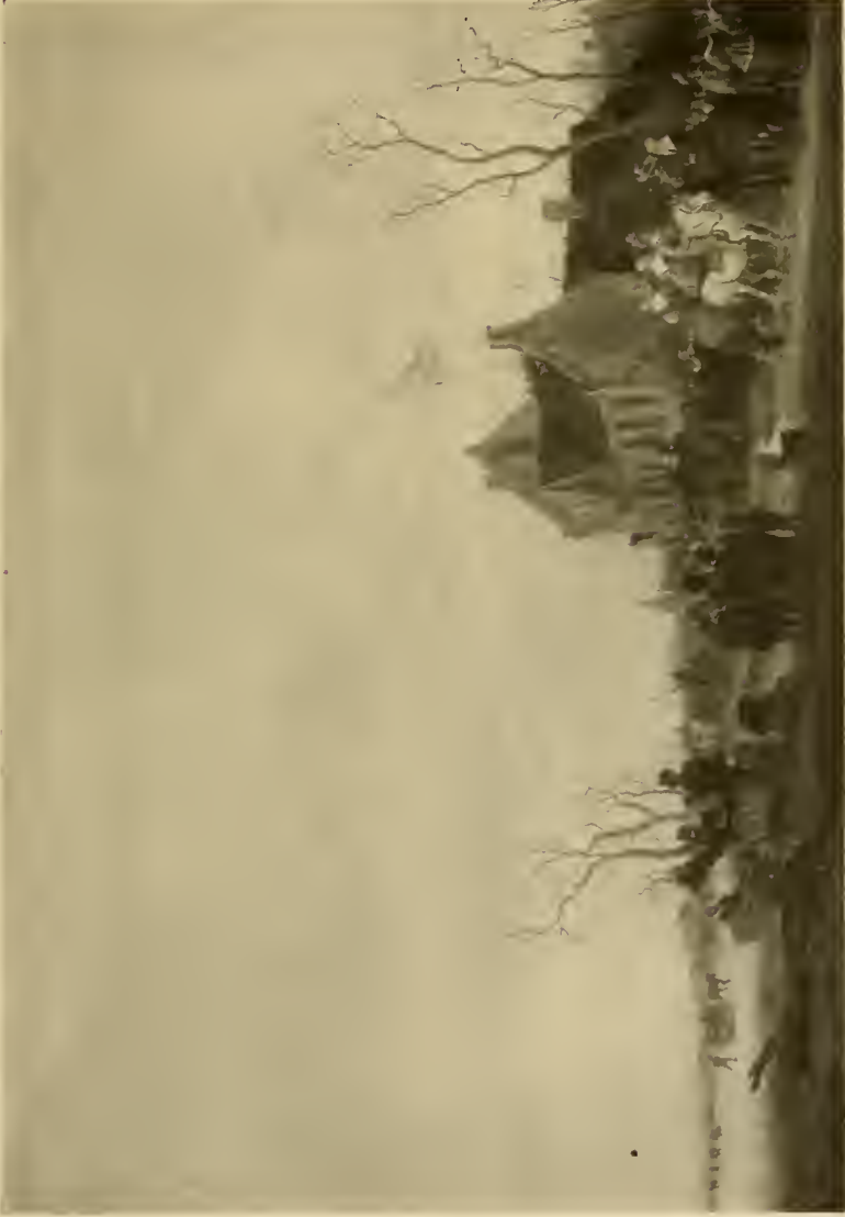
WINTER SCENE BY SALOMON VAN RUYSDAEL