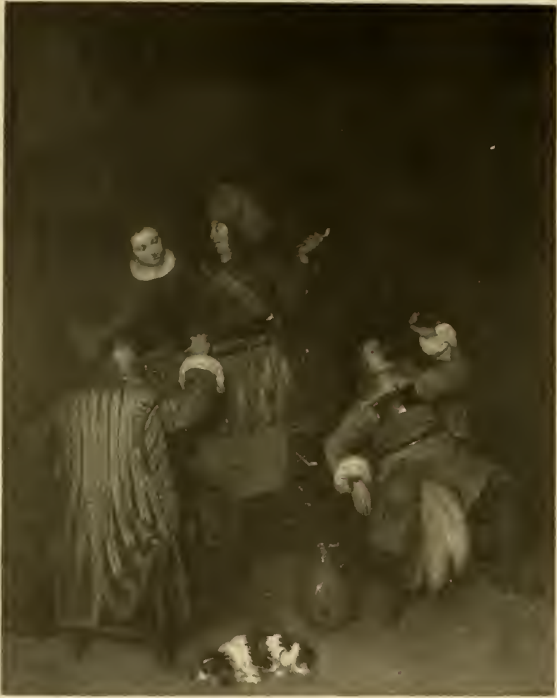
THE GUARD-ROOM BY GERARD TERBORCH