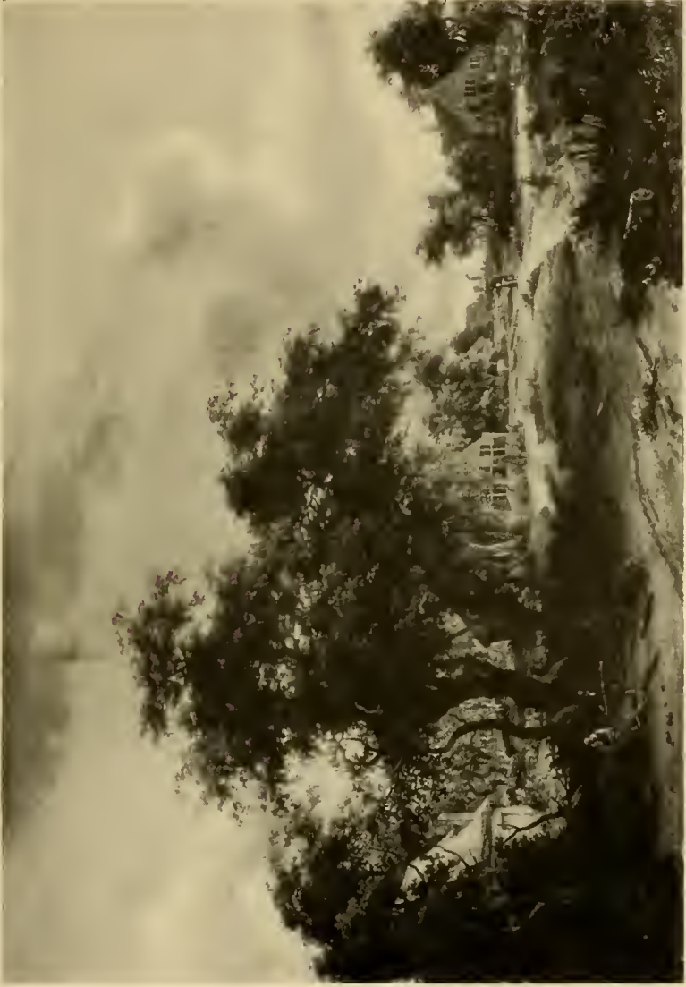
COTTAGE AMONG TREES BY MEINDERT HOBBERMA