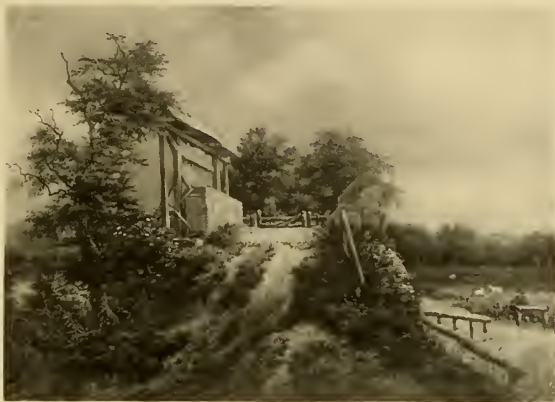
THE SLUICE BY JACOB VAN RUISDAEL