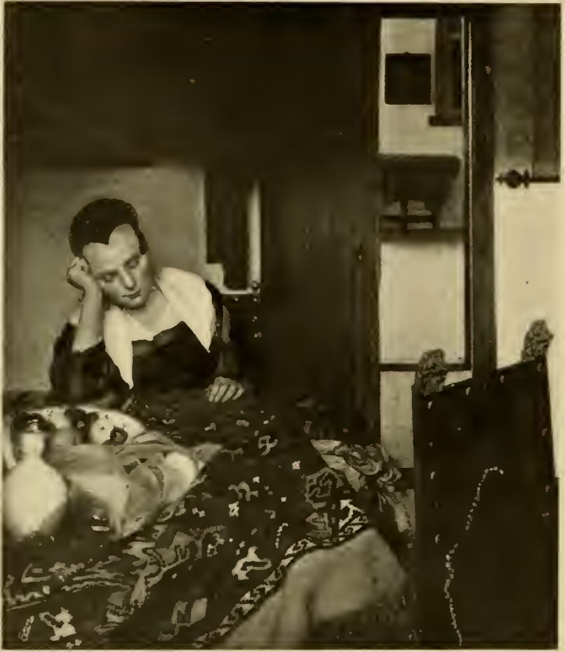
GIRL SLEEPING BY JOHANNES VERMEER