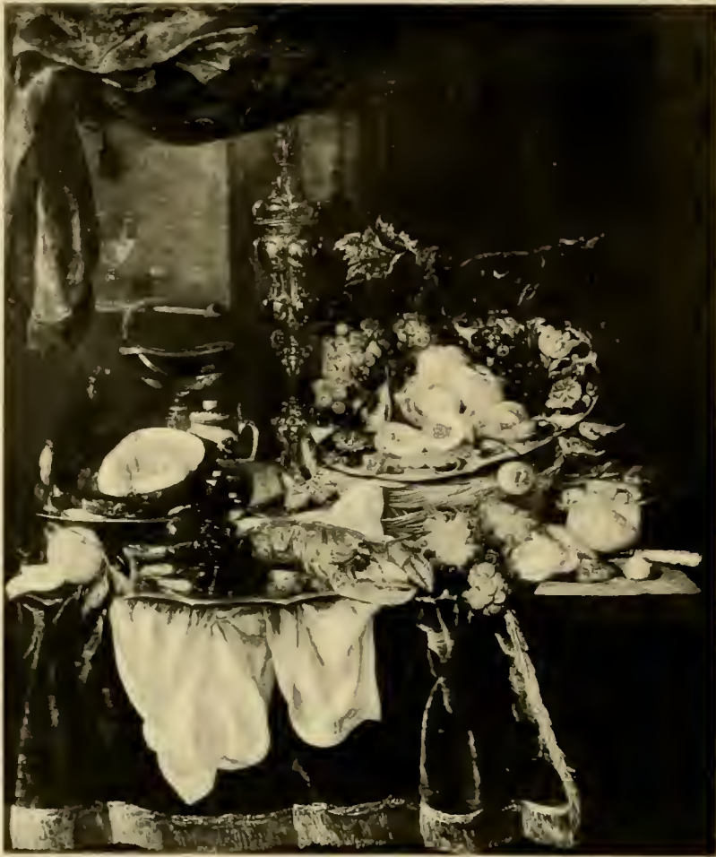
STILL LIFE BY ABRAHAM VAN BEYEREN