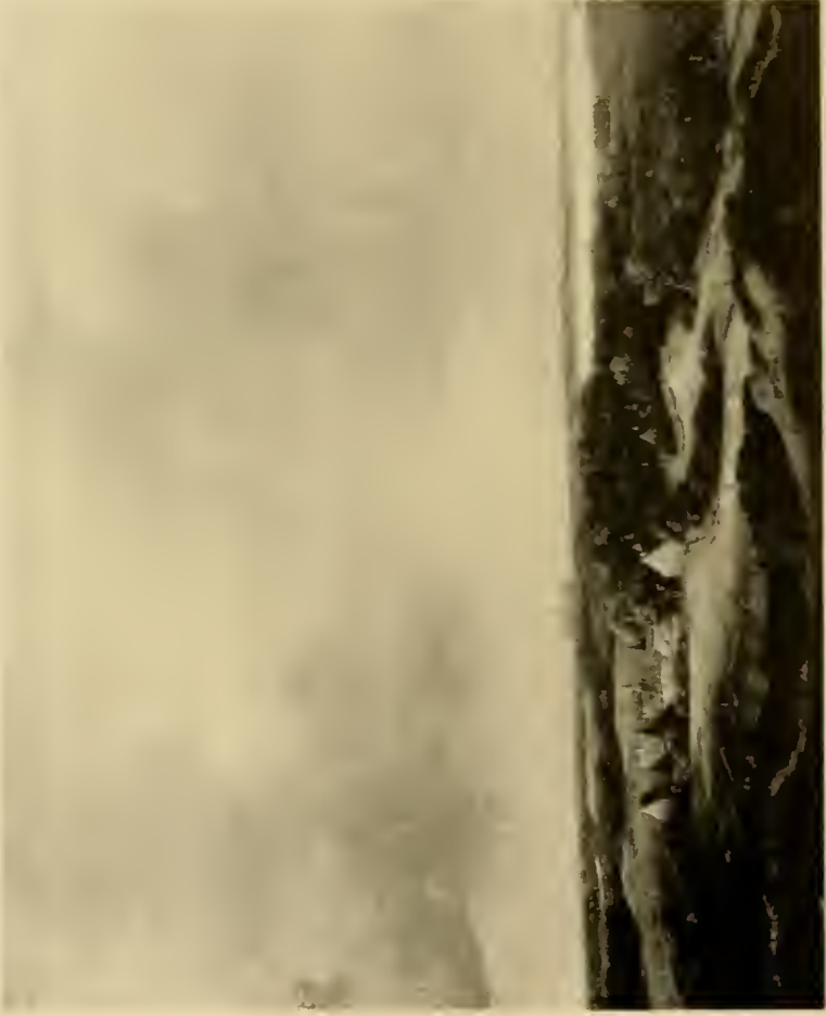
DUNES NEAR HAARLEM BY JACOB VAN RUISDAEL