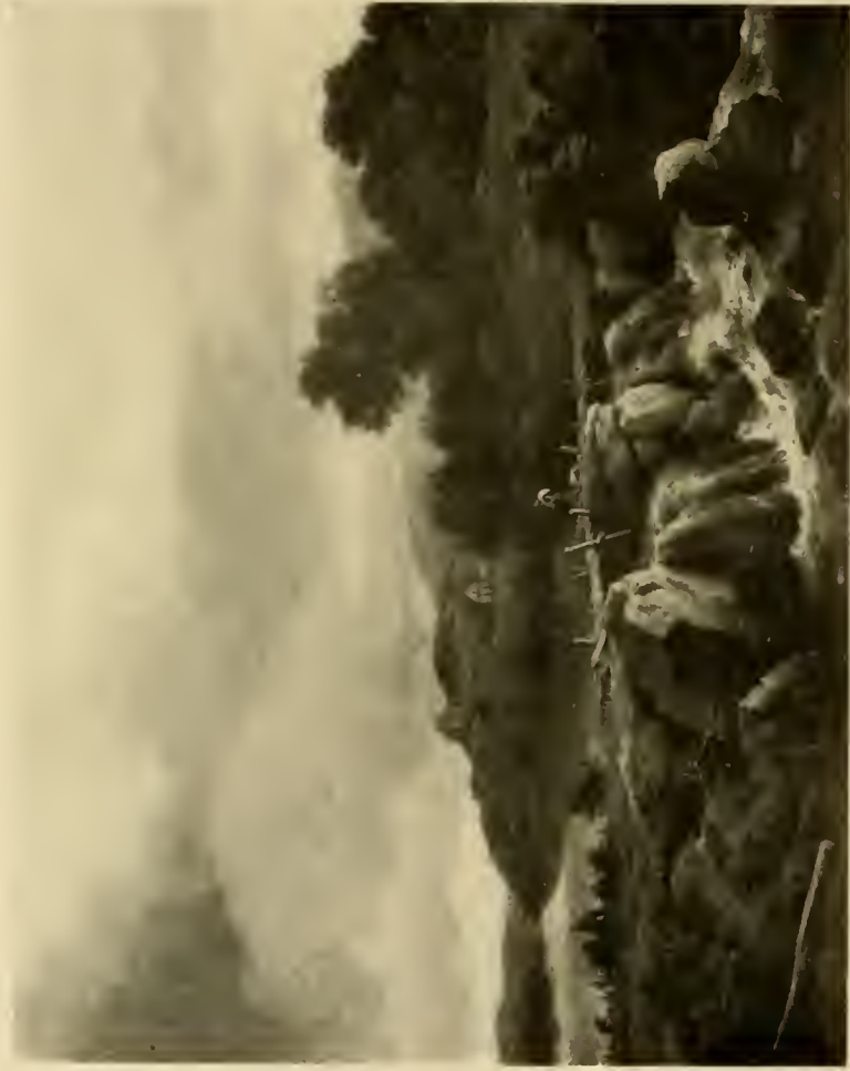
THE CASCADE BY JACOB VAN RUISDAEL