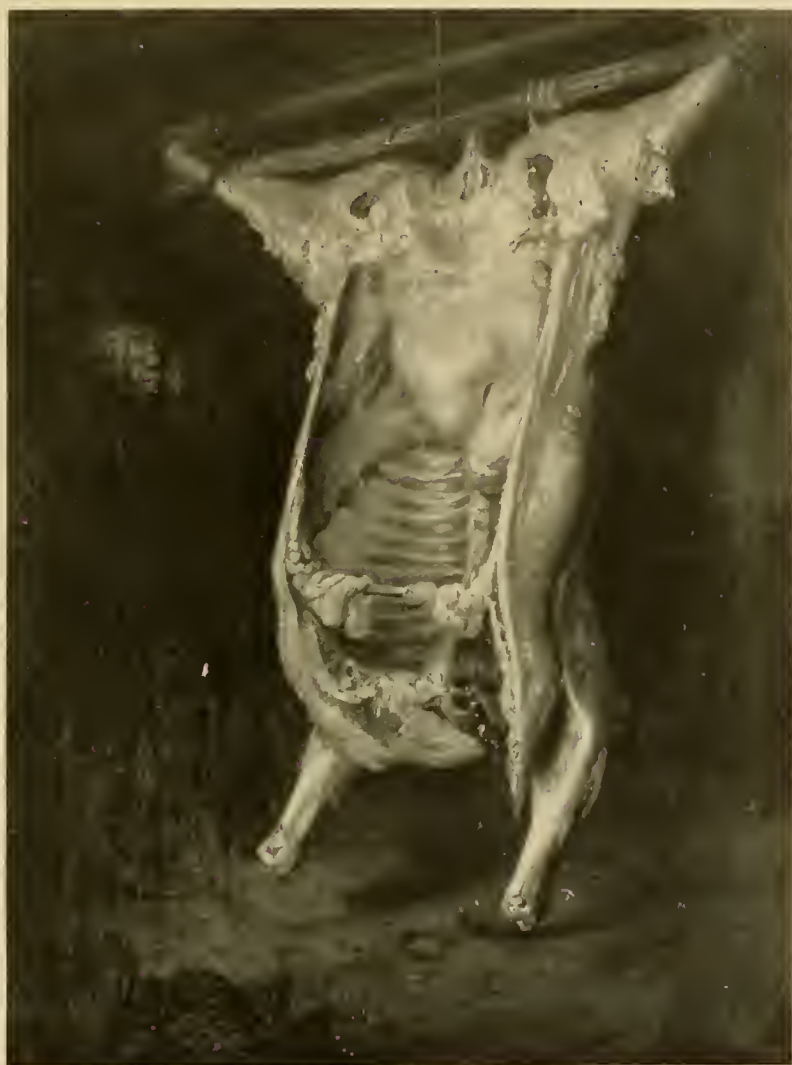
SLAUGHTERED OX BY REMBRANDT