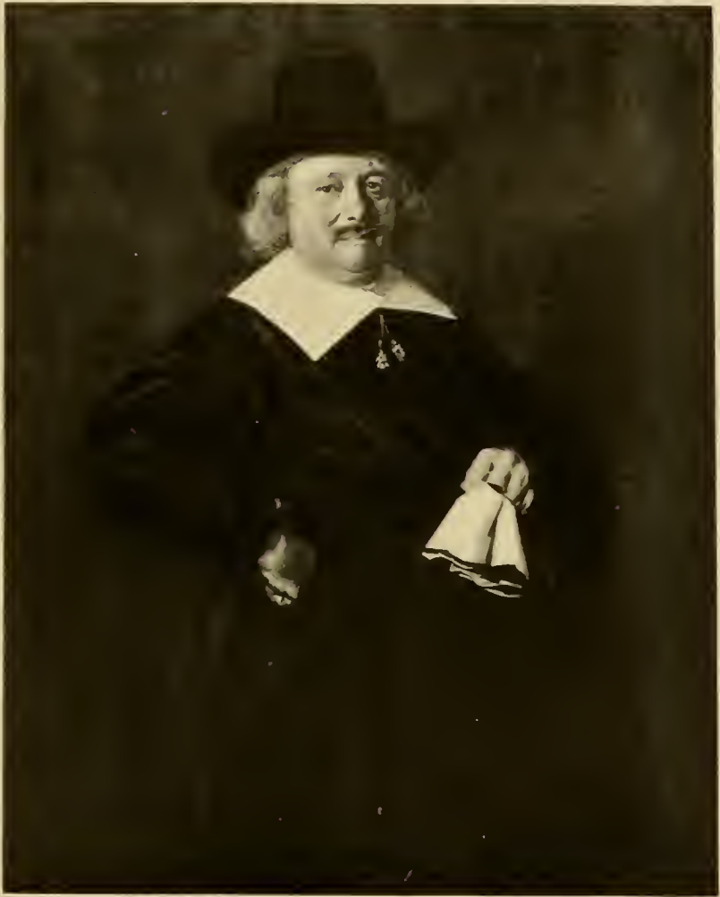
PORTRAIT OF A MAN BY FRANS HALS