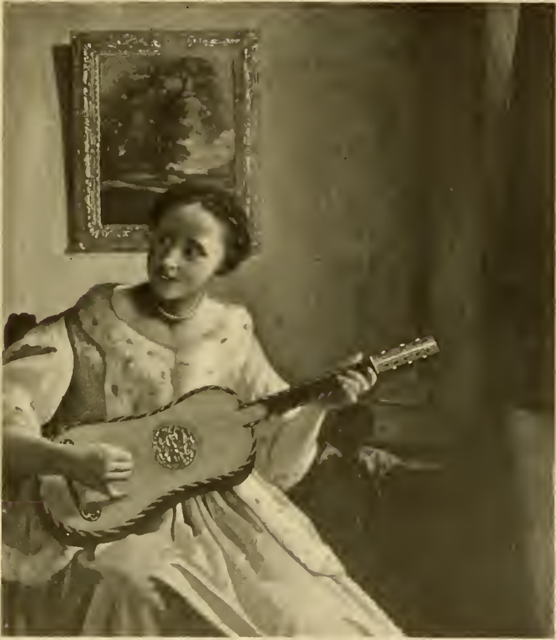
LADY WITH GUITAR BY JOHANNES VERMEER