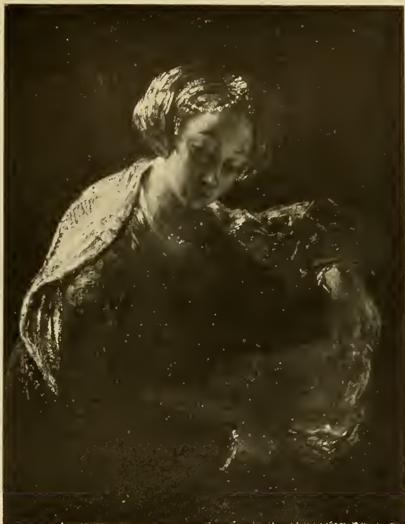
THE SIBYL BY REMBRANDT