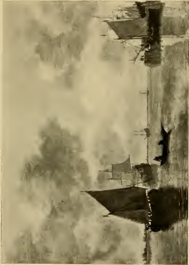
MARINE BY JAN VAN DE CAPELLE