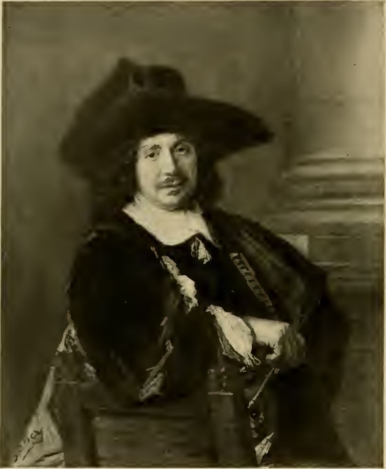
PORTRAIT OF AN ARTIST BY FRANS HALS