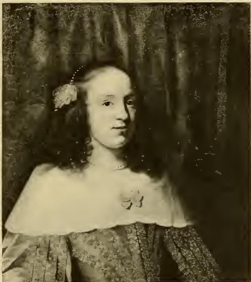
PORTRAIT OF A LADY BY BARTHOLOMEIUS VAN DER HELST