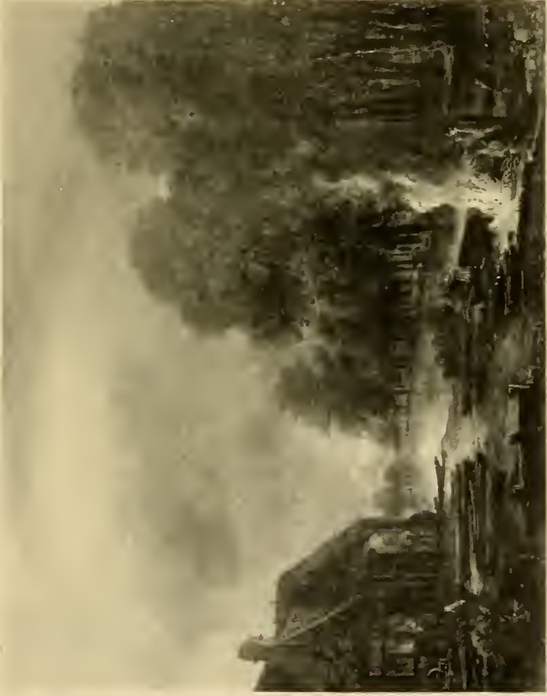
THE FARRIER BY AERT VAN DER NEER