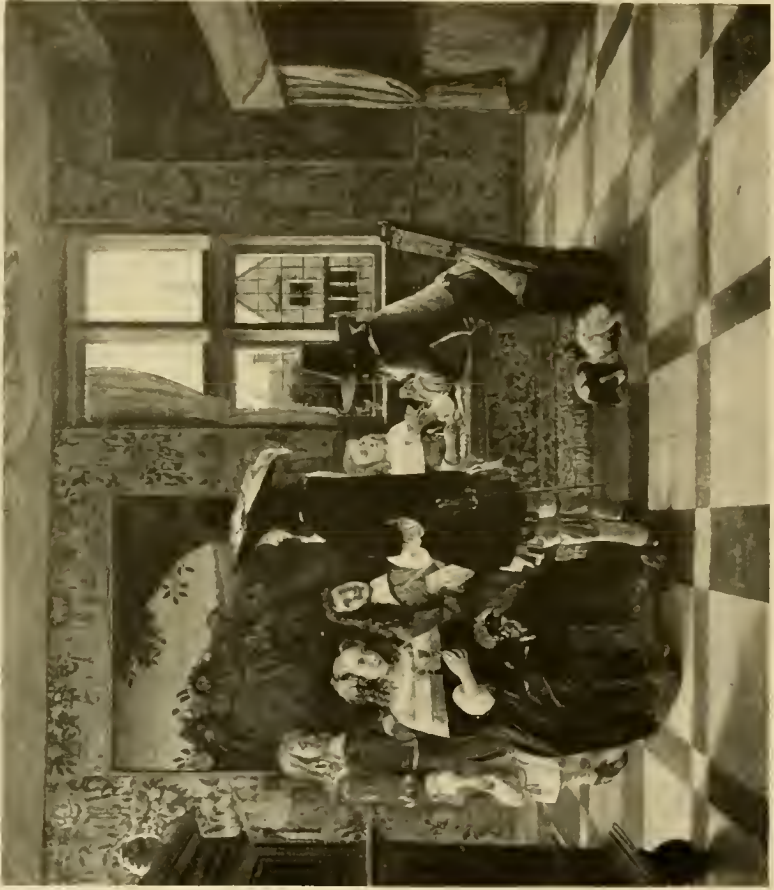
CAVALIERS AND LADIES BY PIETER DE HOOCH