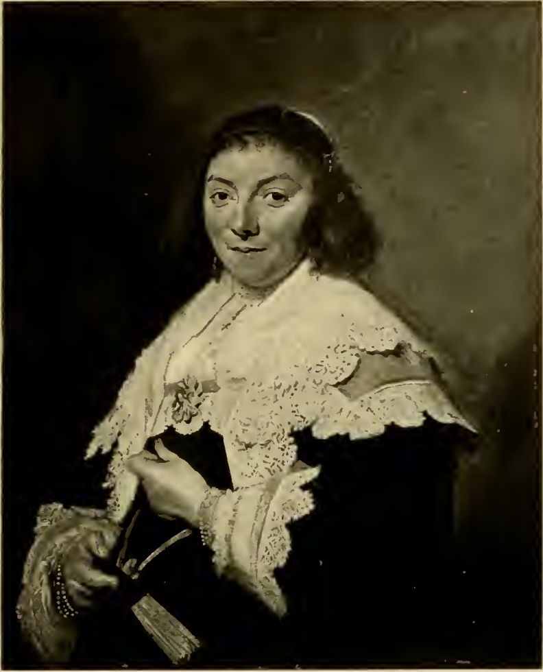
PORTRAIT OF A LADY BY FRANS HALS