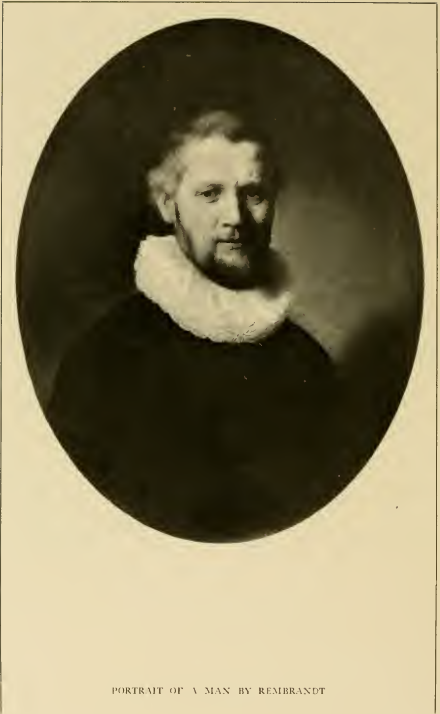
PORTRAIT OF A MAN BY REMBRANDT