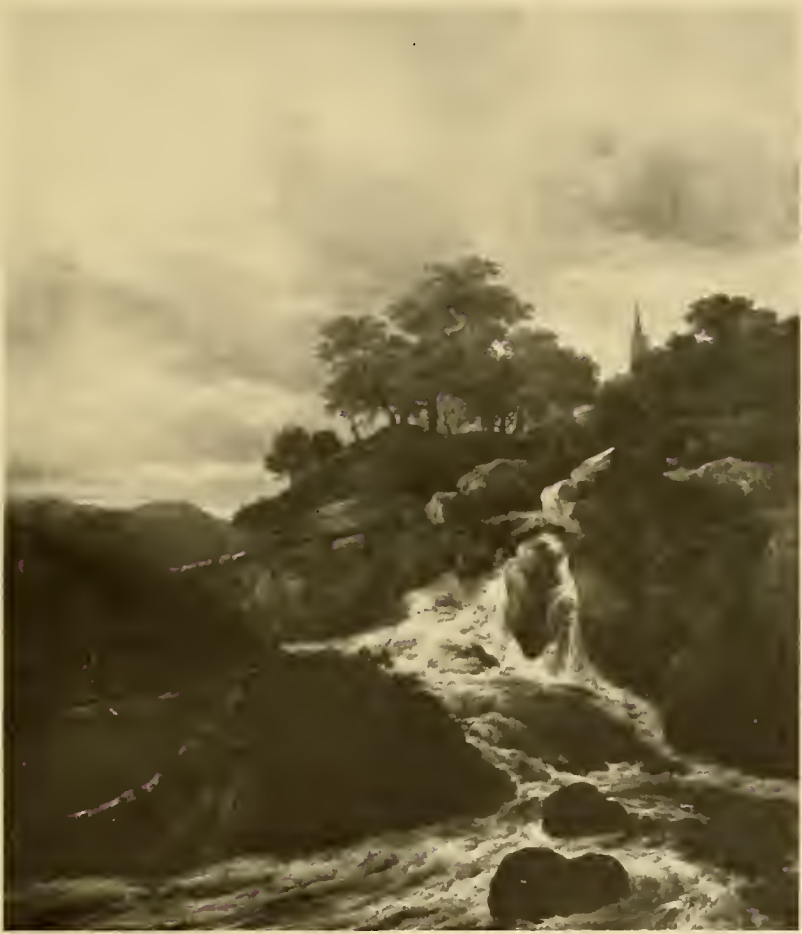
A WATERFALL BY JACOB VAN RUISDAEL