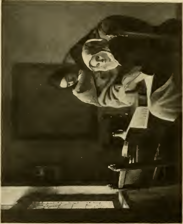
THE MUSIC LESSON BY JOHANNES VERMEER