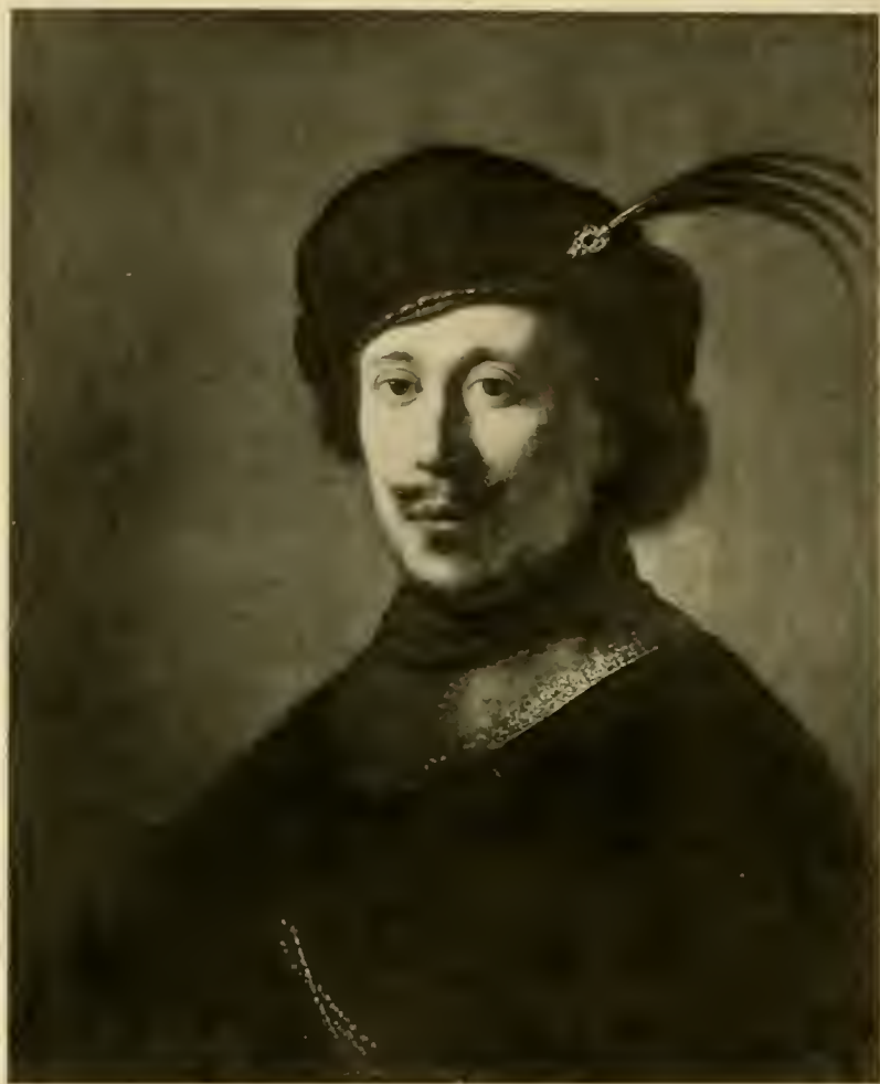
PORTRAIT OF HIMSELF BY REMBRANDT