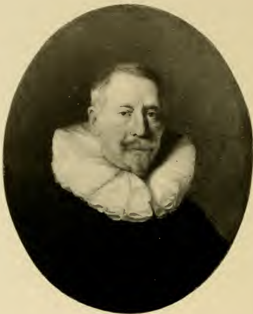
PORTRAIT OF A MAN BY REMBRANDT