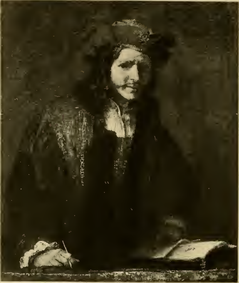
THE ACCOUNTANT BY REMBRANDT