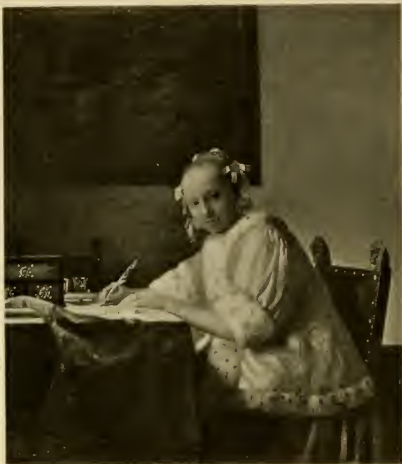
LADY WRITING BY JOHANNES VERMEER