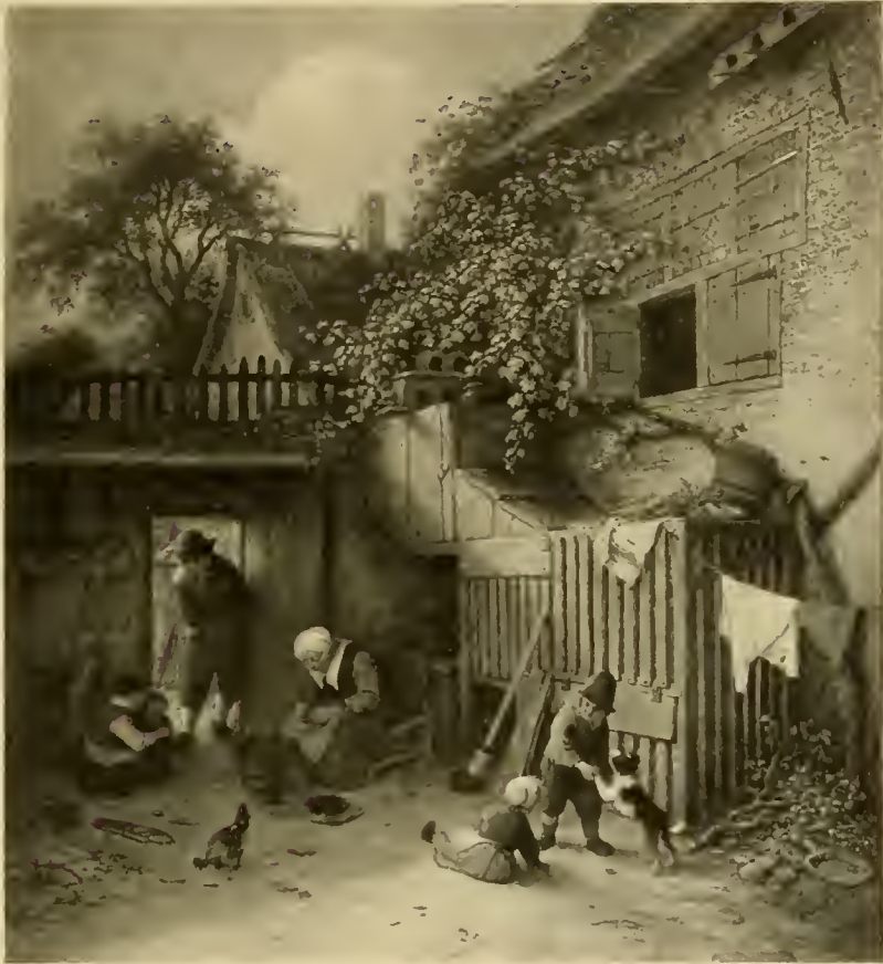
THE COTTAGE DOORYARD BY ADRIAEN VAN OSTADE