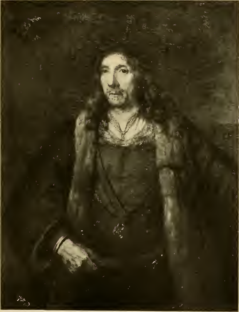
PORTRAIT OF A MAN BY REMBRANDT