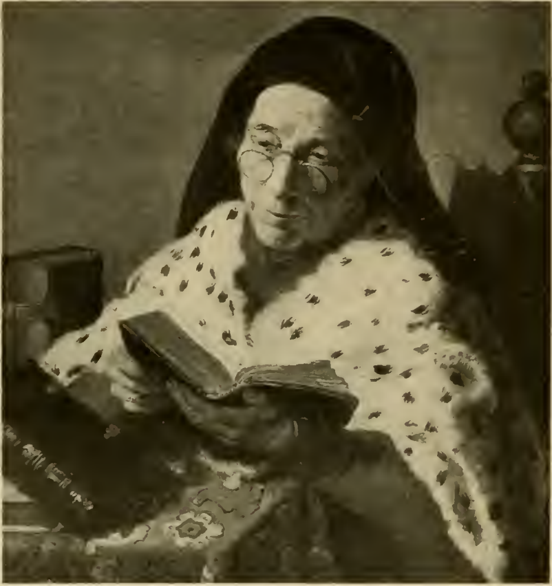
OLD WOMAN BY NICOLAES MAES