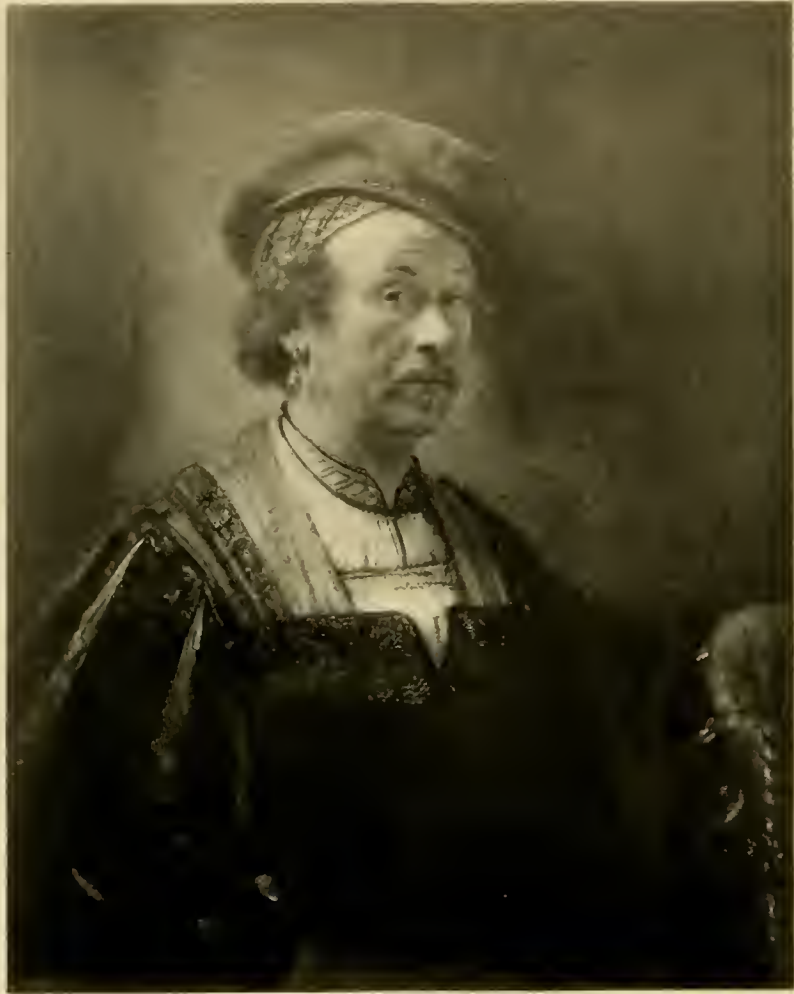
PORTRAIT OF HIMSELF BY REMBRANDT