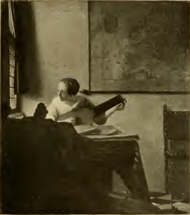
LADY WITH LUTE BY JOHANNES VERMEER