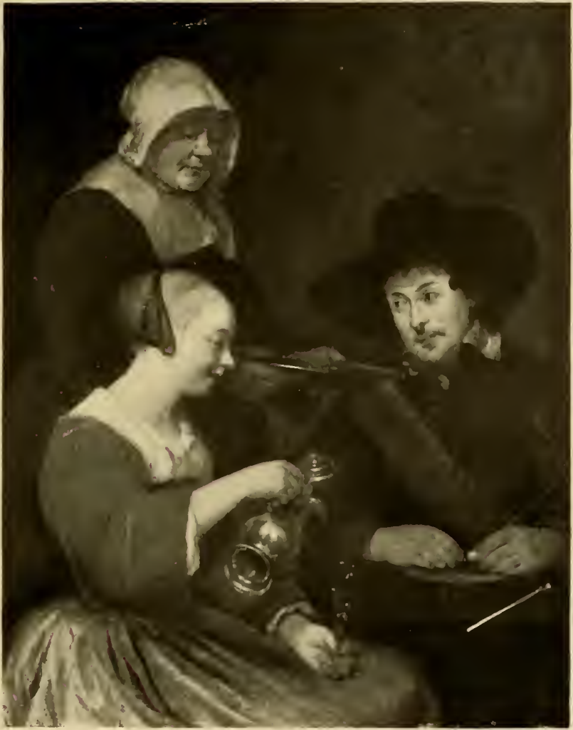
LADY POURING WINE BY GERARD TERBORCH