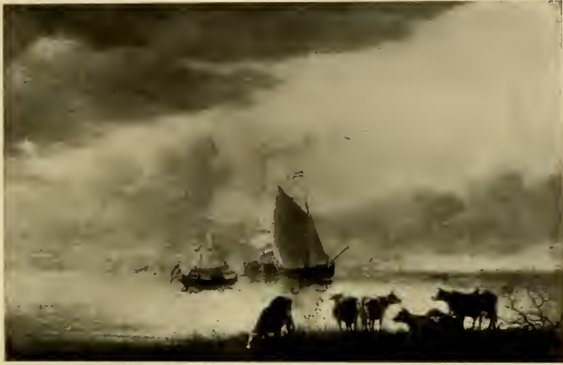
RIVER VIEW BY AELBERT CUYP