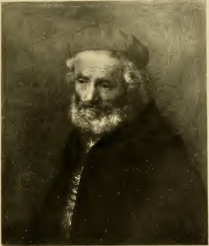
STUDY OF AN OLD MAN BY REMBRANDT