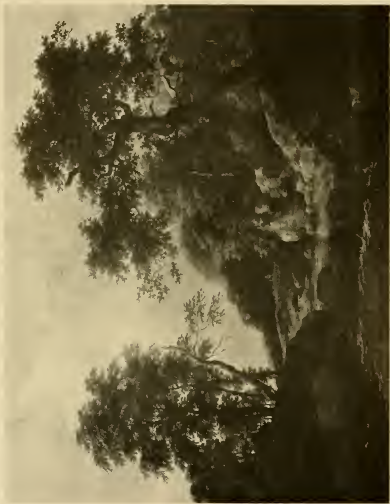
THE FOREST STREAM BY JACOB VAN RUYSDAEL