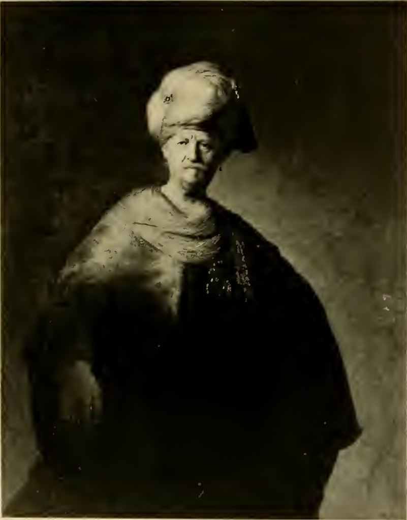
THE NOBLE SLAV BY REMBRANDT