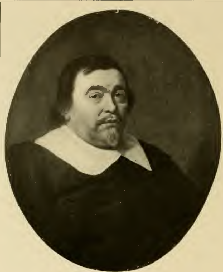
PORTRAIT OF A MAN BY BARTHOLOMEUS VAN DER HELST