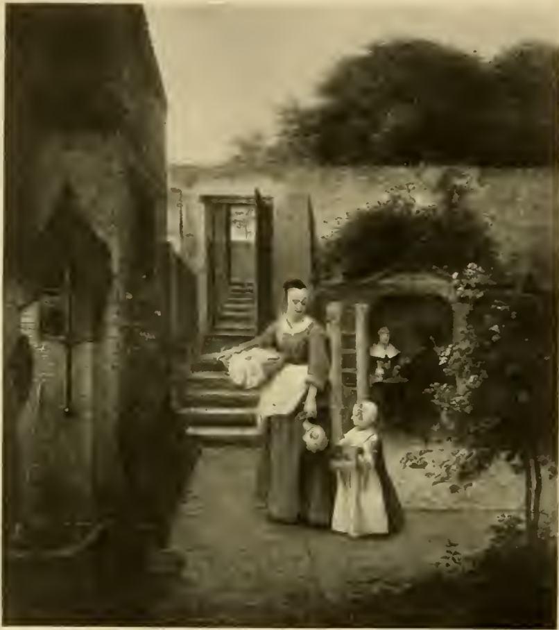
WOMAN AND CHILD IN COURTYARD BY PIETER DE HOECH