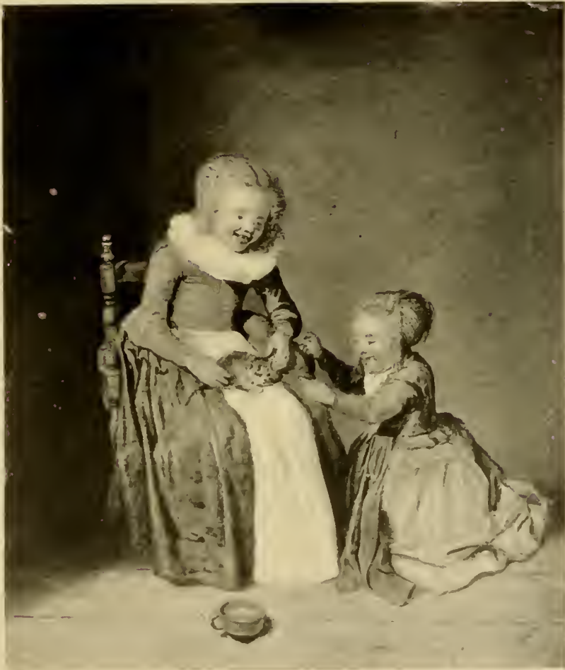
GIRLS WITH A CAT BY DIRK HALS