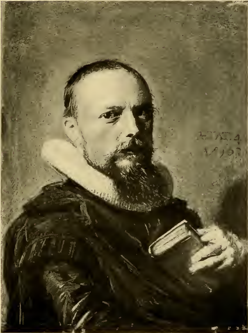
SAMUEL AMPZING BY FRANS HALS