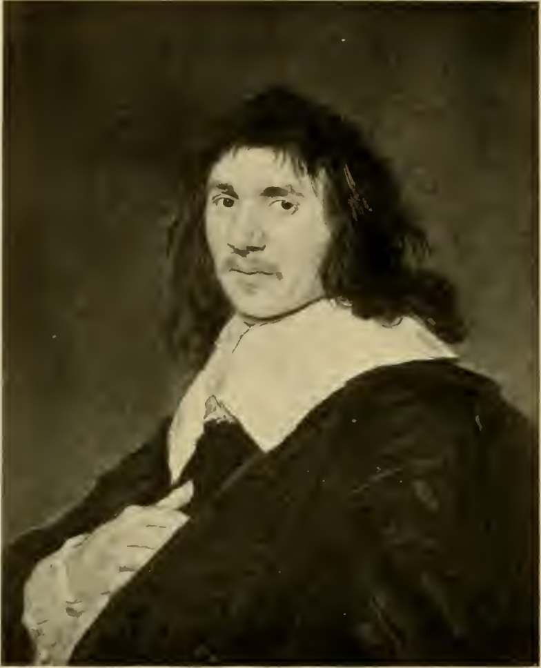
PORTRAIT OF A MAN BY FRANS HALS