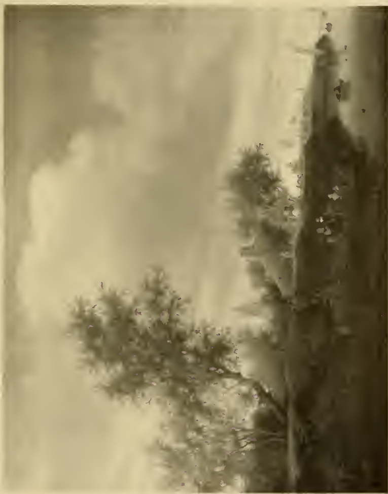
CANAL SCENE BY SALOMON VAN RUYSDAEL