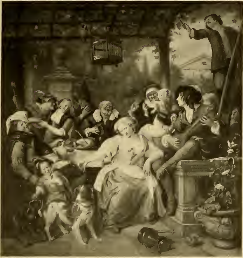
THE MERRYMAKERS BY JAN STEEN