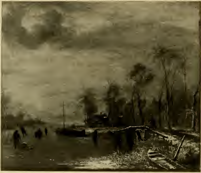
WINTER SCENE BY JAN VAN DE CAPELLE