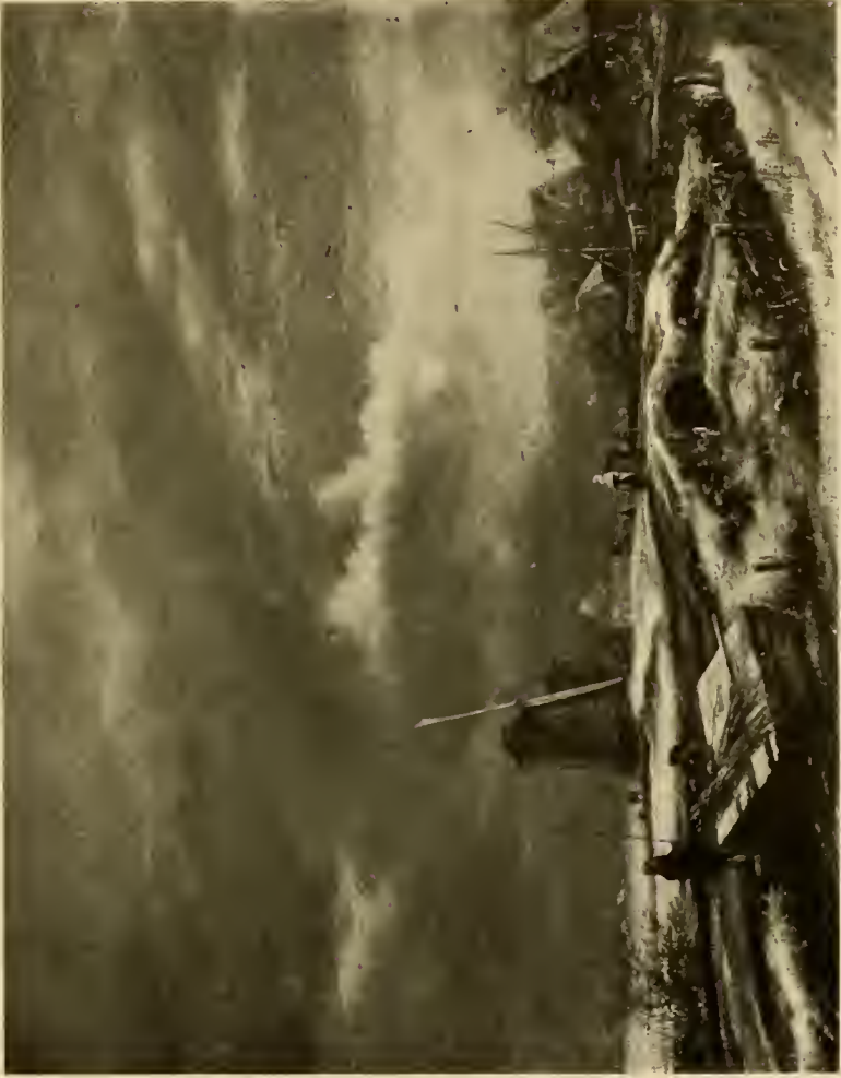
WINTER LANDSCAPE BY JACOB VAN RUISDAEL