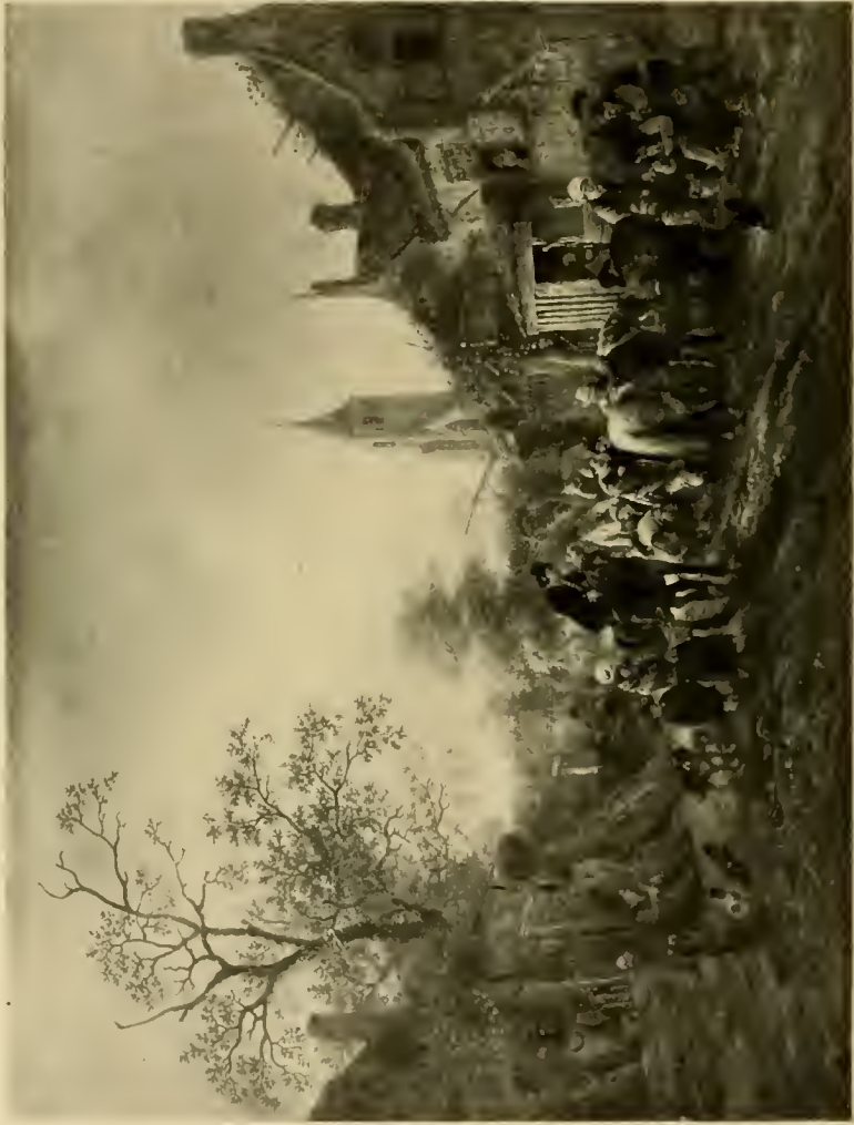
THE HALT BY ISACK VAN OSTADE