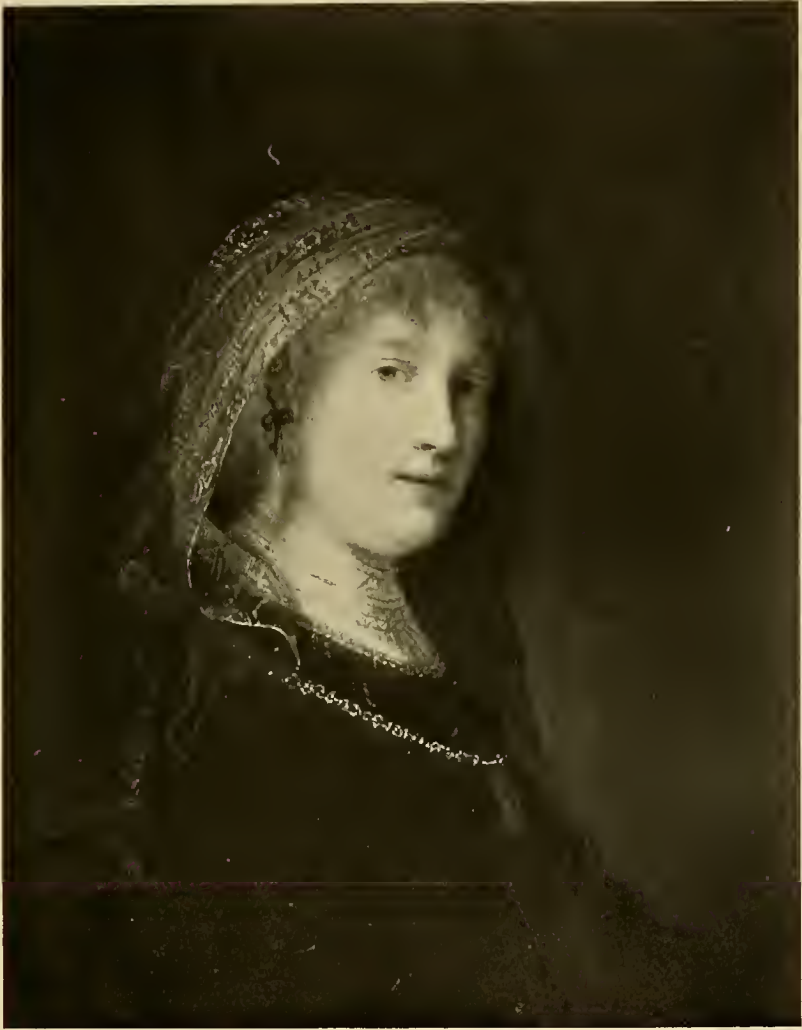
SASKIA BY REMBRANDT