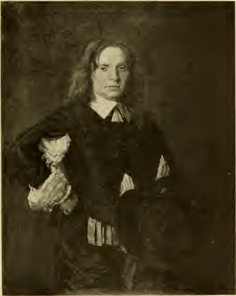
PORTRAIT OF A MAN BY FRANS HALS