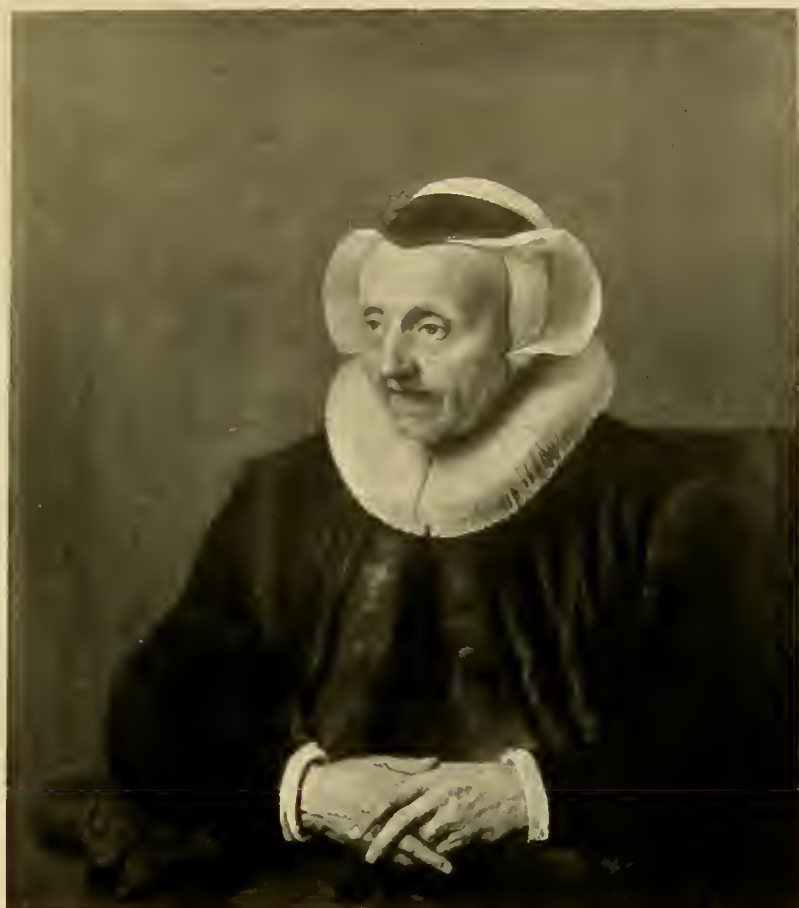
PORTRAIT OF AN OLD WOMAN BY REMBRANDT