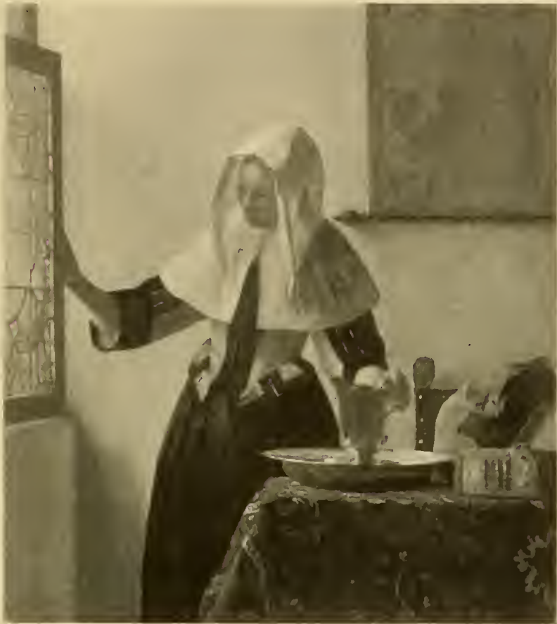
GIRL WITH WATER-JUG BY JOHANNES VERMEER