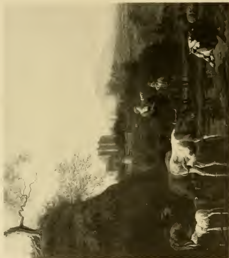
LANDSCAPE WITH CATTLE BY ADRIAEN VAN DE VELDE