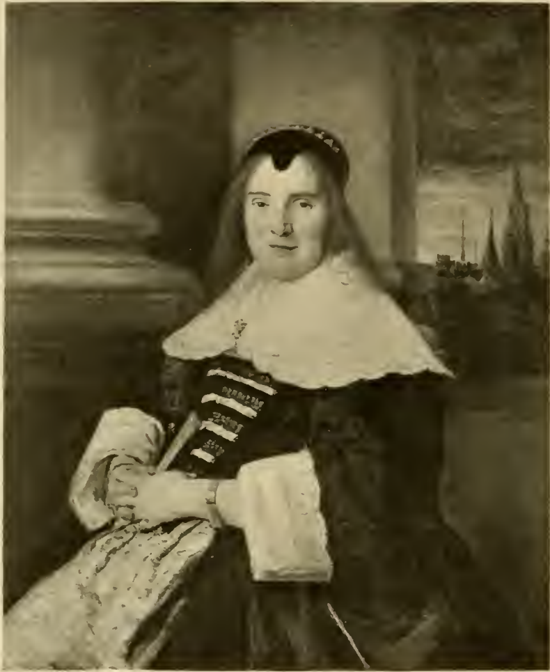
PORTRAIT OF A LADY BY FRANS HALS