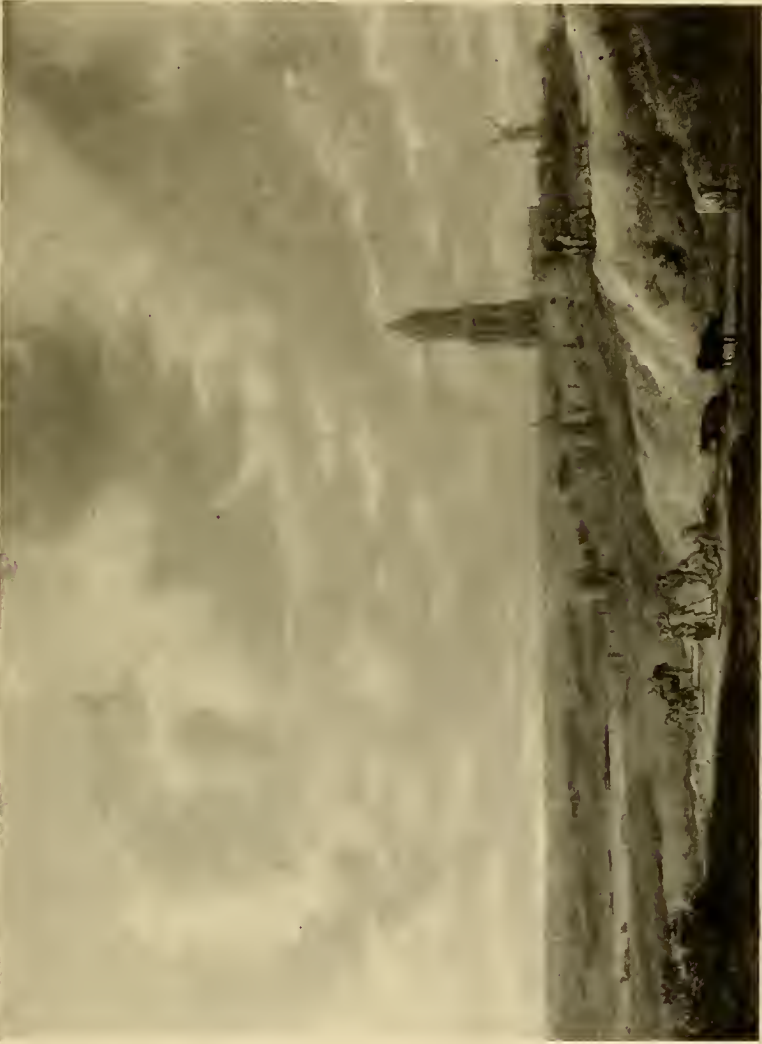
VIEW OF RHENEN BY JAN VAN GOYEN