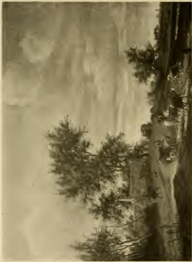
A COUNTRY ROAD BY SALOMON VAN RUYSDAEL