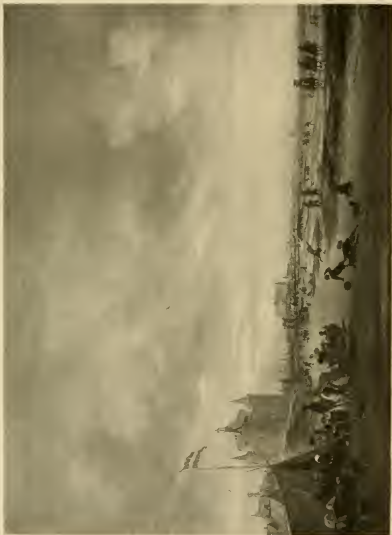
WINTER NEAR HAARLEM BY SALOMON VAN RUYSDAEL