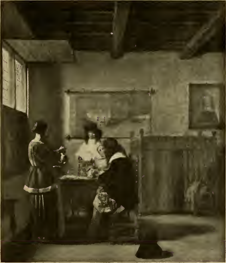
THE VISIT BY PIETER DE HOECH