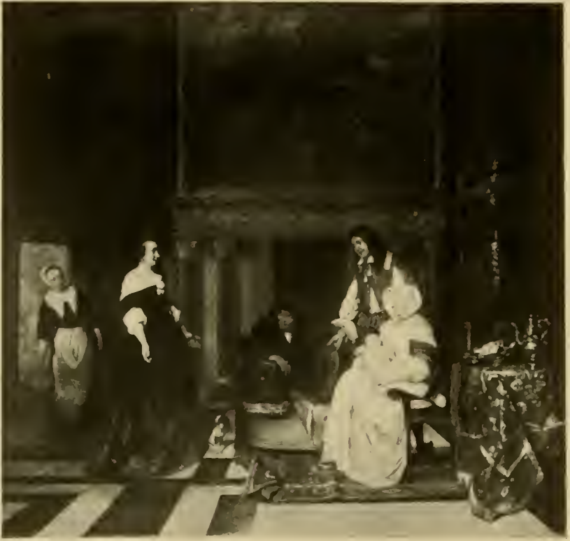
A VISIT TO THE NURSERY BY GABRIEL METSU