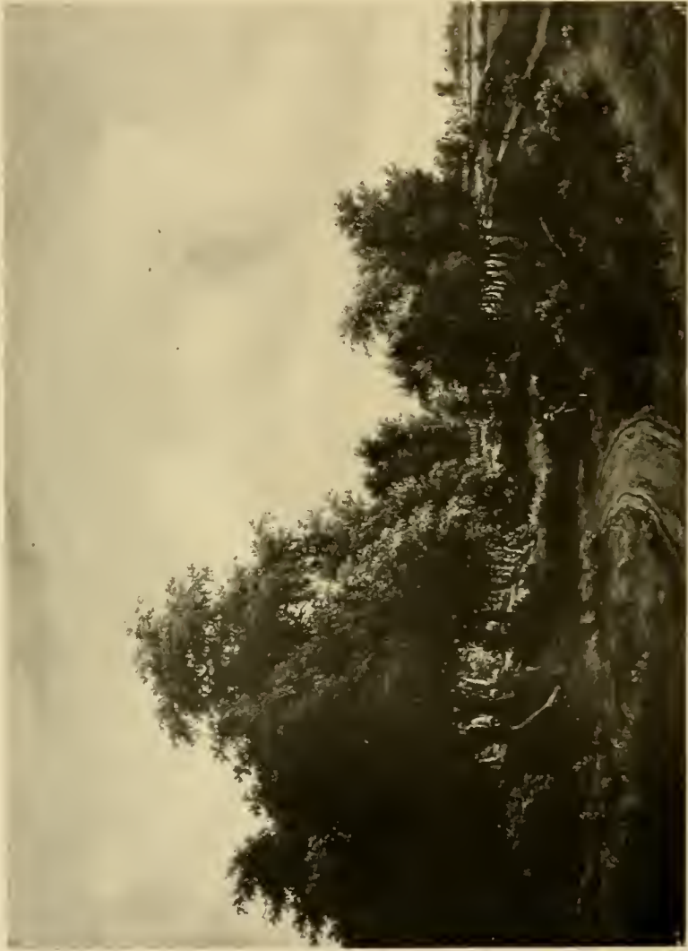
HOLFORD LANDSCAPE BY MEINDERT HOBBERMA