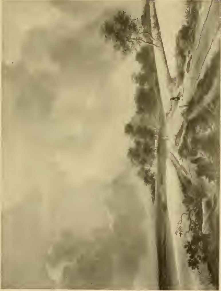
THE CORNFIELDS BY JACOB VAN RUISDAEL