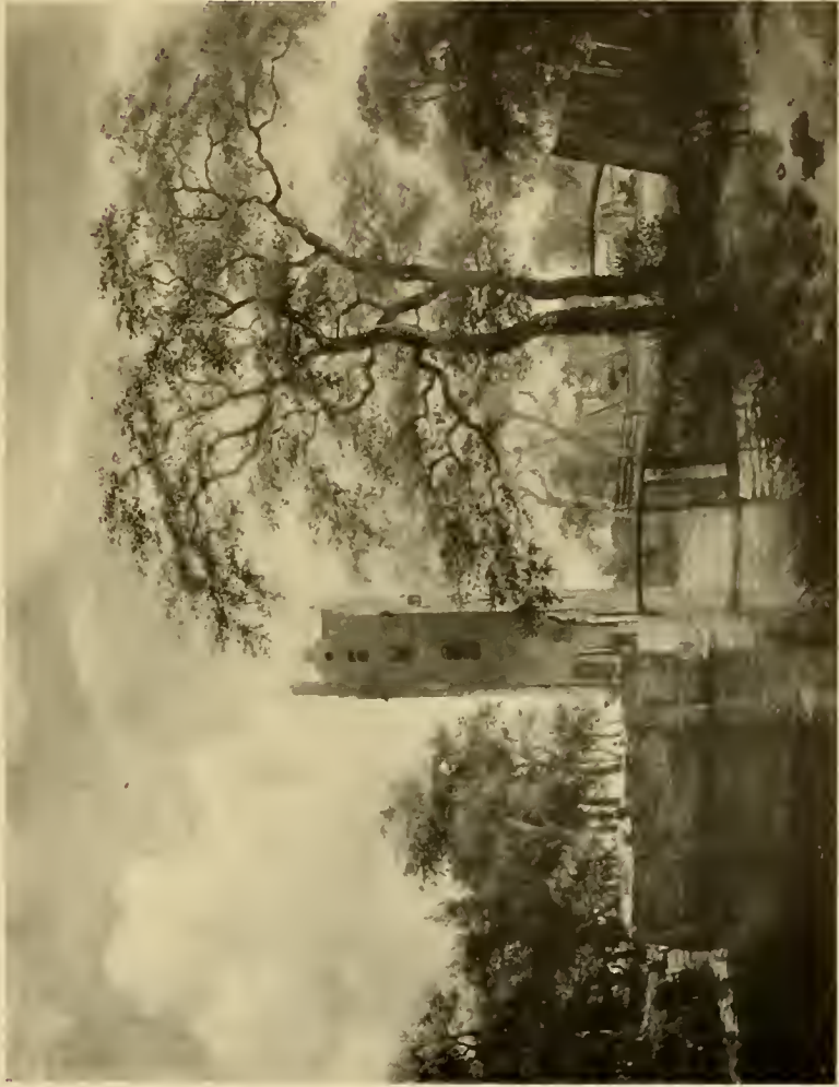
CASTLE KOSTVERLOREN BY MEINDERT HOBBERMA