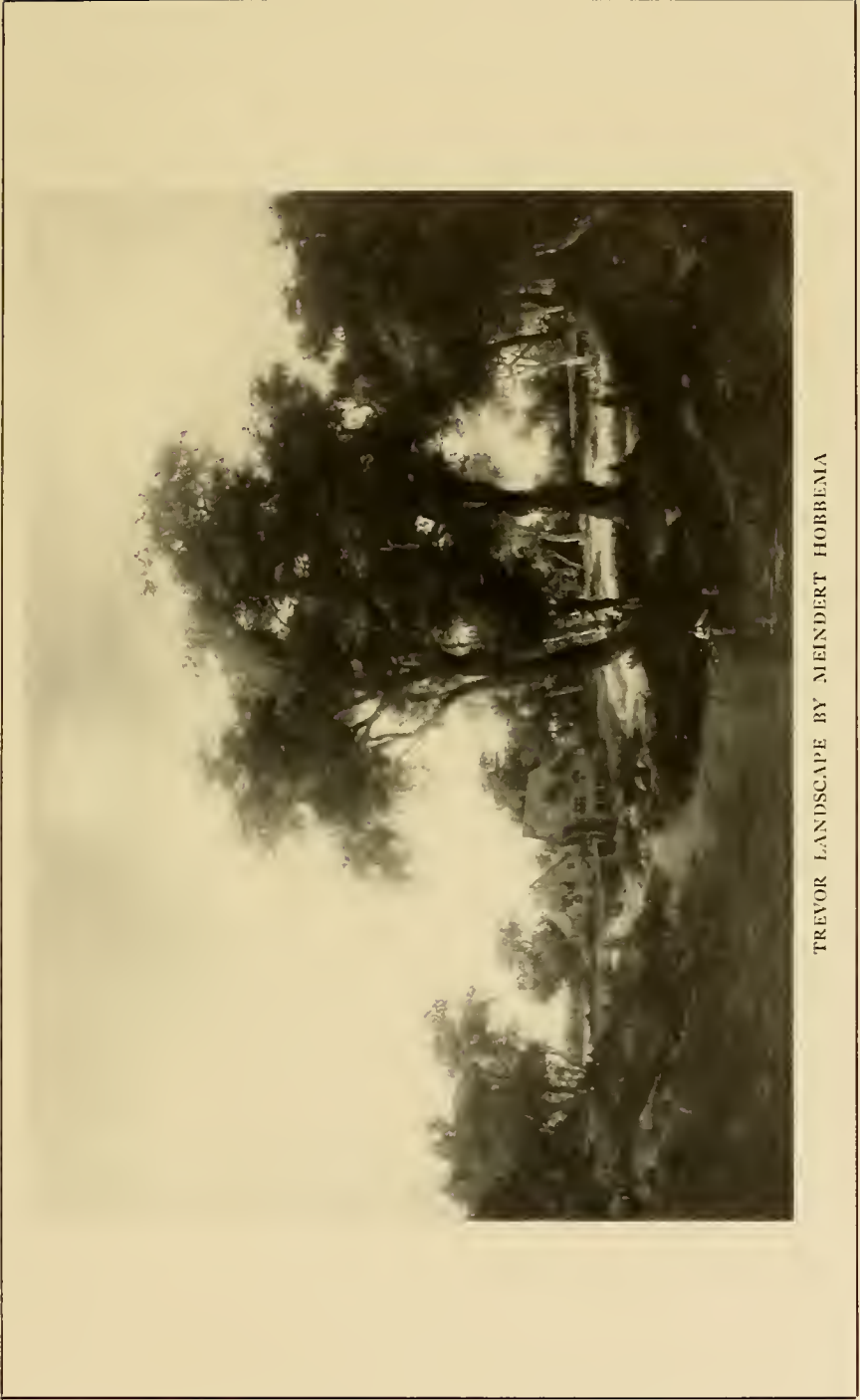
TREVOR LANDSCAPE BY MEINDERT HOBBERMA