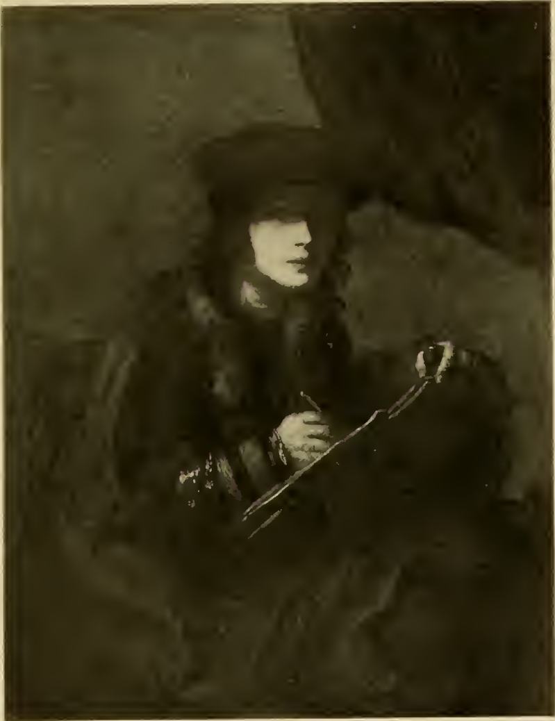
A YOUNG PAINTER BY REMBRANDT