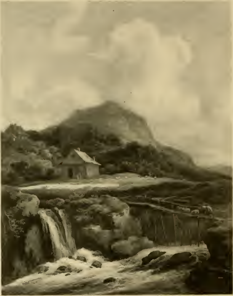
THE MOUNTAIN TORRENT BY JACOB VAN RUISDAEL