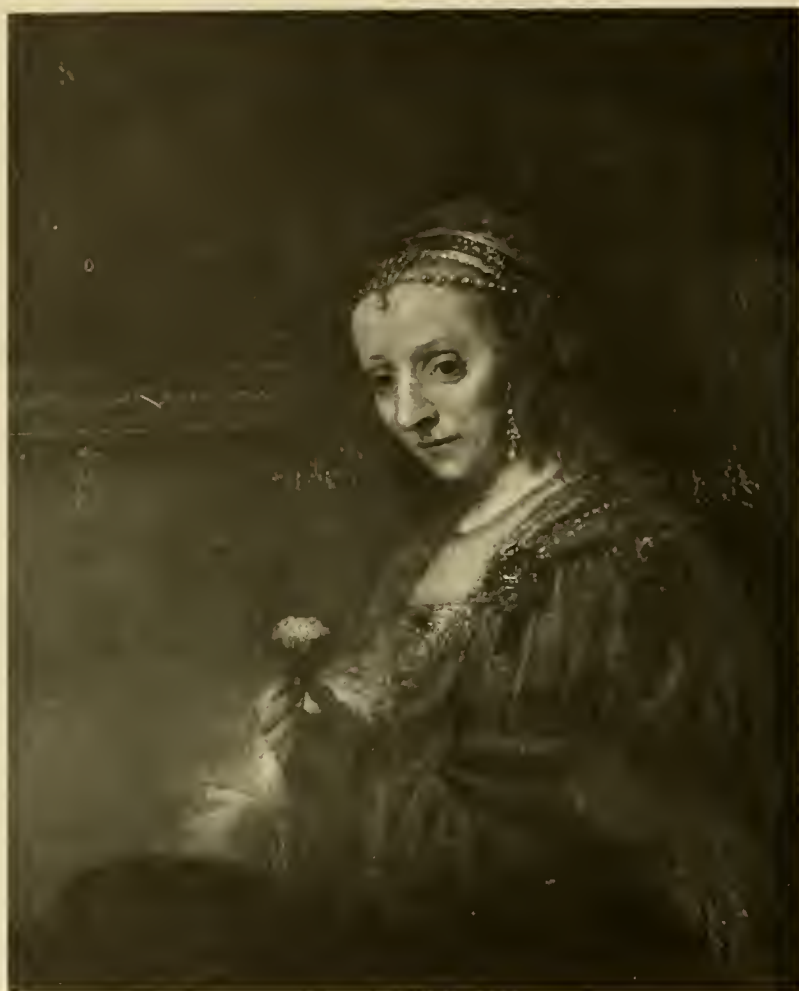
MAGDALENA VAN LOO, WIFE OF REMBRANDT'S SON TITUS ("THE LADY WITH A PINK") BY REMBRANDT