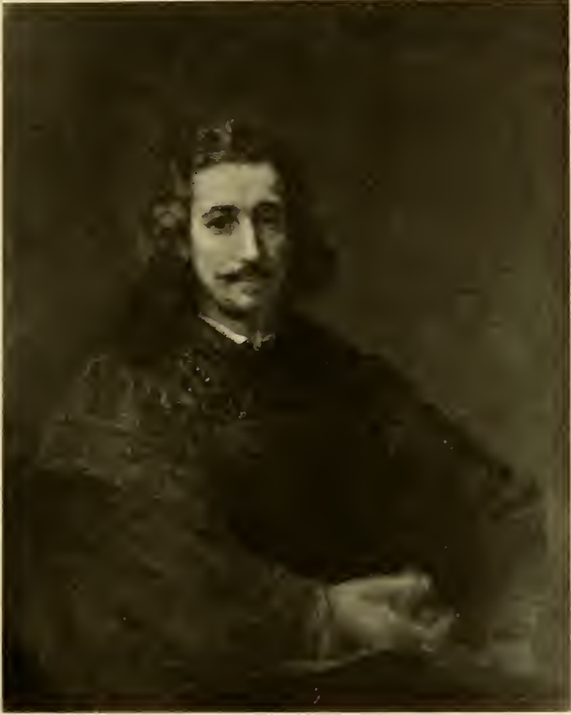
TITUS THE SON OF REMBRANDT ("THE MAN WITH THE MAGNIFYING GLASS") BY REMBRANDT