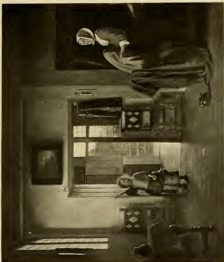
THE BEDROOM BY PIETER DE HOOCH