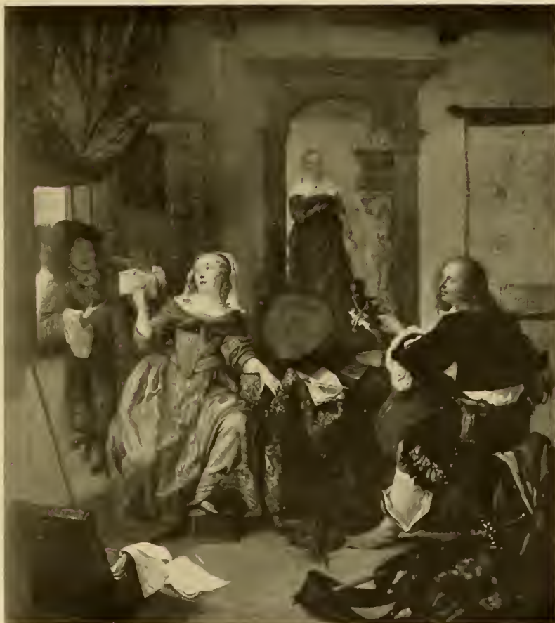
A MUSIC PARTY BY GABRIEL METSU