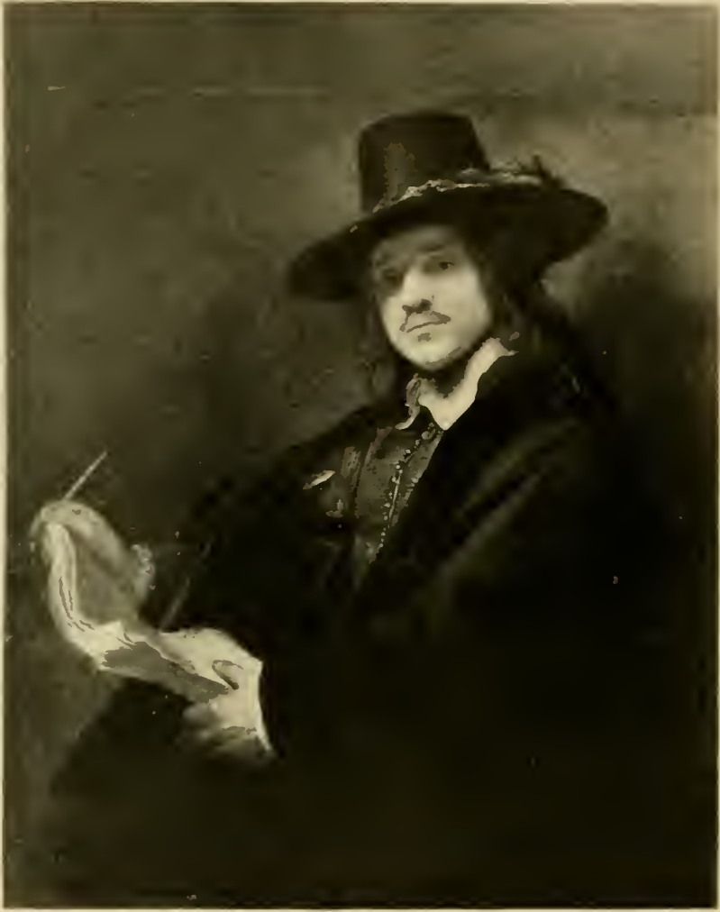
PORTRAIT OF A YOUNG MAN BY REMBRANDT