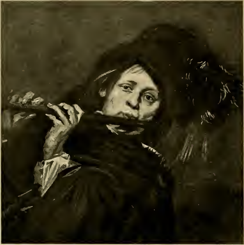
BOY PLAYING A FLUTE BY FRANS HALS