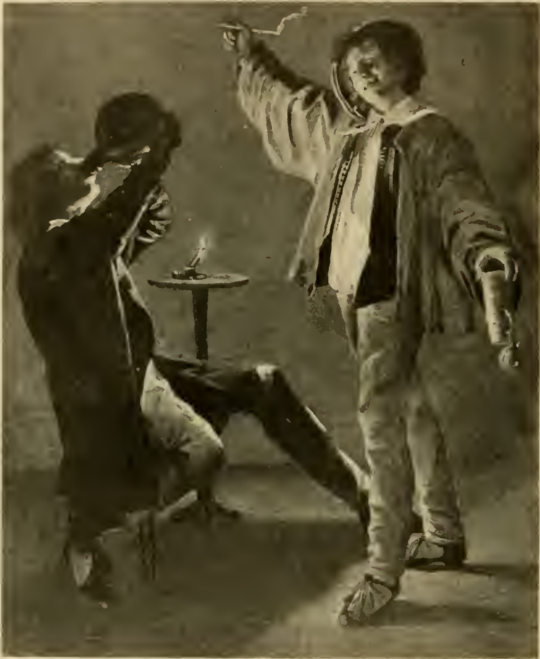
THE GAY CAVALIERS BY JUDITH LEYSTER