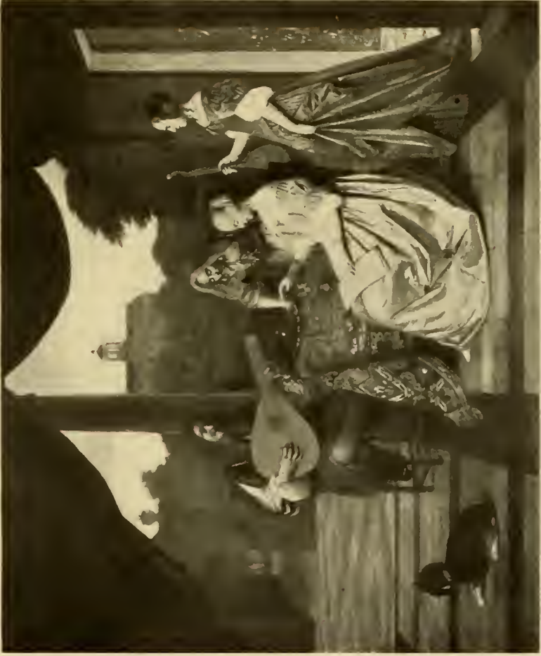
THE MUSIC PARTY BY PIETER DE HOOCH