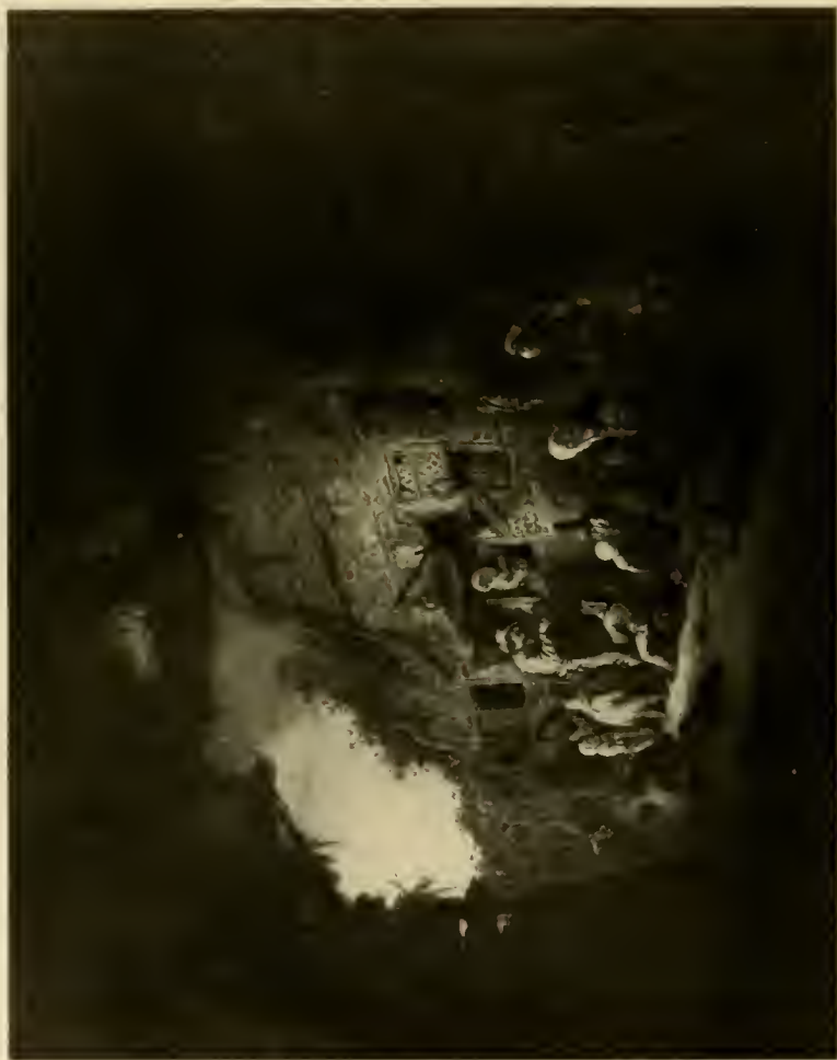
THE OLD FIDDLER BY ADRIAEN VAN OOSTADE