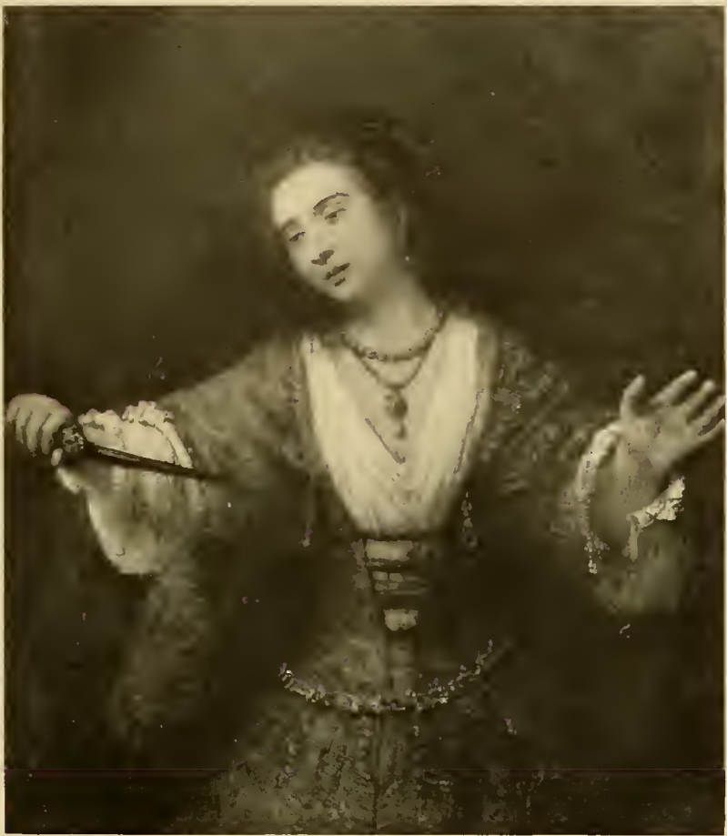
LUCRETIA BY REMBRANDT