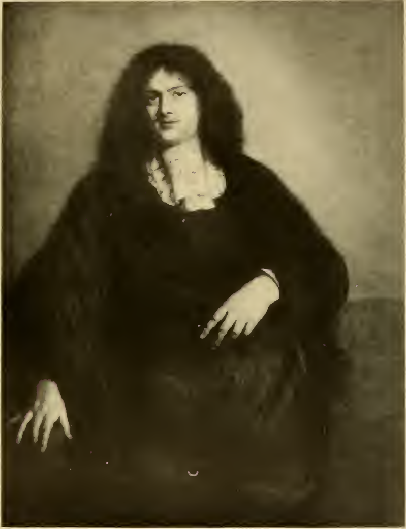
PORTRAIT OF A MAN BY NICOLAES MAES