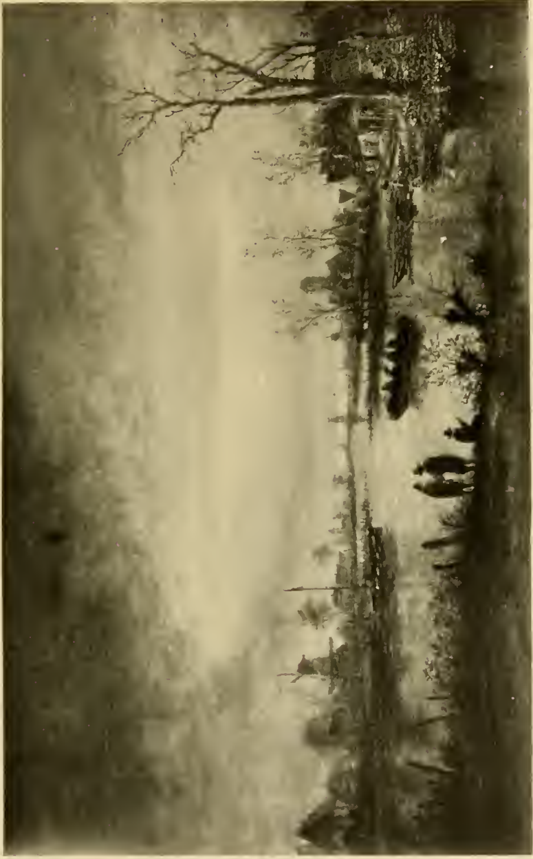
SUNSET BY AERT VAN DER NEER