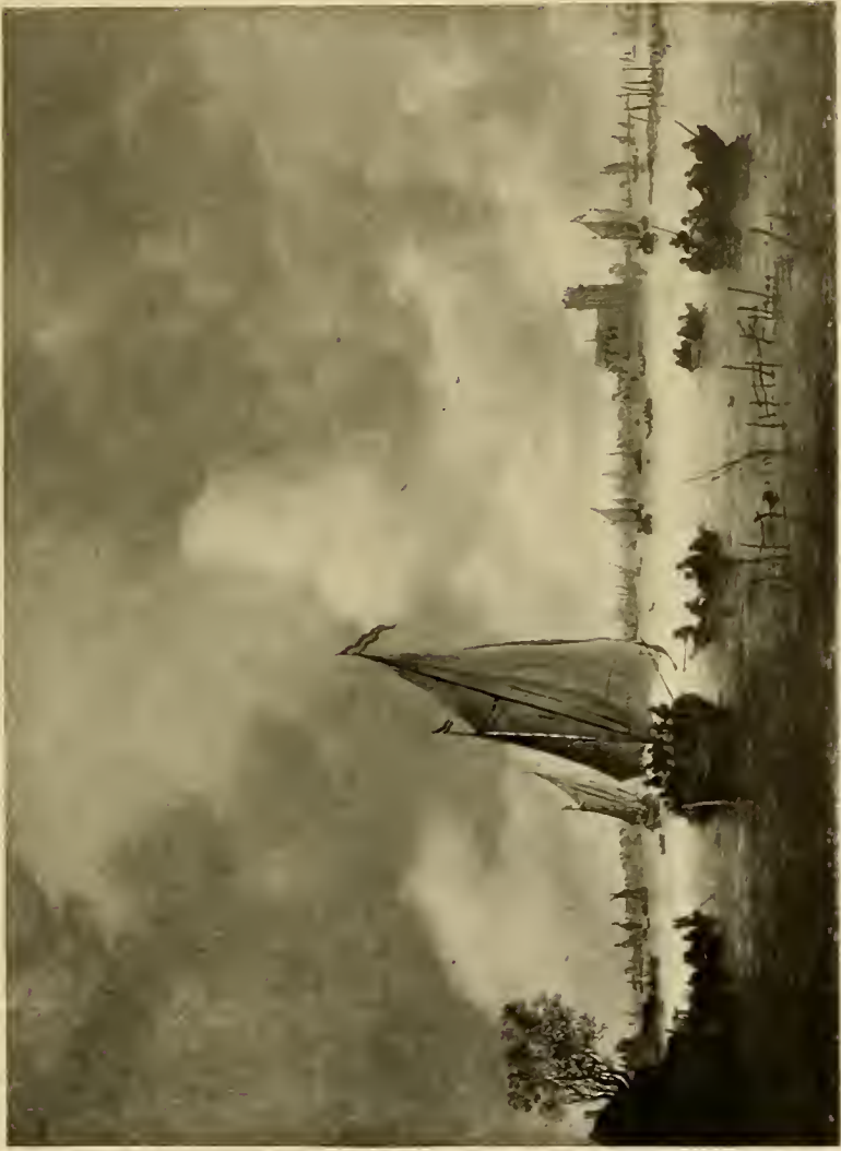
VIEW OF DORDRECHT BY JAN VAN GOYEN