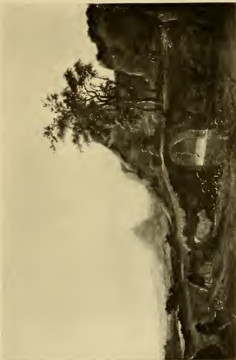
LANDSCAPE WITH BRIDGE BY AELBERT CUYP