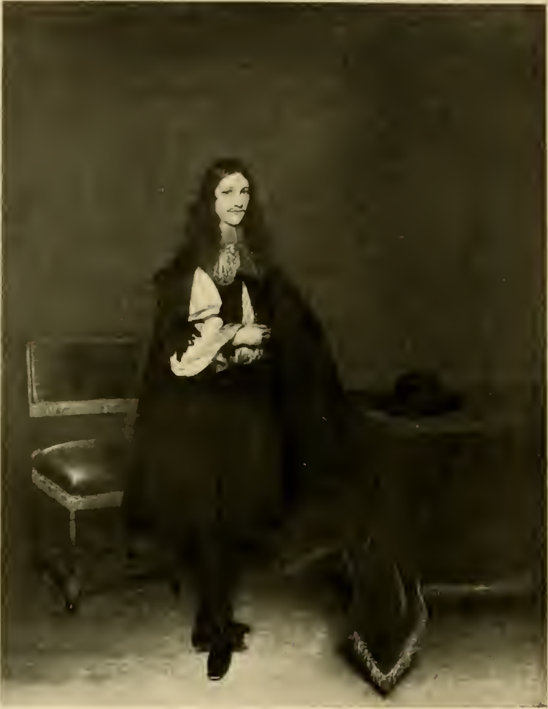
PORTRAIT OF A YOUNG MAN BY GERARD TERBORCH