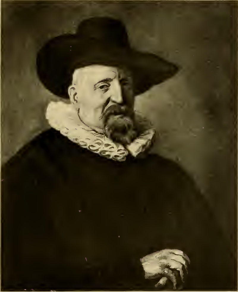
PORTRAIT OF A MAN BY FRANS HALS