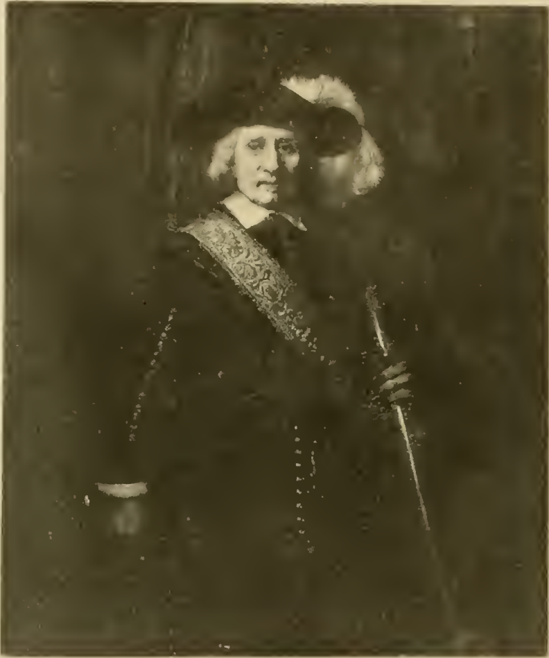
THE STANDARD-BEARER BY REMBRANDT