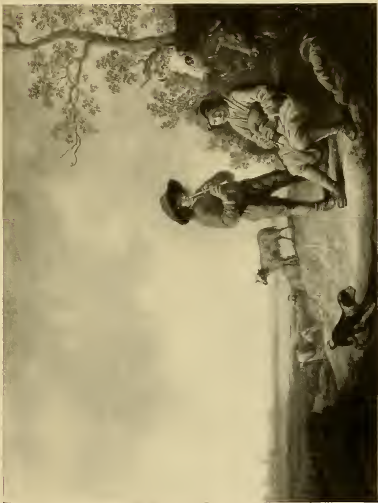
PIPING SHEPHERDS BY AELBERT CUYT