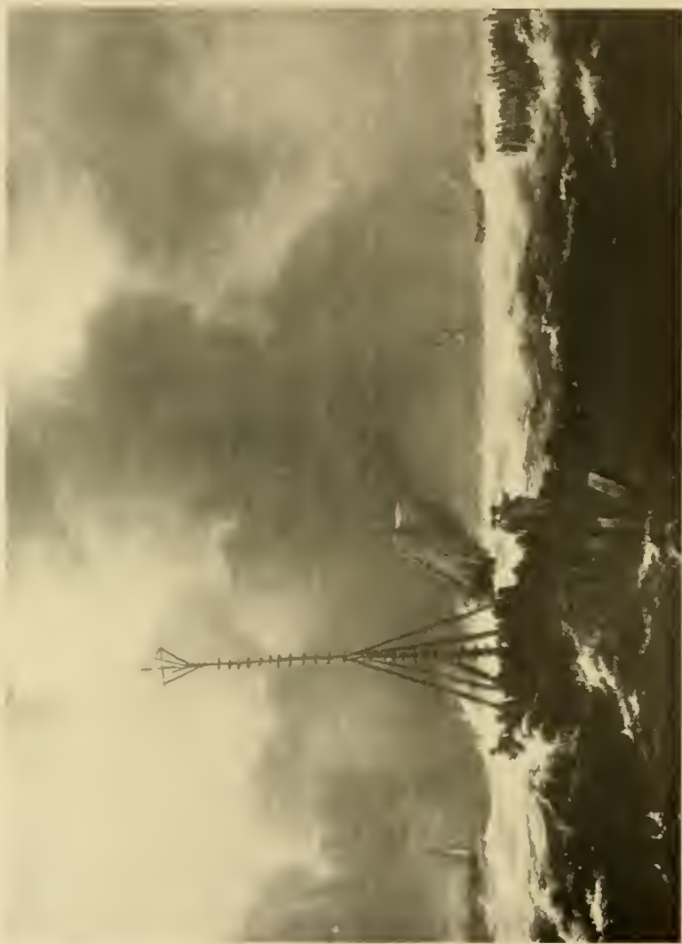
STORMY SEA BY JACOB VAN RUISDAEL