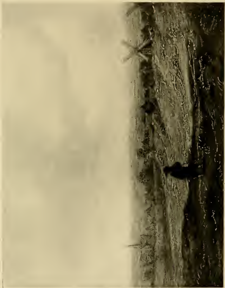
VILLAGE IN THE DUNES BY AELBERT CUYP