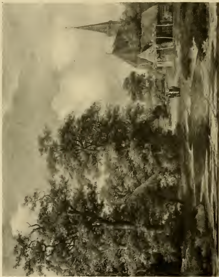
THE POOL BY MEINDERT HOBBEEMA