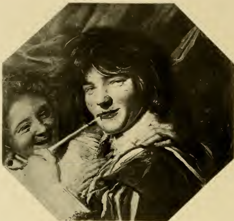
THE SMOKER BY FRANS HALS