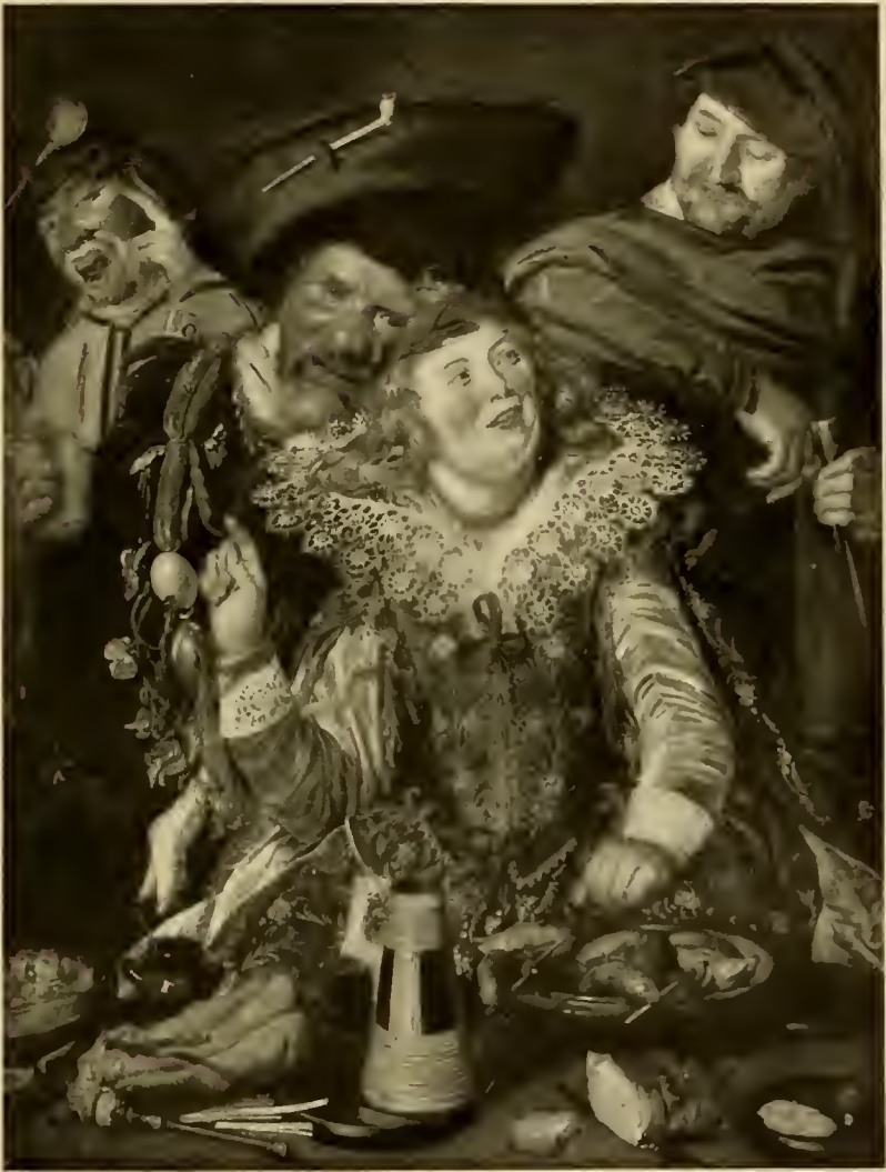
MERRY COMPANY BY FRANS HALS