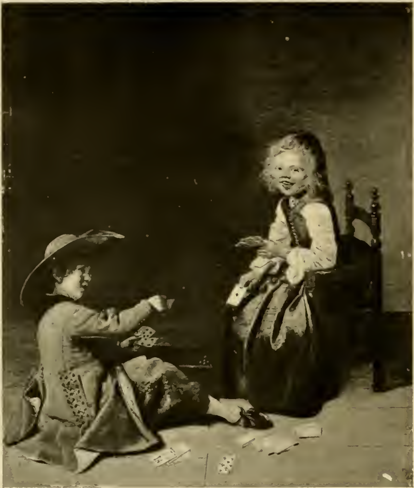
CHILDREN PLAYING CARDS BY DIRK HALS