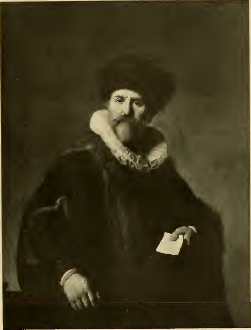
NICOLAES RUTS BY REMBRANDT