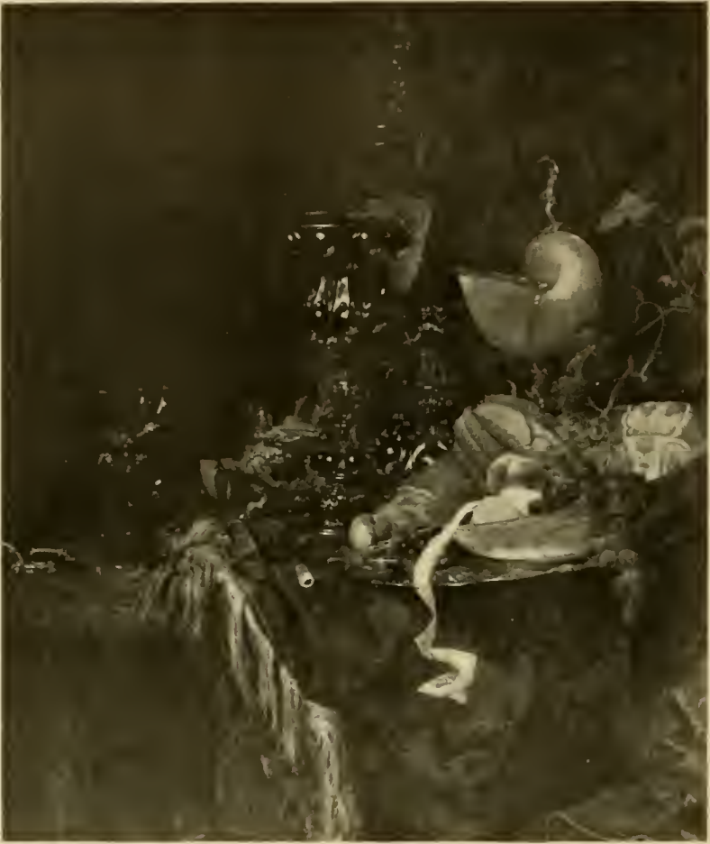
STILL LIFE BY WILLEM KALF