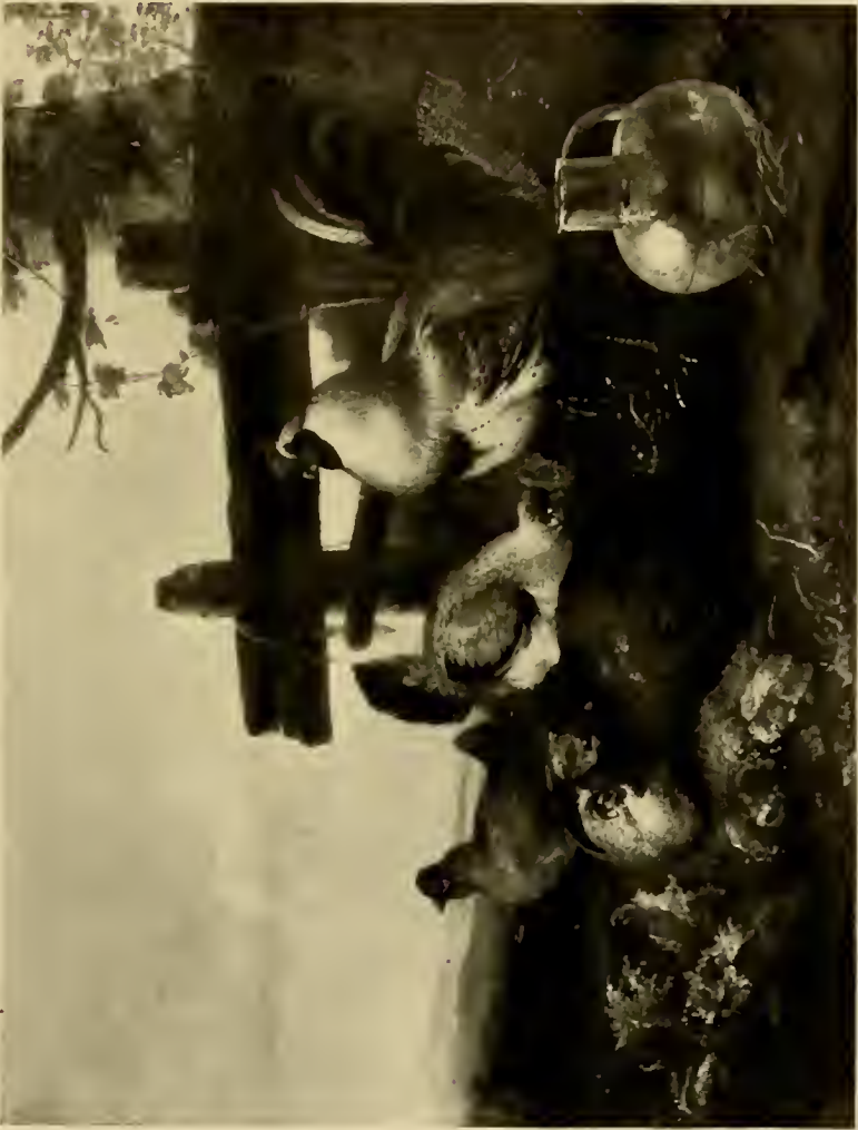
COCK AND HENS BY ALBERT CUYP