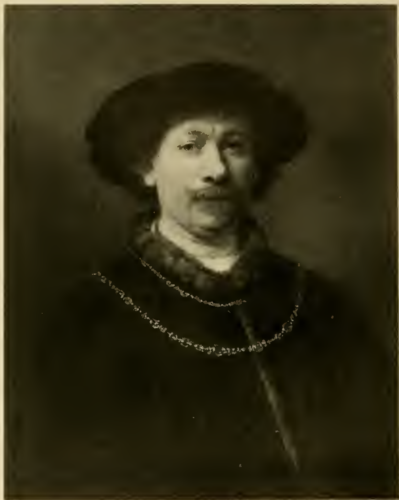
PORTRAIT OF HIMSELF BY REMBRANDT