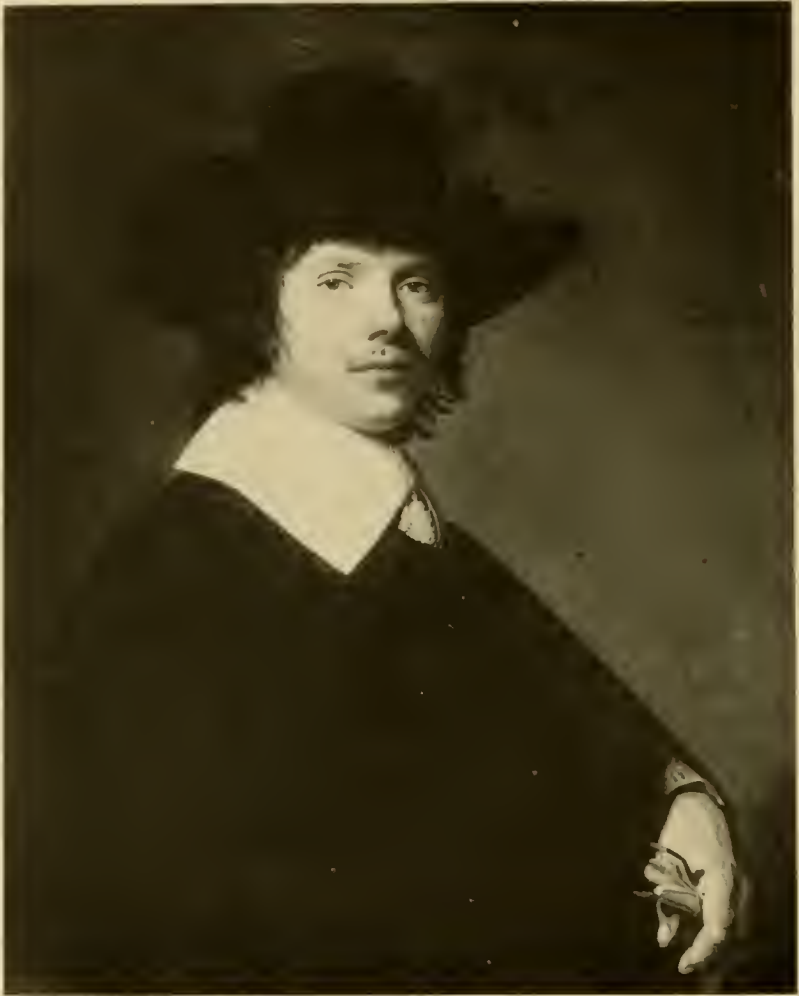
PORTRAIT OF A MAN BY JAN VERSPRONCK