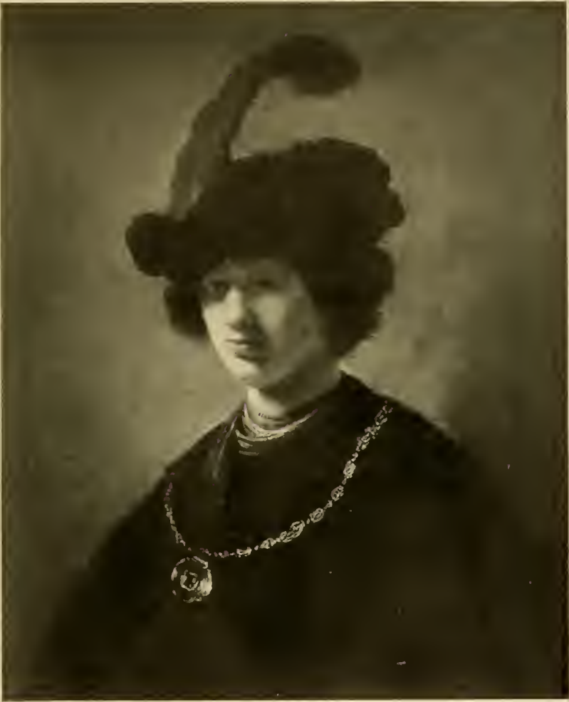
PORTRAIT OF HIMSELF BY REMBRANDT