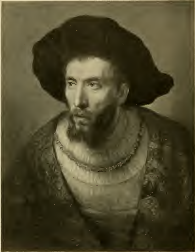
A PHILOSOPHER BY REMBRANDT