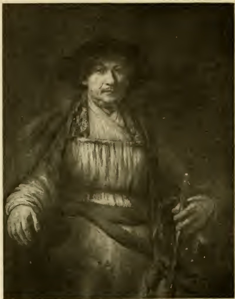
PORTRAIT OF HIMSELF BY REMBRANDT