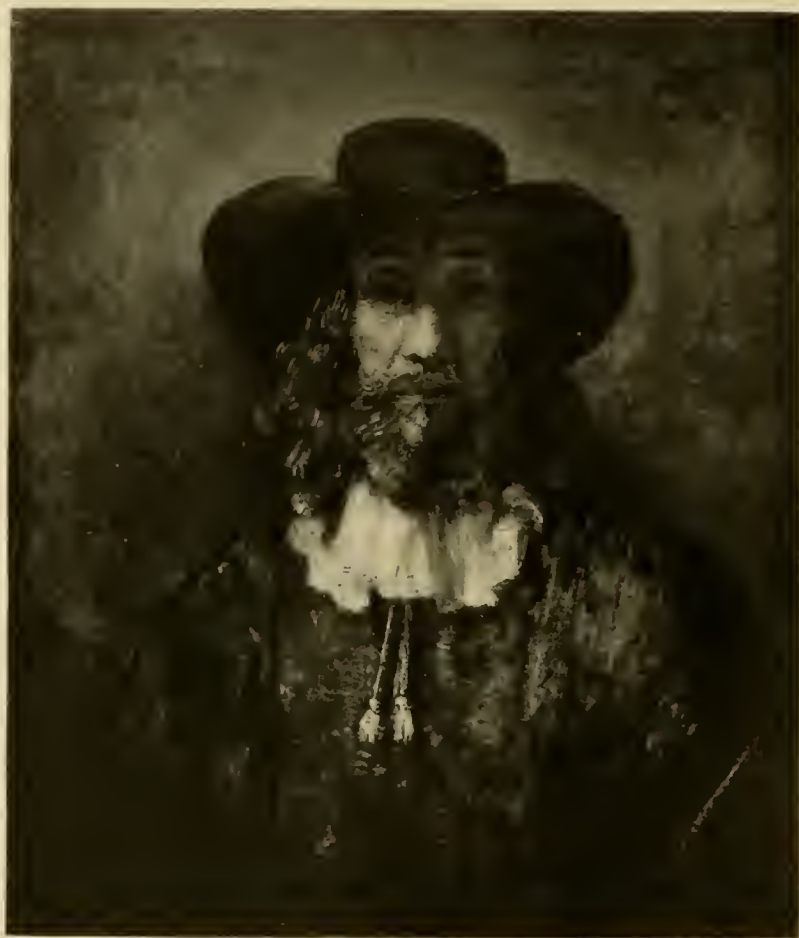
PORTRAIT OF A MAN BY REMBRANDT