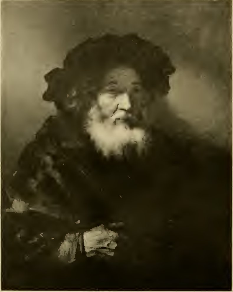
PORTRAIT OF AN OLD MAN BY REMBRANDT