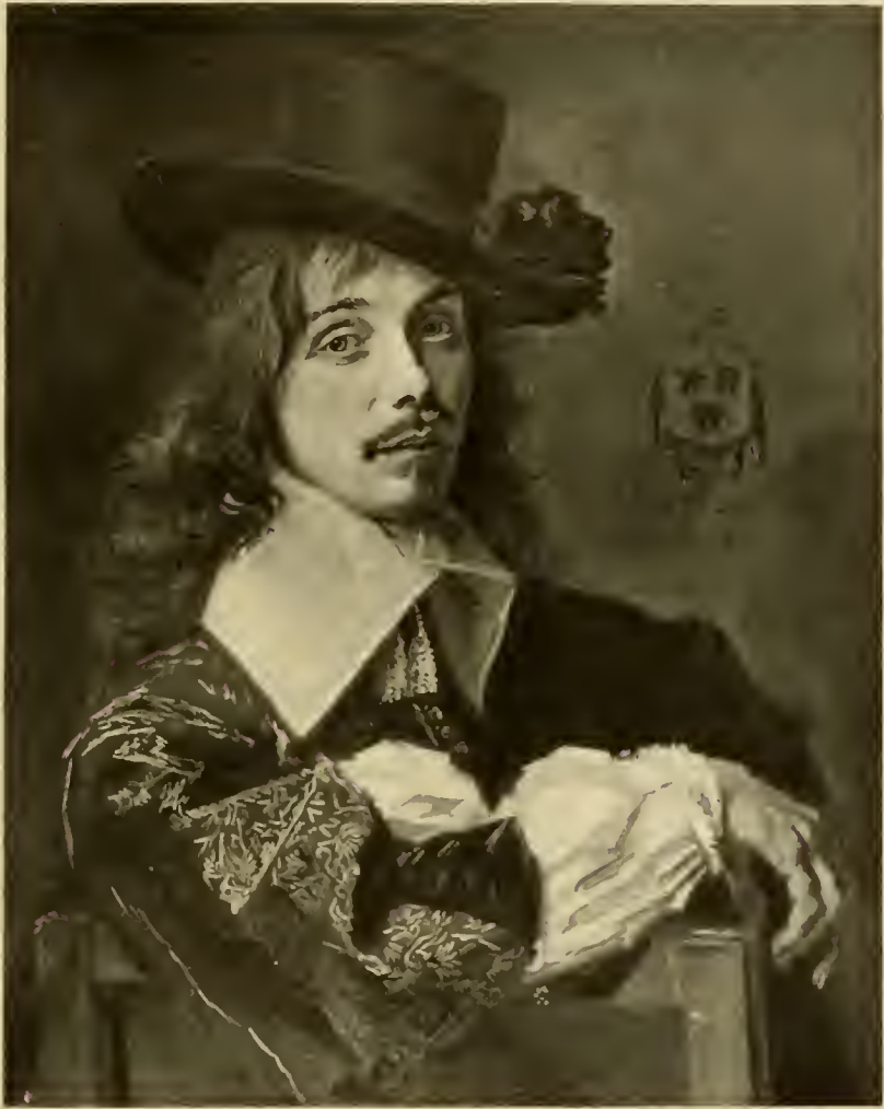
BALTHASAR COYMANS BY FRANS HALS