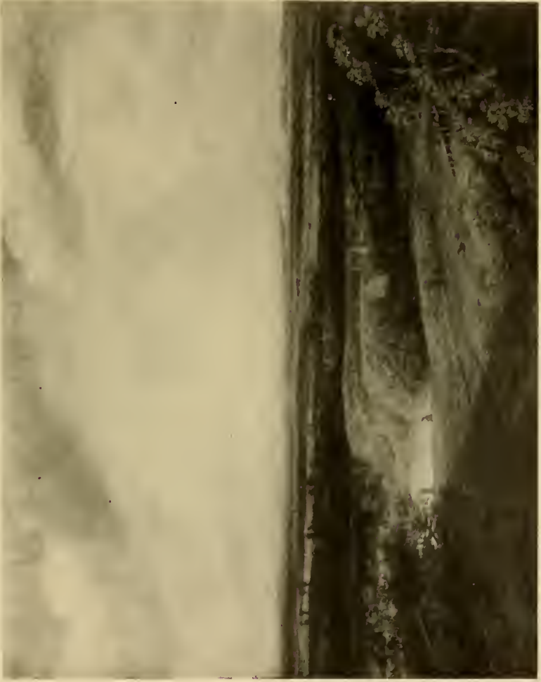
THE DUNES BY PHILIP KONINCK