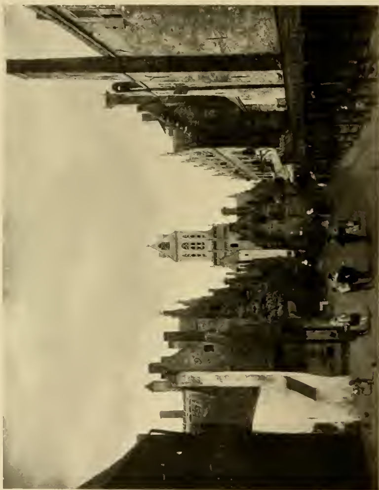
STREET IN DEFT BY JAN VAN DER HEYDEN