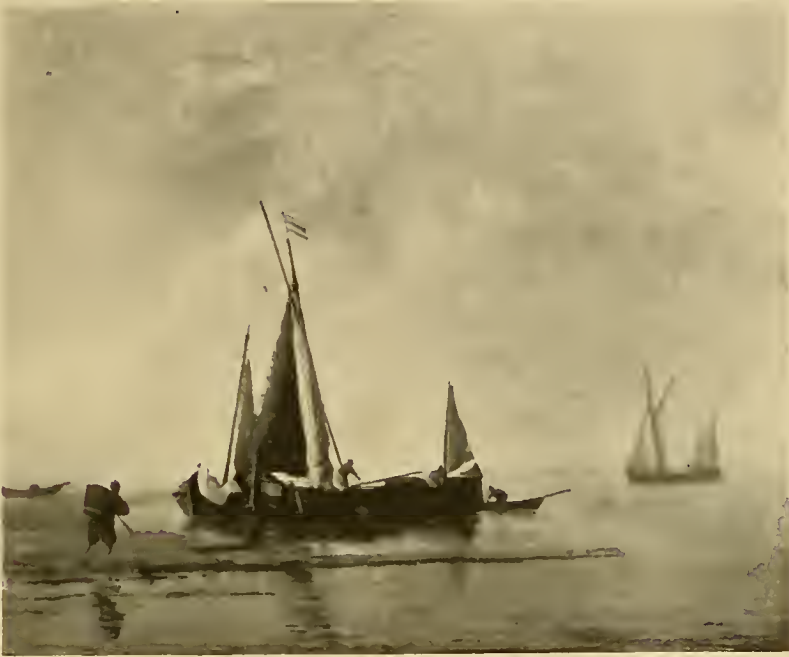
CALM SEA BY WILLEM VAN DE VELDE