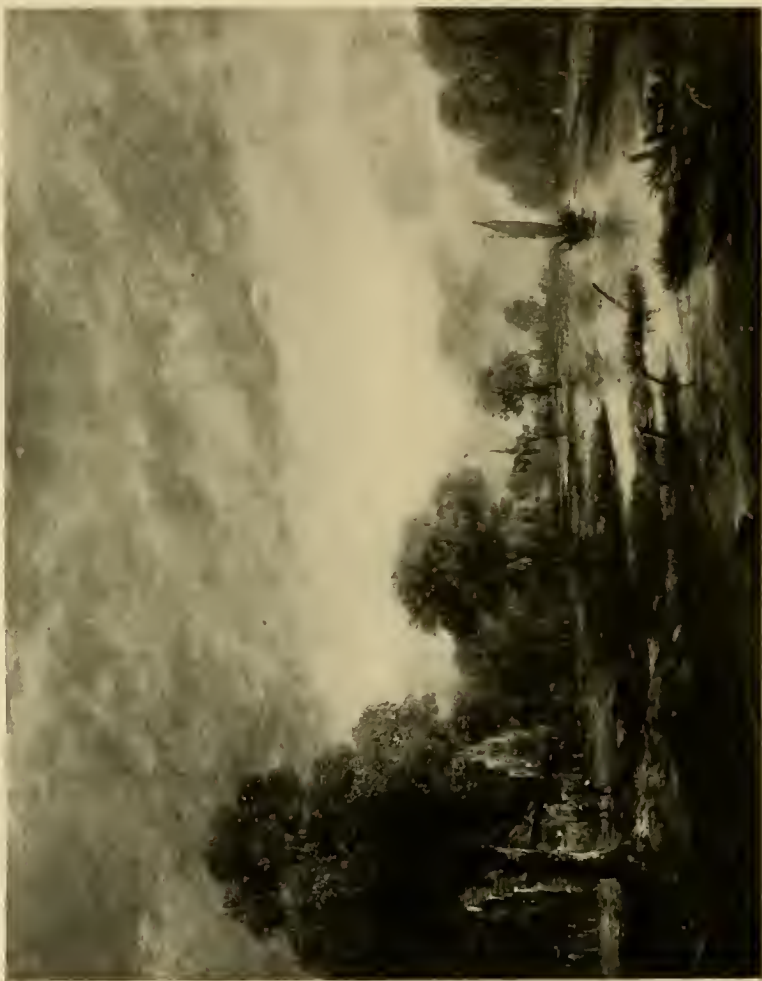
MOONLIGHT BY AERT VAN DER NEER