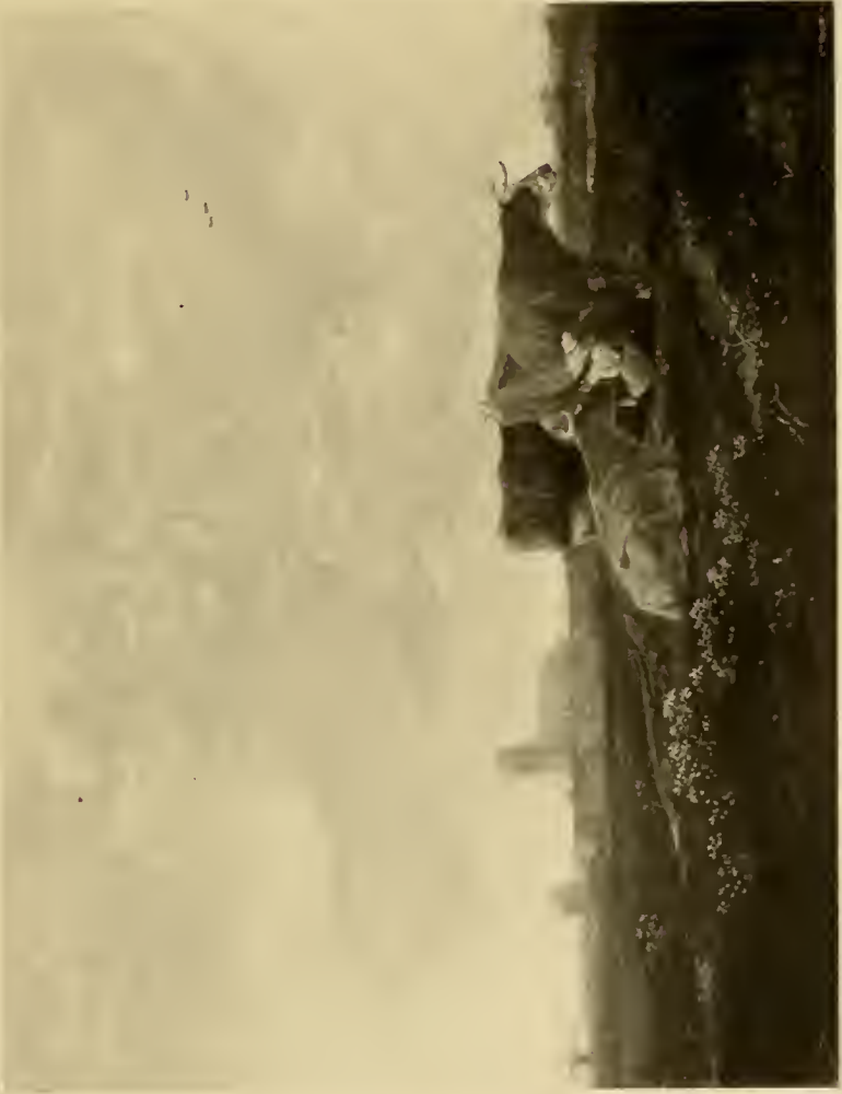
MILKING-TIME BY AELBERT CUYP