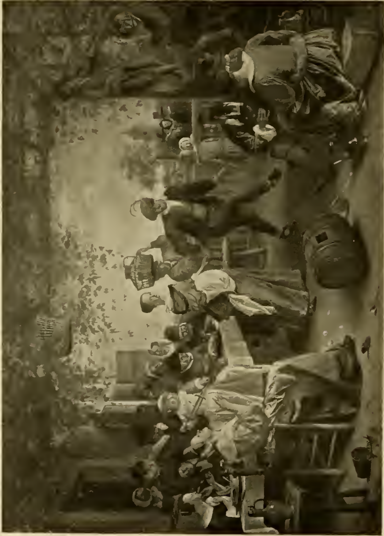
THE DANCING COUPLE BY JAN STEEN