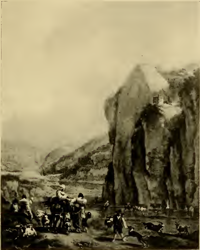
THE FORD BY NICOLAES BERCHEM