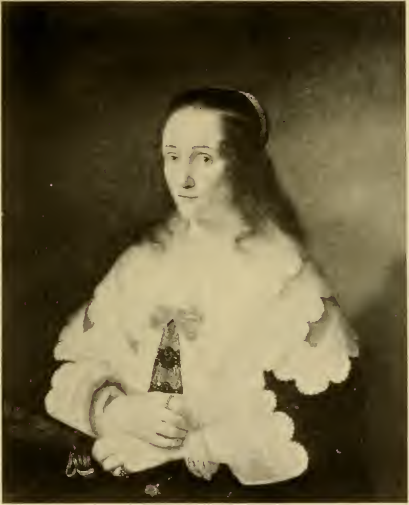
PORTRAIT OF A LADY BY FERDINAND BOL