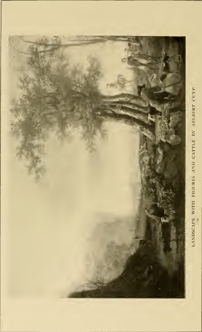
LANDSCAPE WITH FIGURES AND CATTLE BY ALBERT CUYT