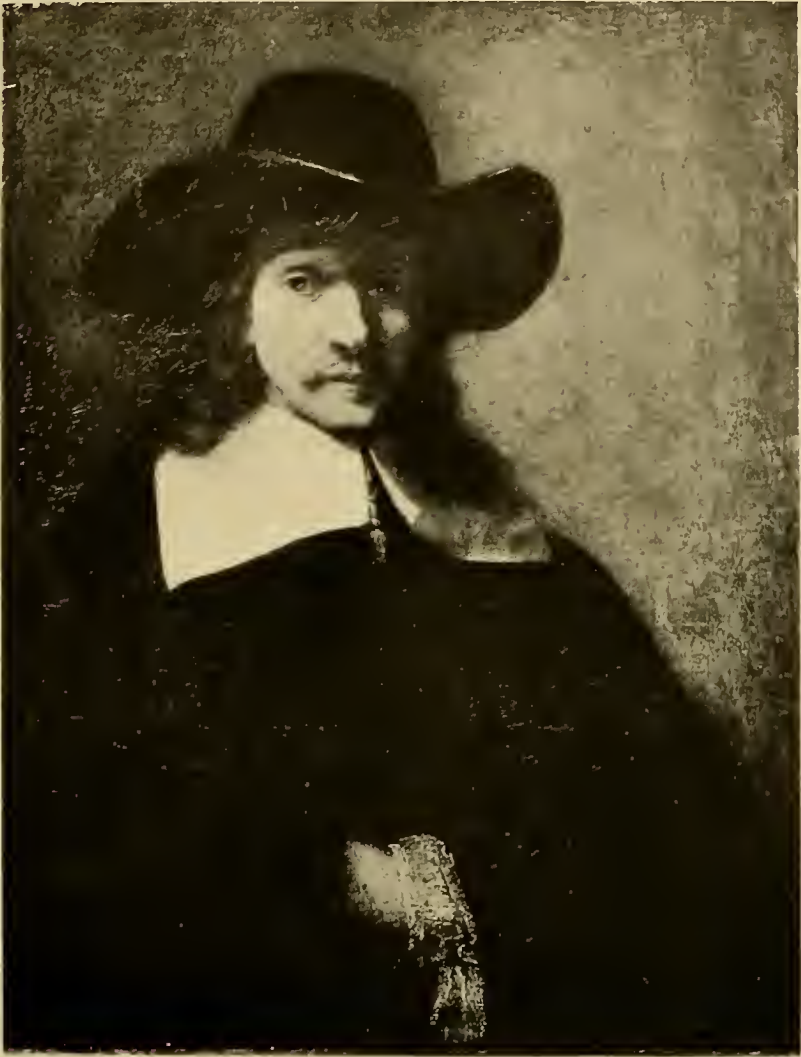
PORTRAIT OF A MAN BY REMBRANDT