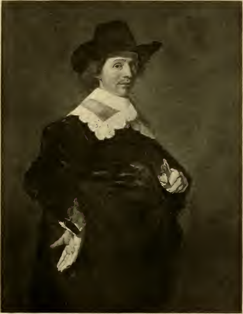
PORTRAIT OF A MAN BY FRANS HALS