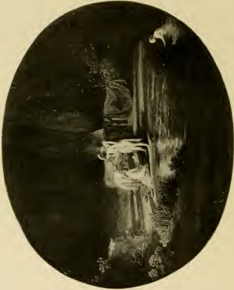
THE FINDING OF MOSES BY REMBRANDT