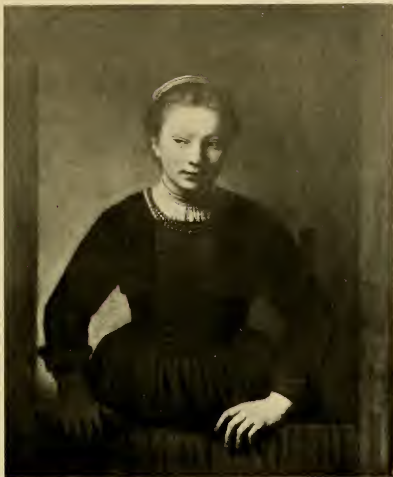
PORTRAIT OF A GIRL (HENDRICKJE STOFFELS?) BY REMBRANDT