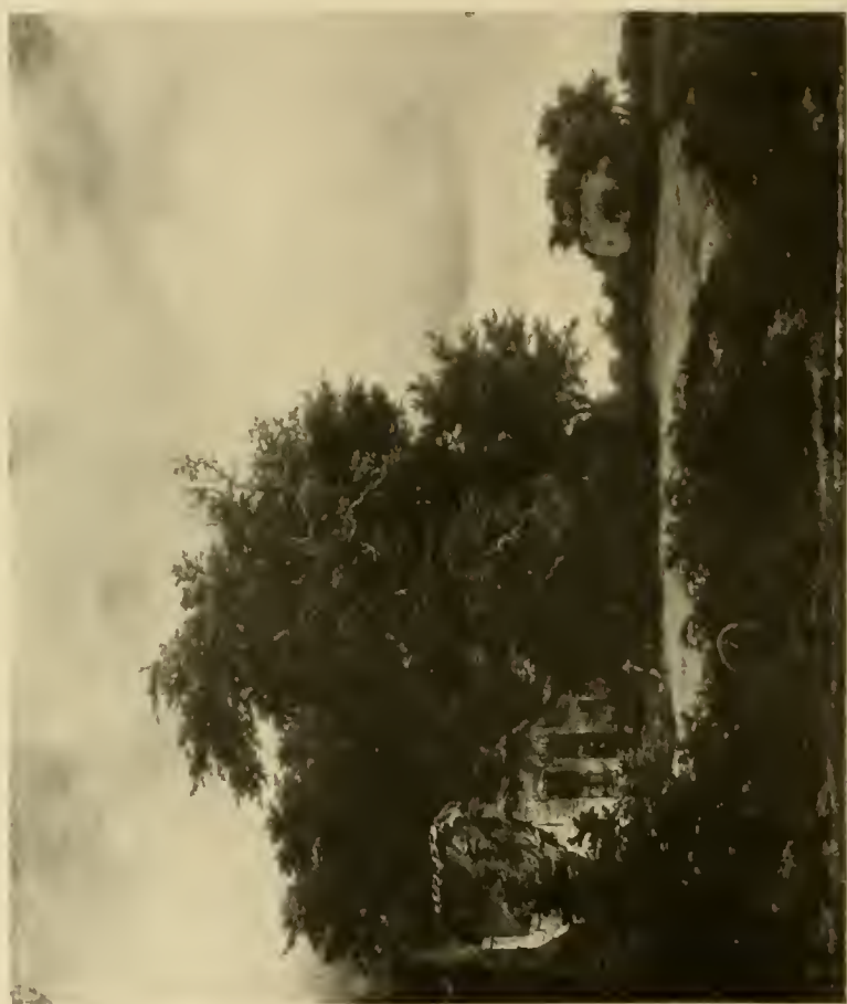
COTTAGE UNDER TREES BY JACOB VAN RUISDAEL