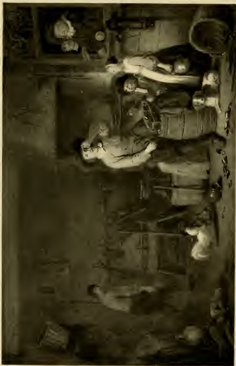
MAN EATING MUSSELS BY AELBERT CUYT