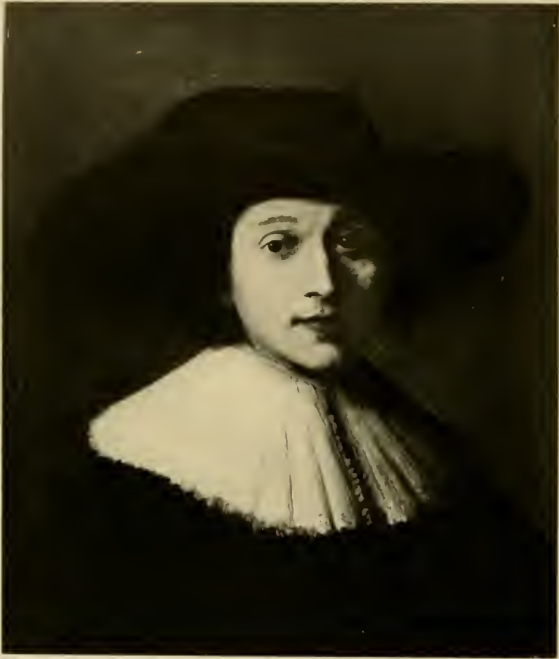
PORTRAIT OF A YOUNG MAN BY REMBRANDT