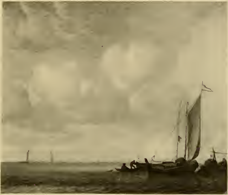
CALM SEA BY SIMON DE VLIAGER