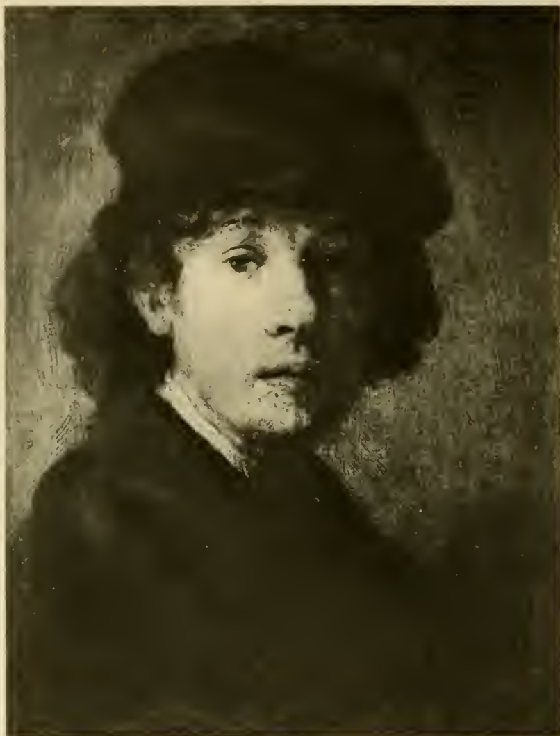
PORTRAIT OF HIMSELF BY REMBRANDT