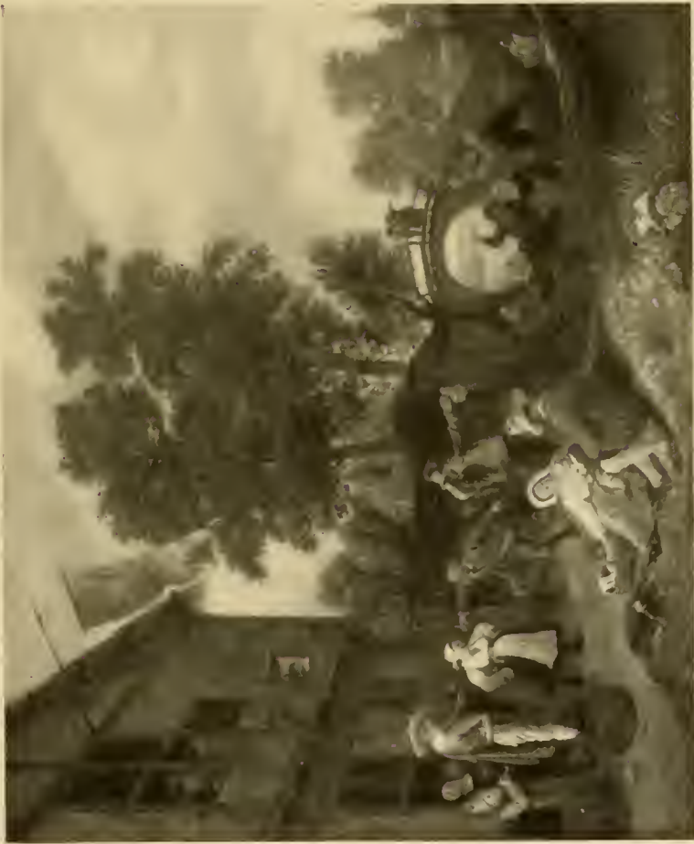
KERMESSE BY JAN STEEN