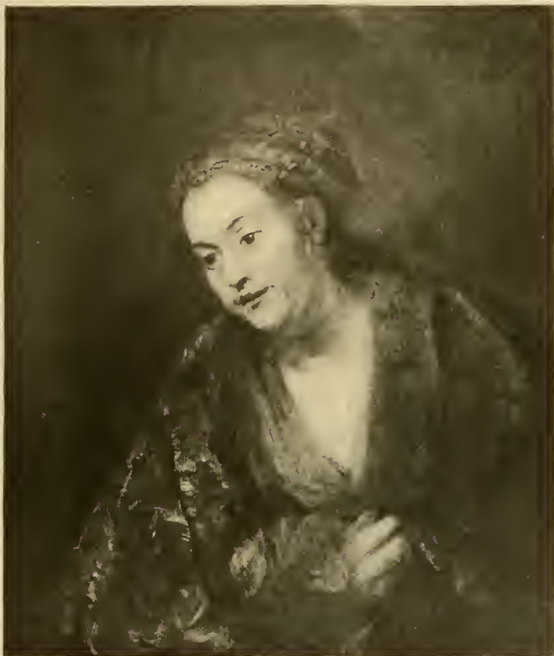
HENDRICKJE STOFFELS BY REMBRANDT