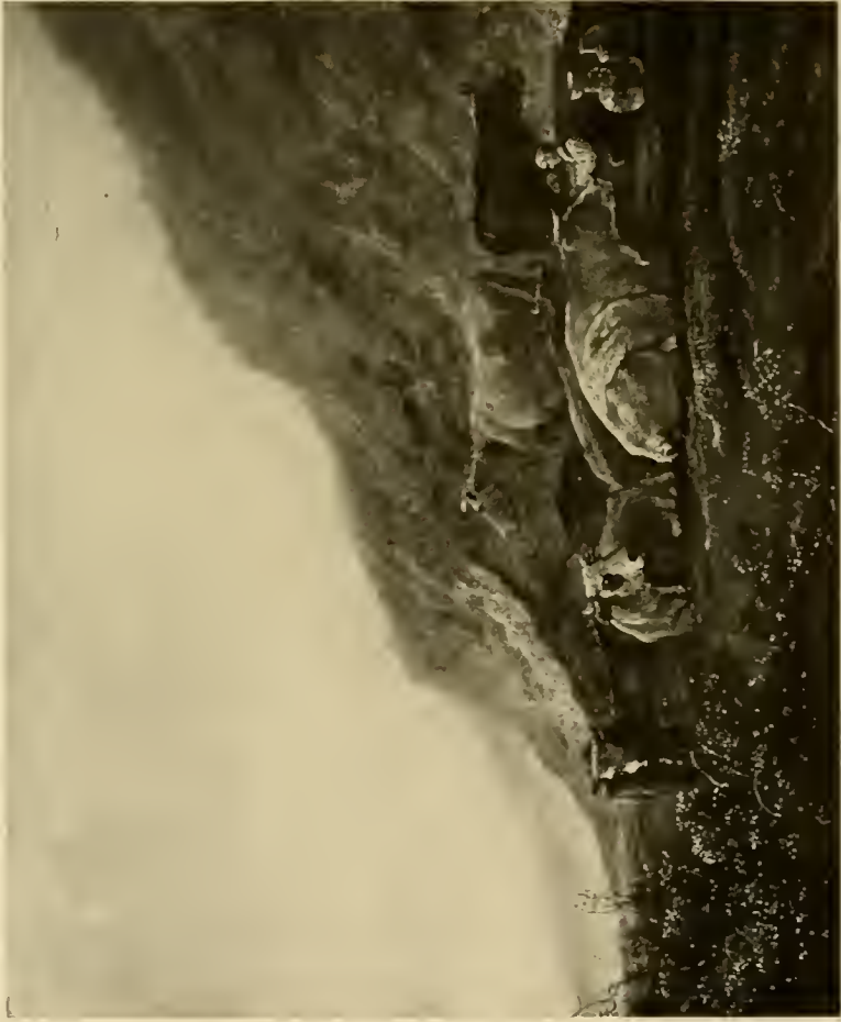
MILKING-TIME BY AELBERT CUYP