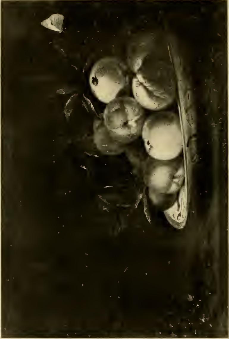
PEACHES BY ALBERT CUYP