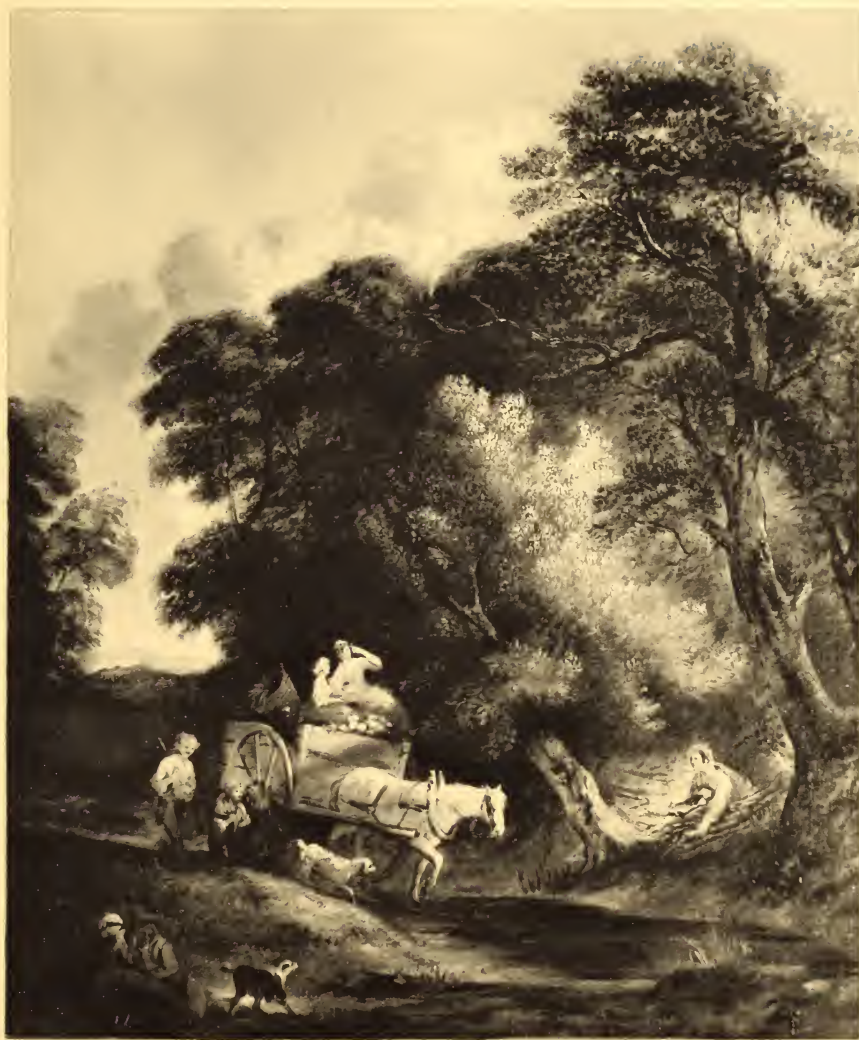
THE MARKET CART.