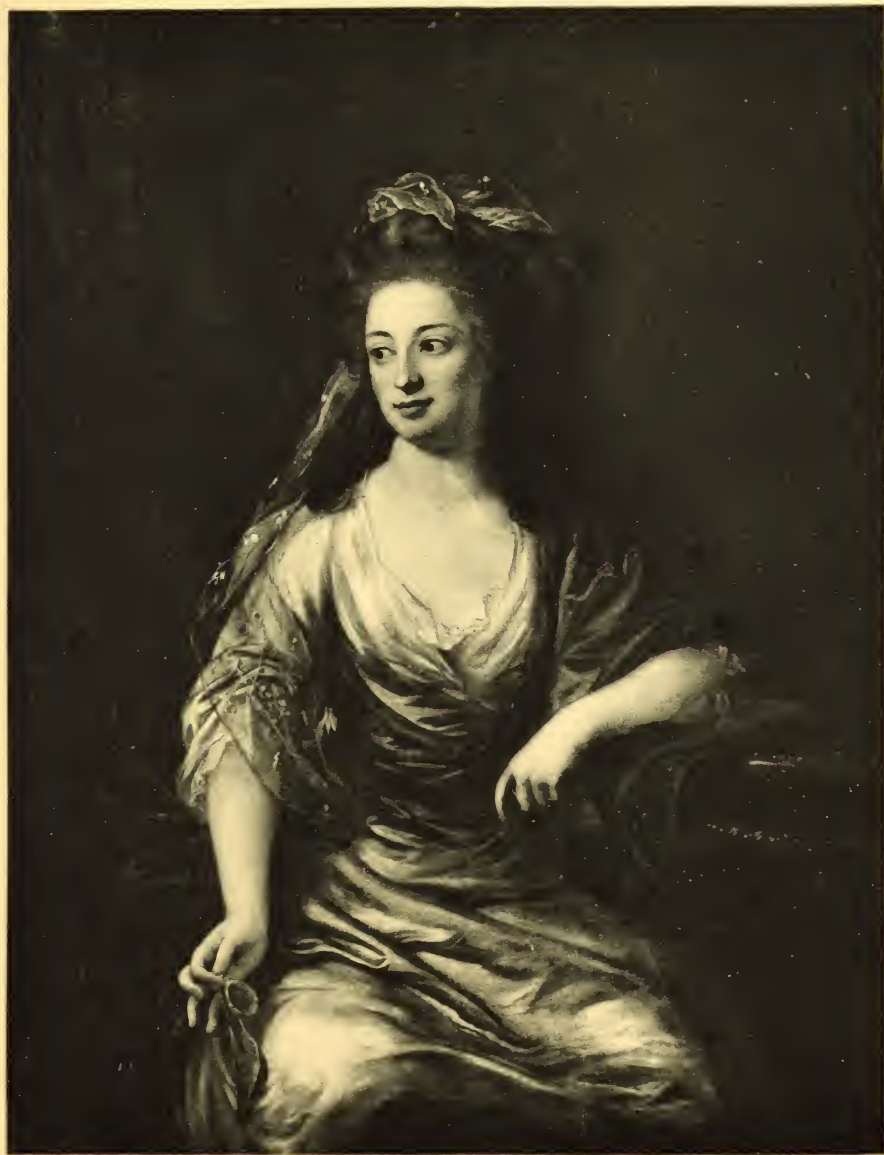
LA PRINCESSE DE TALLEYRAND.