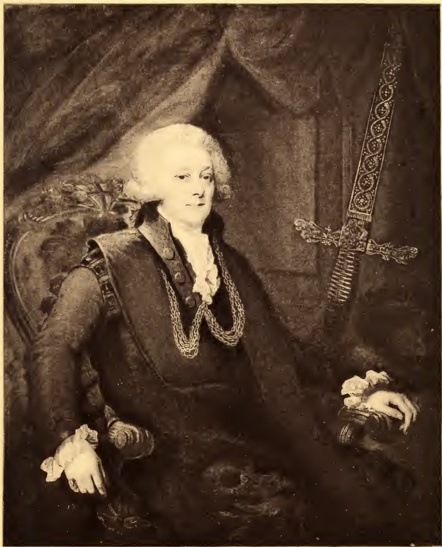
BROOKS WATSON, LORD MAYOR OF LONDON.