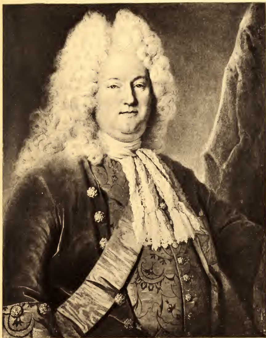
PRINCE CHRISTIAN OF BAVARIA.