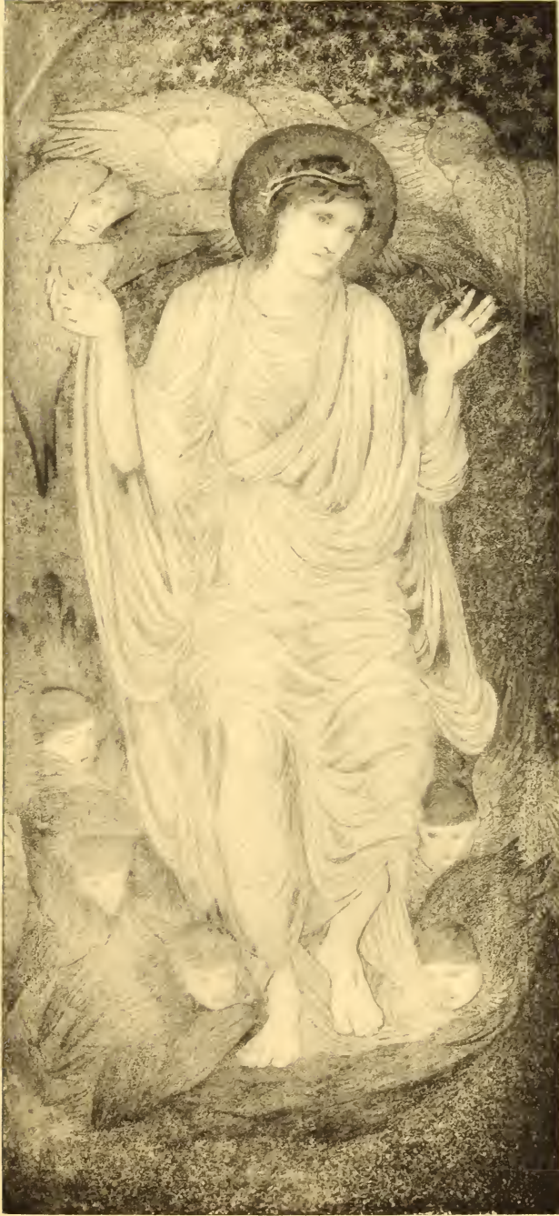
CHRIST SITTING IN JUDGMENT.