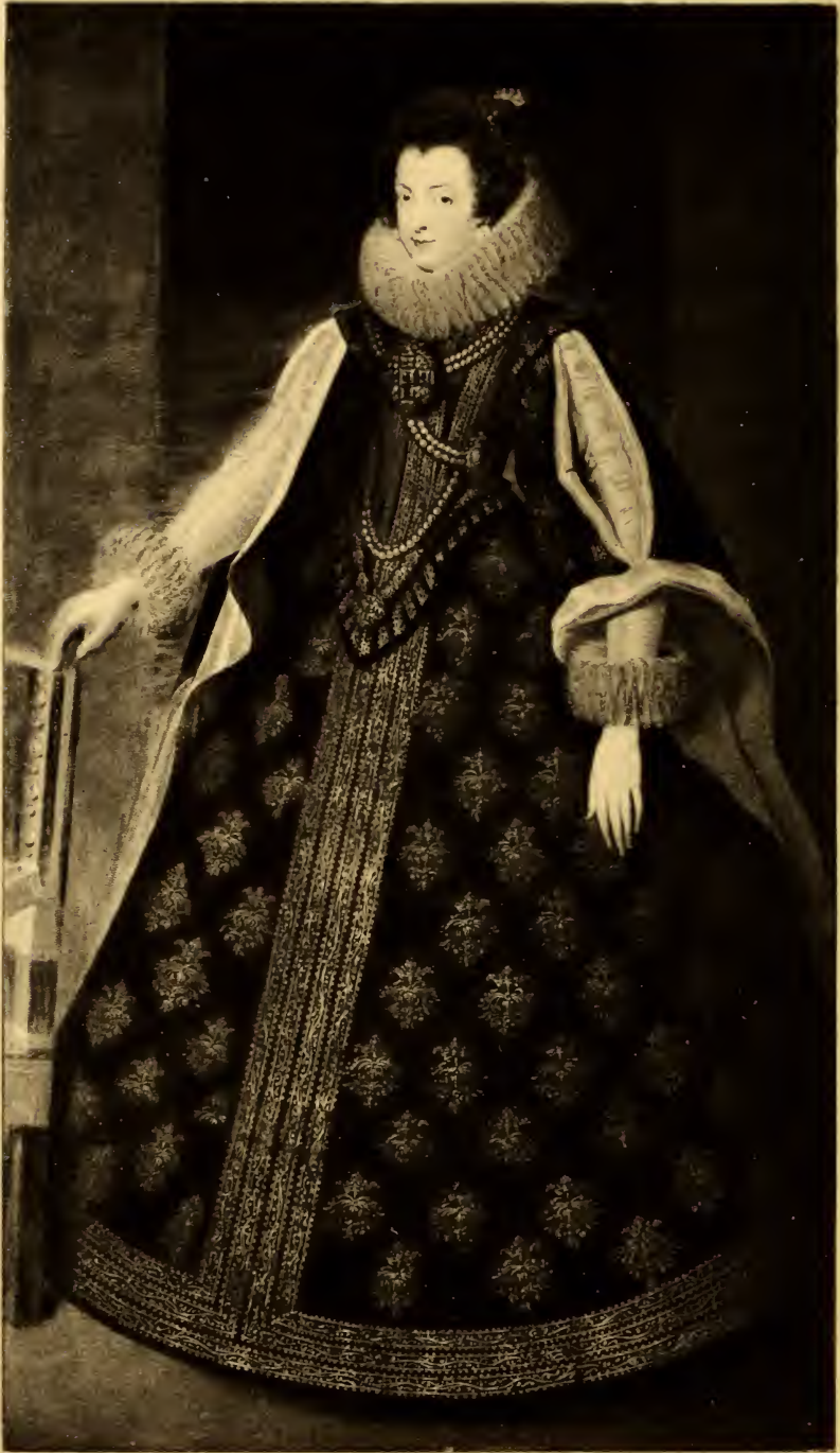
MARIE LOUISE OF ORLEANS.