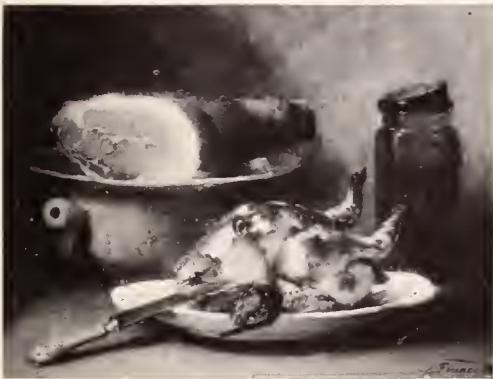
Signed at the lower right, "G. FOUACE."

A ROAST fowl, browned over in parts, is laid on a plate with its feet doubled back over the breast. The head has not been removed, and a sharp-pointed, silver-handled knife lies across the neck. The dish is decorated with a small running pattern of red volutes and blue and green leaves. At the back, toward the left, appears the shank half of a boiled ham, while to the right stands a green glass jar with the cork half drawn.