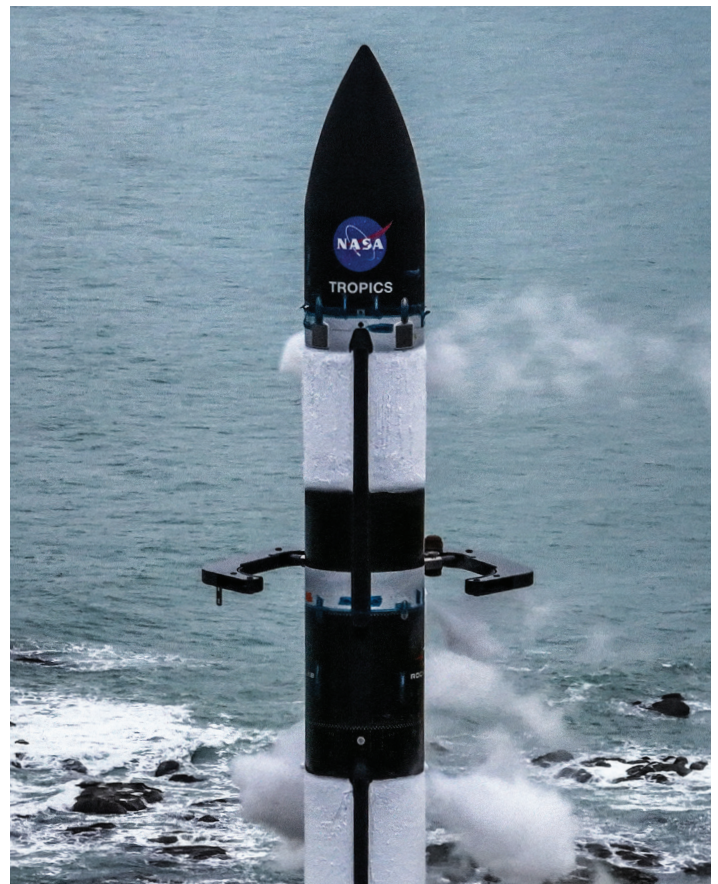
A wet dress rehearsal is underway for Rocket Lab's Electron rocket at Launch Complex 1 in Mahia, New Zealand on April 28, 2023. NASA's Time-Resolved Observations of Precipitation structure and storm Intensity with a Constellation of Smallsats (TROPICS) CubeSats are secured in the payload fairing atop the rocket.

VCLS (Venture-Class Launch Services) demonstration contracts, a precursor to VADR, were fixed price contracts for demonstration launches. These contracts were created to understand new emerging rockets prior to having a first flight. The 2015 Venture-Class Launch Services (VCLS) demonstra-