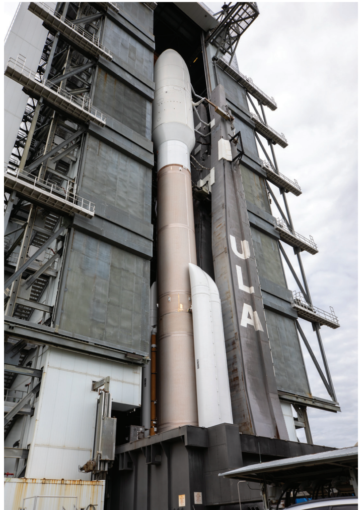
The United Launch Alliance Atlas V 541 rocket, carrying NASA's Mars Perseverance rover and Ingenuity helicopter, begins rollout from the Vertical Integration Facility to the launch pad at Space Launch Complex 41 at Cape Canaveral Air Force Station on July 28, 2020.

VADR (Venture-Class Acquisition of Dedicated and Rideshare) launch service contracts implement a modified technical oversight approach using a lower level of mission assurance and