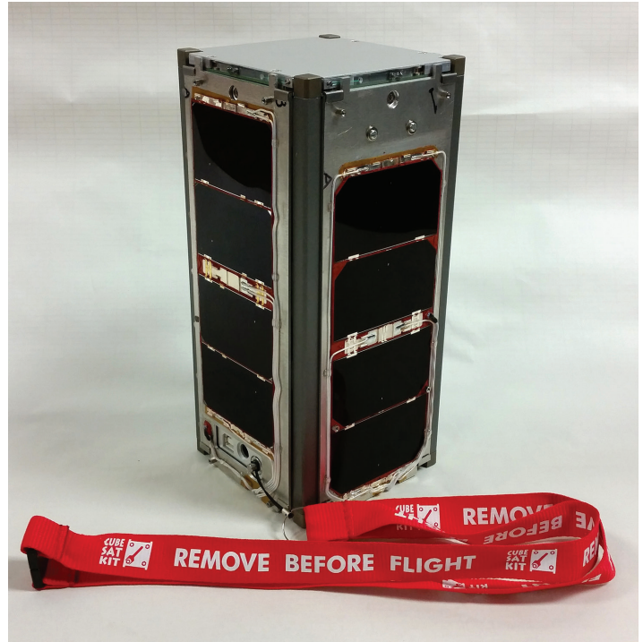
The standard CubeSat size uses a "one unit" or "1U" measuring 10x10x10 centimeters and is extendable to larger sizes; 1.5, 2, 3, 6, and even 12U. A CubeSat typically weighs less than 2 kilograms (4.4 pounds) per unit.