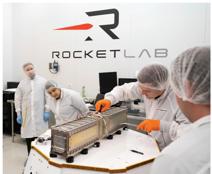
Technicians prepare NASA's Time-Resolved Observations of Precipitation structure and storm Intensity with a Constellation of Smallsats (TROPICS) CubeSats for encapsulation in Rocket Lab's Electron payload fairing in a processing facility near Launch Complex 1 in Mahia, New Zealand.