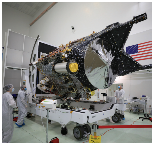
(Left) A team prepares NASA's Psyche spacecraft for launch inside the Astrotech Space Operations Facility near the agency's Kennedy Space Center in Florida on Dec. 8, 2022.

NPD 8610.7D addresses launch vehicle risk classification in addition to the assessment areas required for each level and provides more details about NASA's launch services risk mitigations.