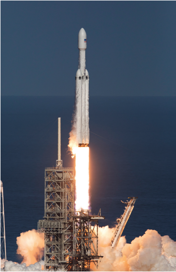
A SpaceX Falcon Heavy rocket begins its demonstration flight with liftoff February 6, 2018 from Launch Complex 39A at NASA's Kennedy Space Center in Florida.

tion contracts studied the risks of selecting new rockets before they had flown and determined that these new rockets could deliver NASA payloads at a fixed price. The 2021 VCLS Demo 2 contracts continued this journey to better understand the new U.S. launch suppliers.