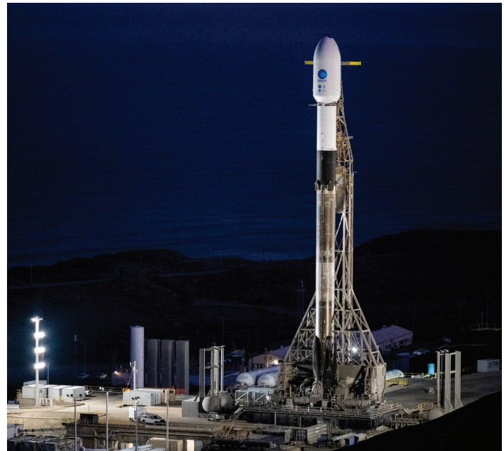
A SpaceX Falcon 9 rocket with the Surface Water and Ocean Topography (SWOT) spacecraft onboard is seen as preparations for launch continue, Wednesday, Dec. 14, 2022, at Space Launch Complex 4E at Vandenberg Space Force Base in California.