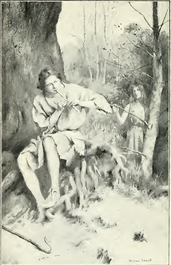
Peridore . . . wooed her with his pipe to draw near . . . —p. 84.