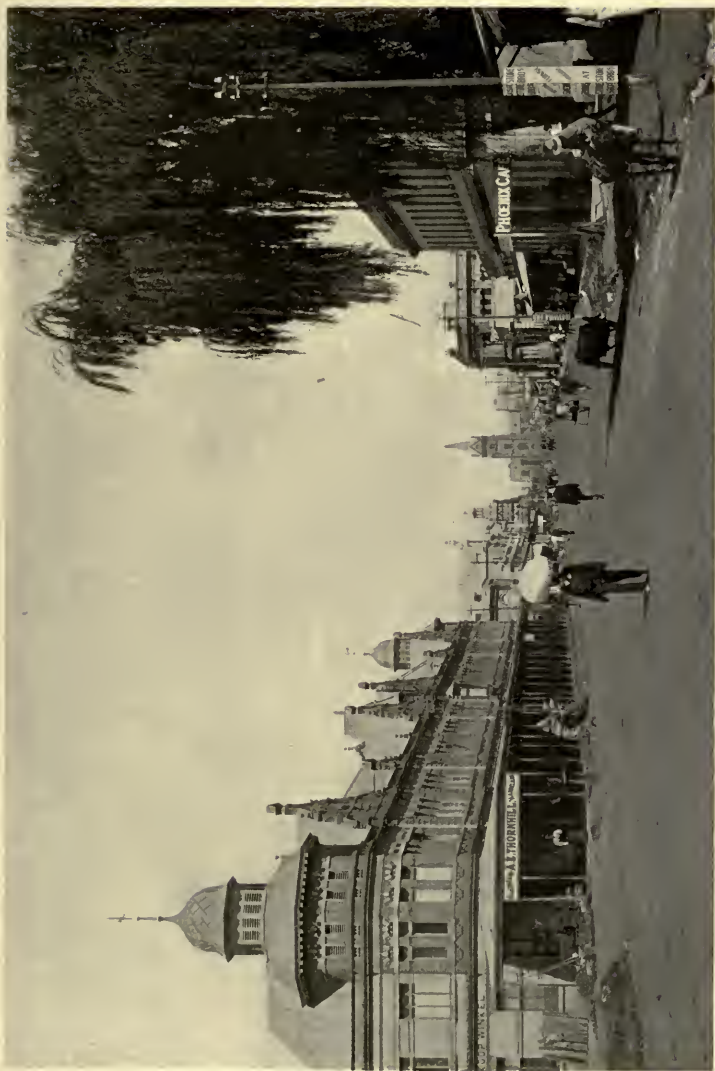
Kirk Street, Pretoria, with the State Church in the distance.