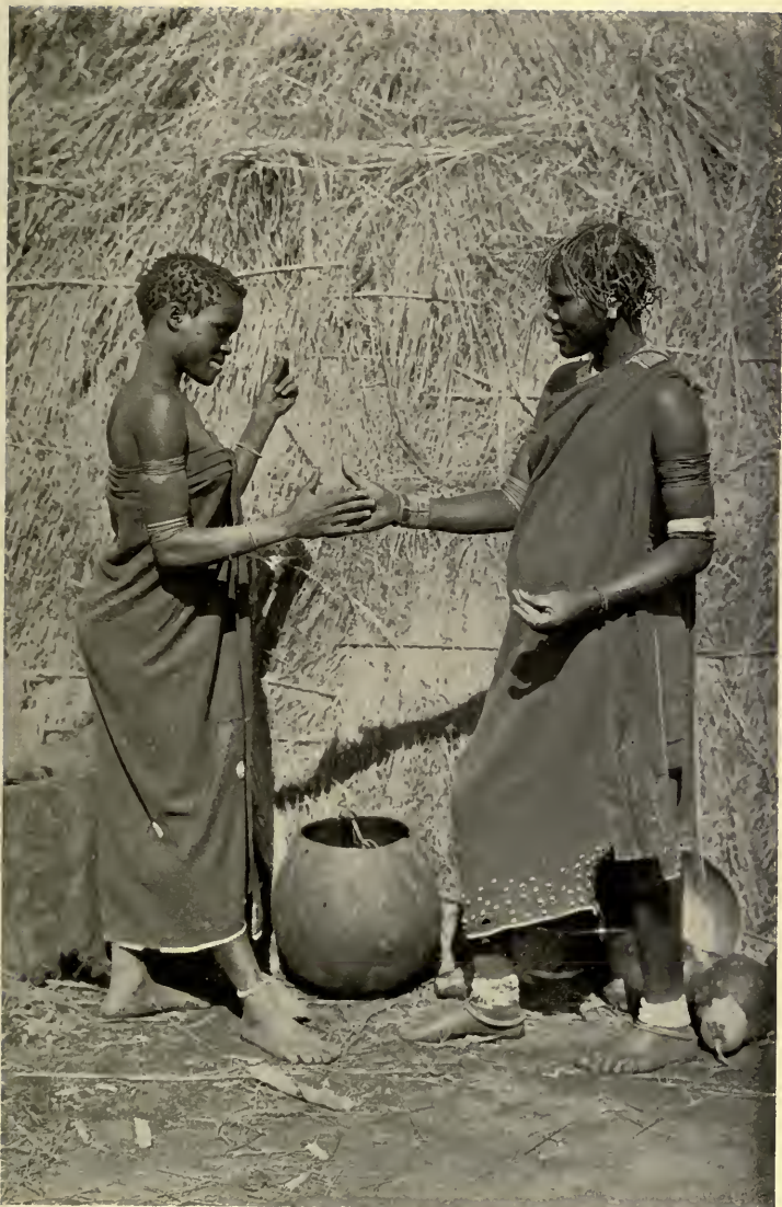
Zulu maidens shaking hands.