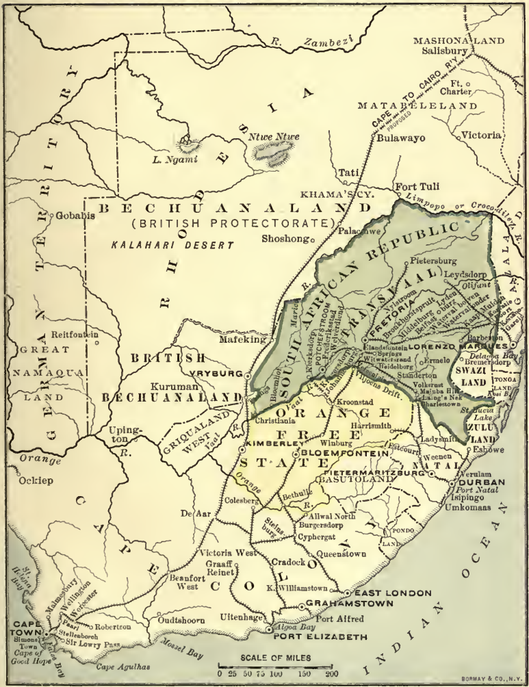
Map of South Africa.