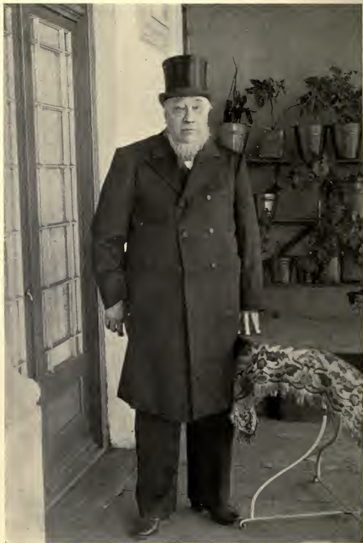
President Kruger on the piazza of the Executive Mansion, Pretoria.