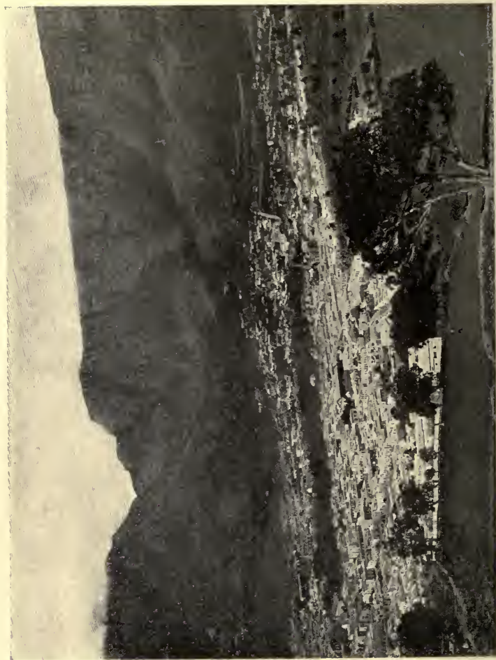
Cape Town and Table Mountain.