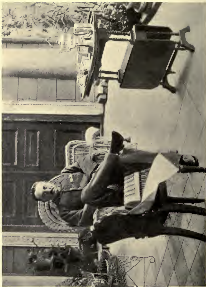
The Rt. Hon. Cecil J. Rhodes on the piazza of his residence, Grootte Schuur, at Rondebosch, near Cape Town.