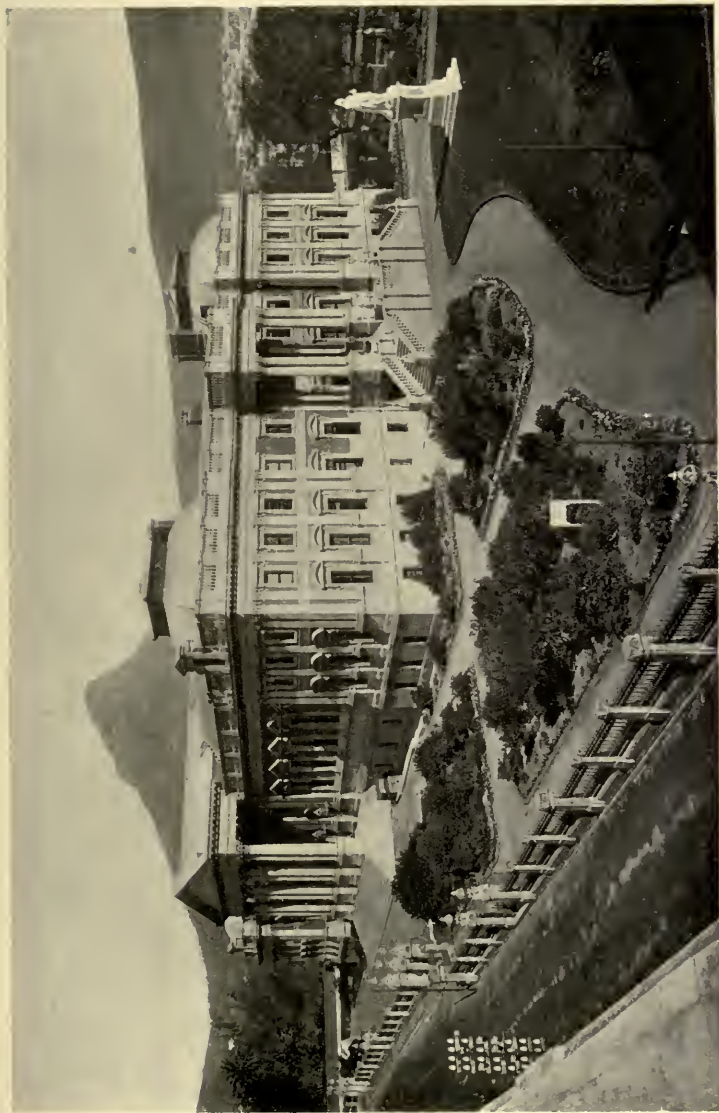
Cape Colony Government House, at Cape Town.