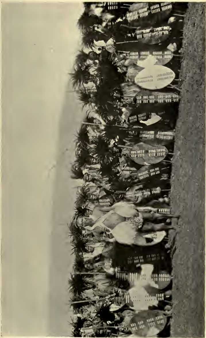
A band of Zulu warriors in war costume.