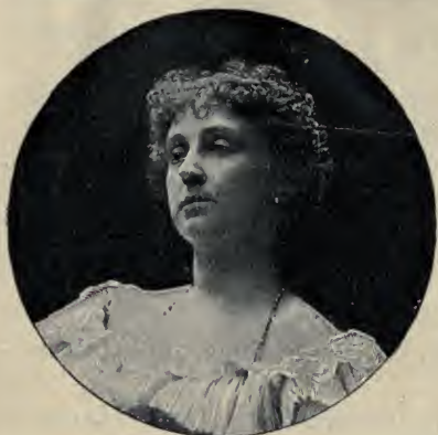
Kate Douglas Wiggin