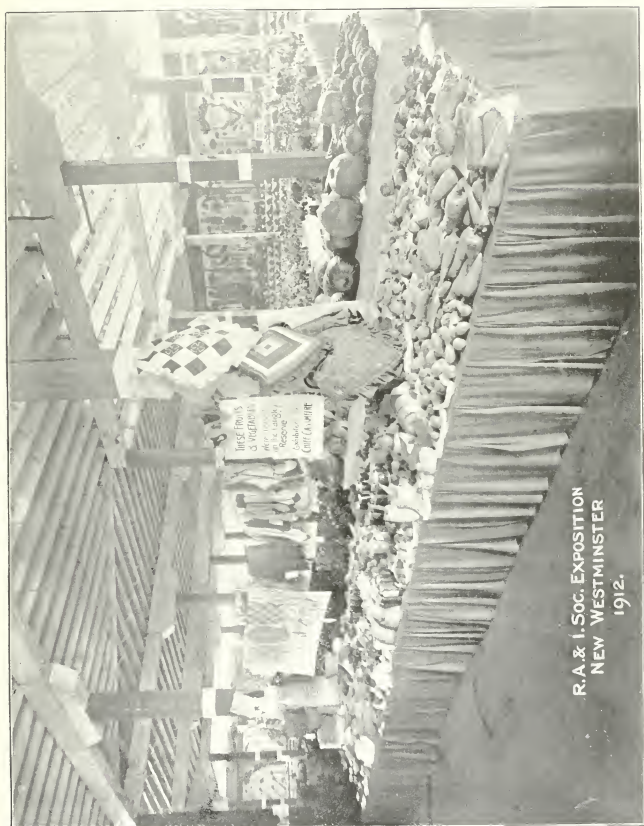
R. A. & I. Soc. EXPOSITION NEW WESTMINSTER 1912.