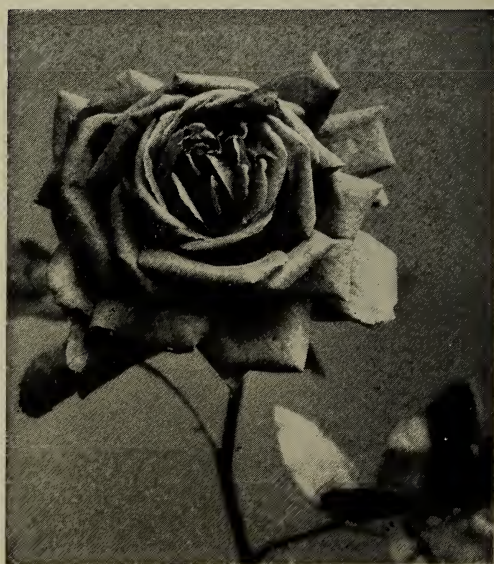
GEO. C. WAUD—For description see page 11.

Dorothy Perkins (Cl.-Wich.) This is a splendid shell-pink climbing rose. It attracted much attention at the Pan-American Exposition, where a bed of 14-month-old plants produced a show of bloom unequalled by any other variety, unless it was the famous Crimson Rambler. This rose is of the same strong habit of growth as Crimson Rambler. The flowers are large for a rose of this class, very double, sweet-scented and