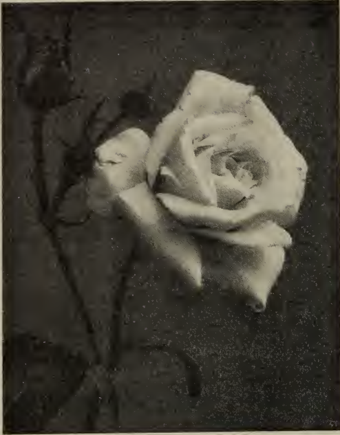
SUNBURST—For description see page 10.