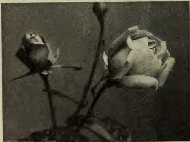
RAYON D'OR—For description see page 9.

Betty (H. T.) Dickson & Sons, 1905. (Gold Medal) "A rose of great merit; decidedly good as a long-stemmed rose for house decoration."—Gardeners' Chronicle. Copper rose of lively tint, shaded with golden yellow at the base. The growth is strong and vigorous and well furnished with thick leathery foliage. Buds long and pointed.