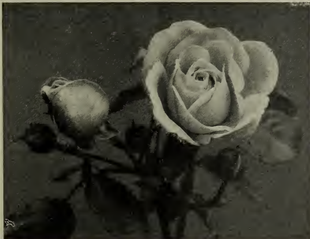
MAD. RAVARY—For description see page 12.

Rayon d'Or (Pernetiana) Pernet-Ducher, 1910. A superb new novelty from France which is unquestionably the yellowest of yellow roses in cultivation, and probably no rose in cultivation today possesses the remarkable coloring of this new rose. A cross between Madam Melanie Soupert and Soliel d'Or . A vigorous grower, of fine branching habits; fine bronze-green foliage and oval shaped buds tinged coppery-orange. It is not only very attractive in the bud, but equally so when flowers are expanded on account of its