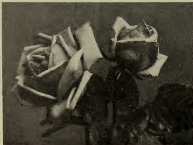
JONKHEER J. L. MOCK—For description see page 9.

PRUNING —Old and decayed branches, and about one-half the previous season's growth, should be cut away early in the spring, while they are still dormant, and after the first bloom, a little cutting back, usually about the middle of September, will insure late flowers. As a rule prune close for size and quality, or what is known as exhibition flowers. For quantity or garden decoration follow same course with weak, old or unripe wood but do not cut back the strong thrifty shoots so severely. In shortening always prune to an "eye" pointing away from the center of the plant.