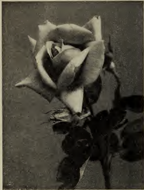
LYON ROSE—For description see page 11.