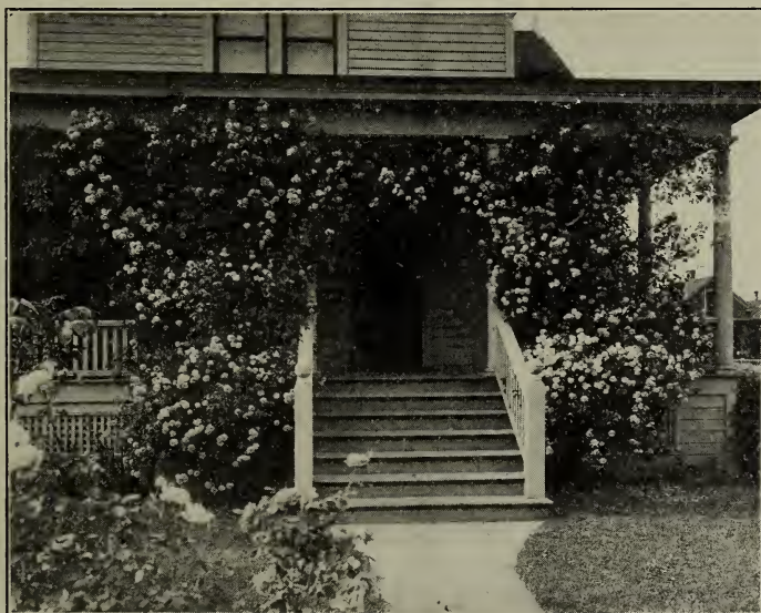
BEAUTIFUL CLIMBING ROSES.

Reve d'Or (Cl.-N.) One of the grandest climbing roses. A splendid robust climber, with the very best of foliage. A good plant will soon go to the top of a two-story house and cover space proportionately large the other way. Color apricot-yellow, with orange and fawn tints; petals of superb and delicate texture; flowers moderate-full, always pretty and graceful, whether in bud or full open; a very profuse bloomer.