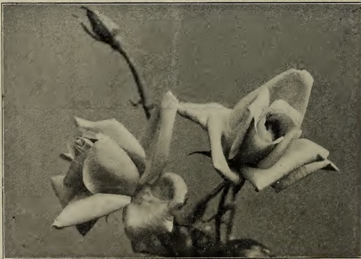
BETTY—For description see page 10.