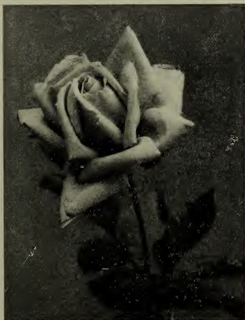
LADY ASHTOWN—Description page 11.

Frau Karl Druschki (H.P.) Has been well named White American Beauty. A wonderful rose, such as our people have long been waiting for—fine, large, free-flowering, hardy, white. Extraordinarily strong-growing, branching freely, foliage large, of heavy texture, but the glory is in its flowers, which are immense, and produced with great freedom, during the whole season; petals broad, long and saucer-shaped. Buds egg-shaped long and pointed. Pure, snow-white, without a tinge of yellow, pink or any other color.