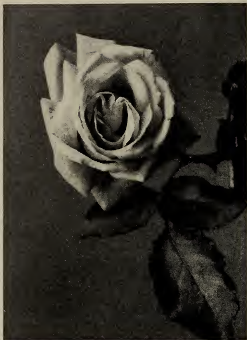
MY MARYLAND—For description see page 12.