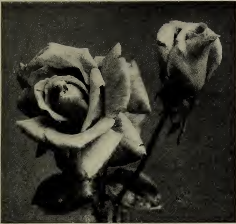
COUNTESS OF GOSFORD—Description page 10.