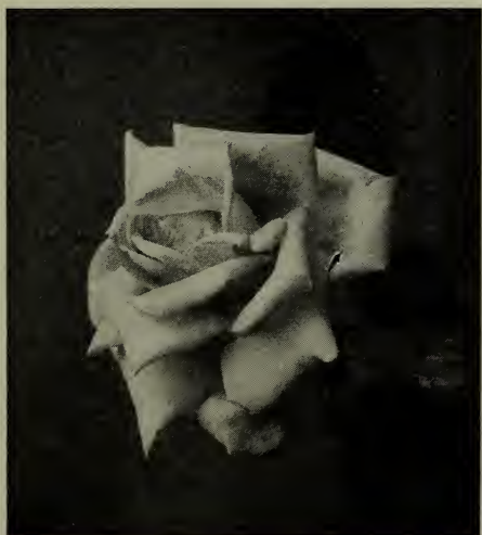
PHARISÆER —For description see page 12.