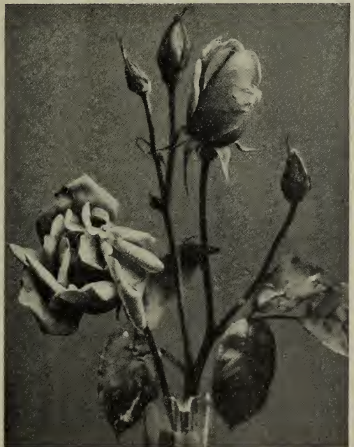
DUCHESS OF WELLINGTON—Description page 8.