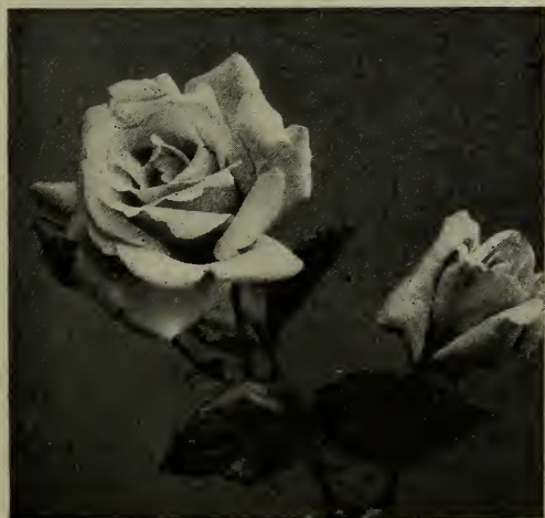
MAD. LEON PAIN—For description see page 12.

Blue Rambler (Veilchenblau) (Cl.-Poly.) This is a seedling of the Crimson Rambler. The massed