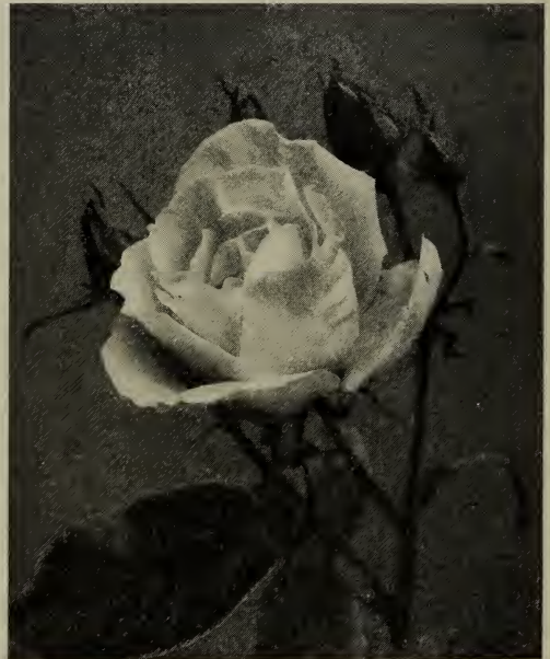
WHITE KILLARNEY—Description page 18.

Marie Van Houtte (T.) White, slightly tinged with yellow. Free grower and fine bloomer.