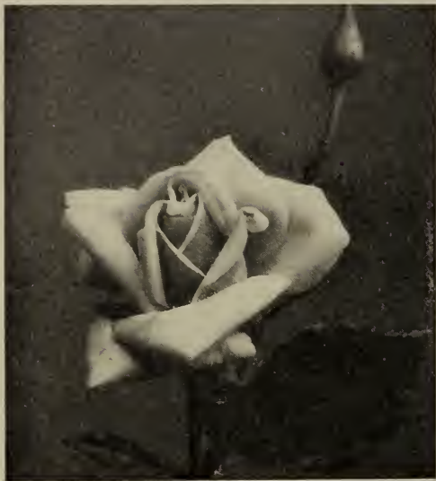
JOSEPH HILL—For description see page 11.