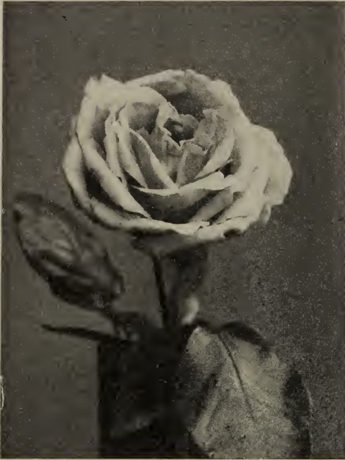
EARL OF WARWICK—Description page 10.