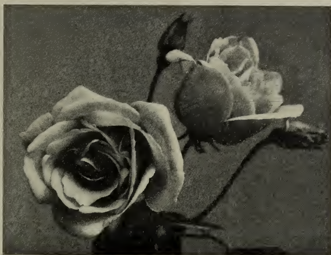
LADY HILLINGDON—For description see page 9.

When planting prune all roses severely. In Fall planting prune the following spring, and when planted in the spring prune at time of planting.