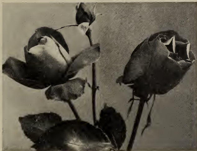
EDWARD MAWLEY—For description see page 8.