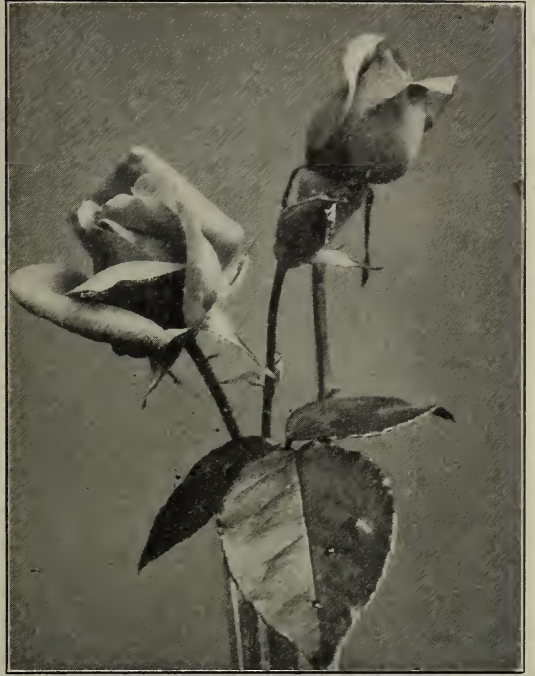
DOROTHY PAGE ROBERTS—Description page 10.

Lady Hillingdon (H. T.) Lowe & Sawyer, 1909. (Gold Medal) An ideal yellow tea rose with a splendid long bud. It blooms continuously throughout a long season and is unsurpassed as a cut flower. Its deep apricot yellow is of an especially rich tone. This new variety hails from England, where it received numerous first prizes. The open bloom is only fairly full but cut in the bud state is of superlative beauty.