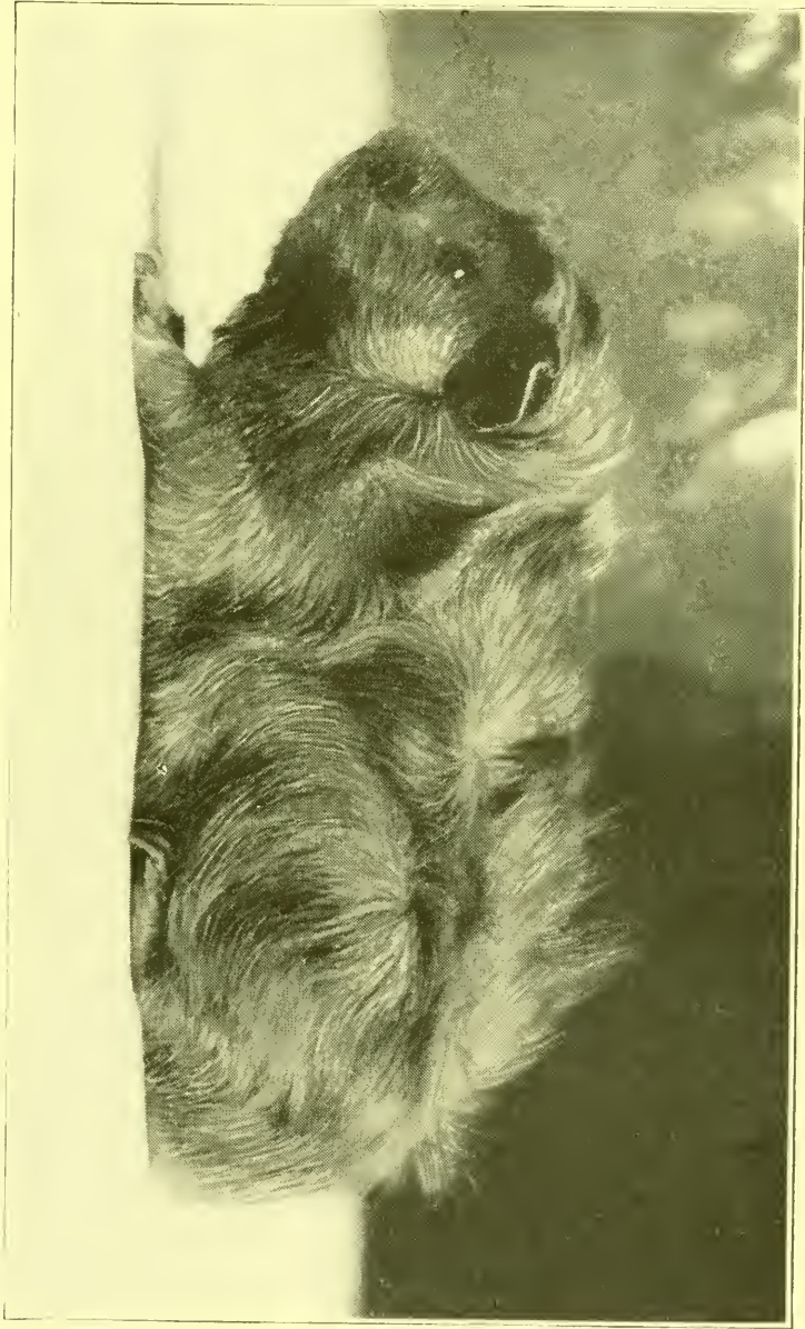
BLACK ABYSSINIAN CAVY