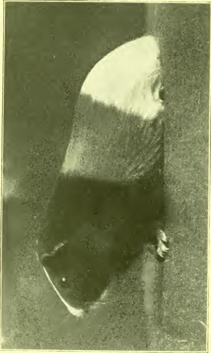
ENGLISH TORTOISE and WHITE CAVY