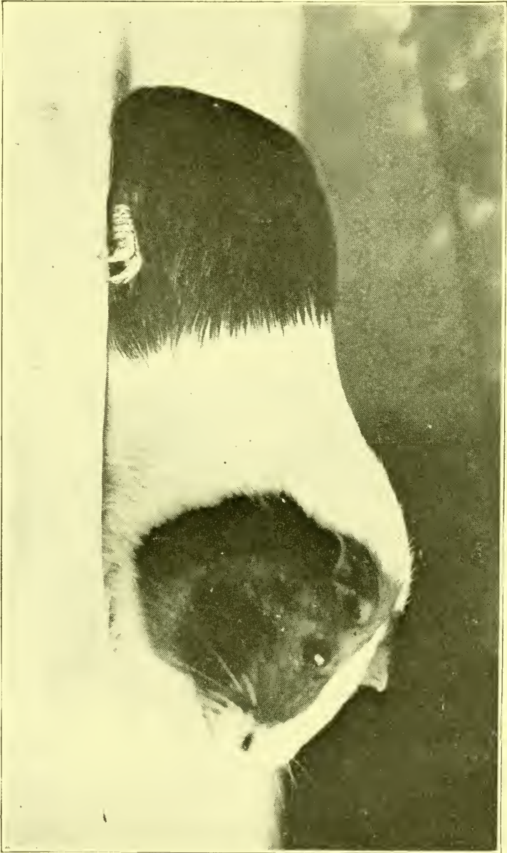
DUTCH MARKED CAVY