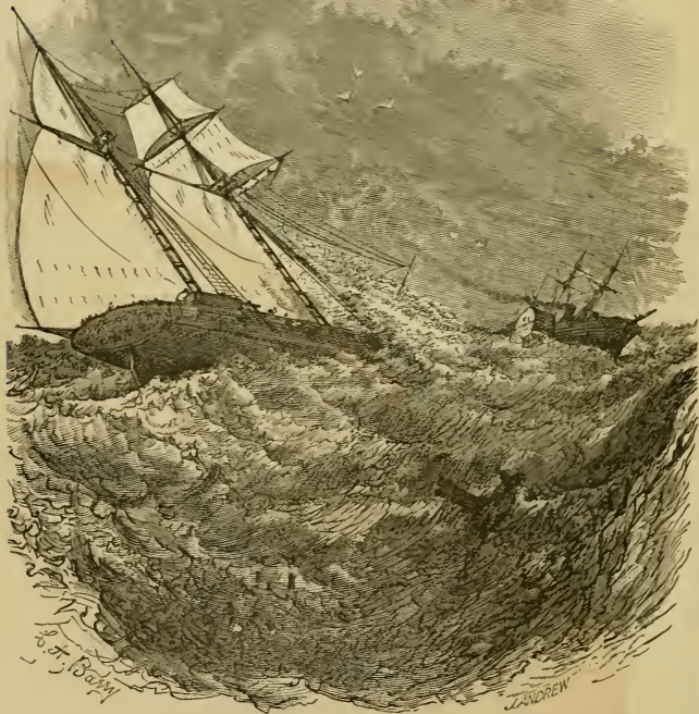
Latitude Forty-one: Longitude Sixty-two. Page 173.