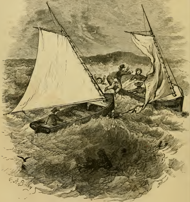
Off the Dumpling Rocks. Page 29.