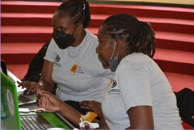
Kenyan Wikipedians at the Nairobi #SheSaid edit-a-thon.