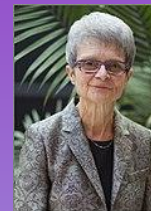
Pierre Guzzo, CC BY-SA 4.0 via Wikimedia Commons