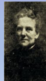
"The Ottawa Citizen", Public domain, via Wikimedia Commons