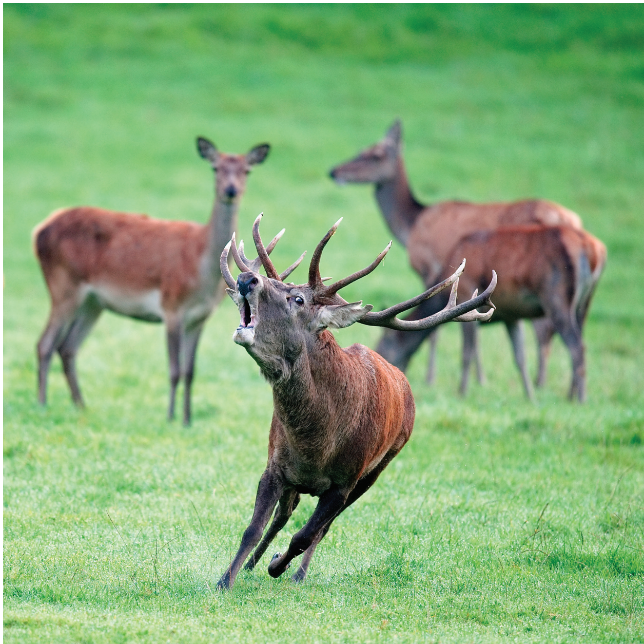
Red deer ( Cervus elaphus ), in Freyr forest, near Han-sur-Lesse, Belgium

Luc Viatour (User:Lviatour) Seventh place, 2011 CC-BY-SA 3.0