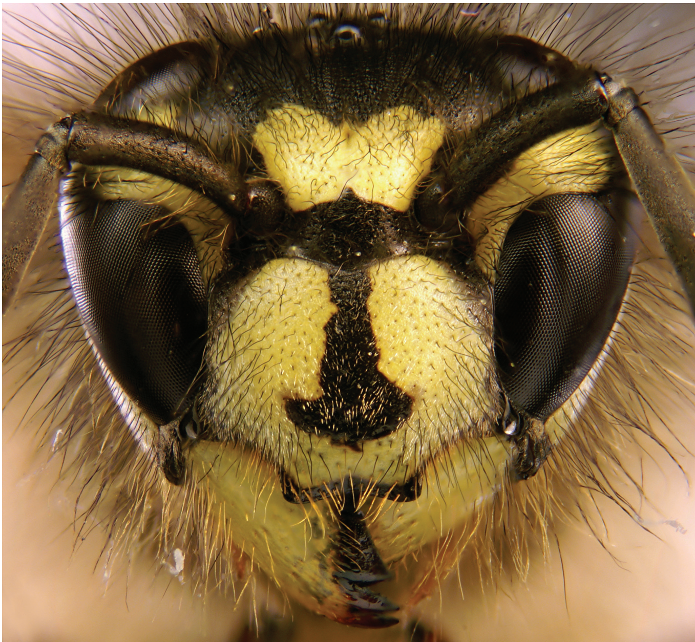
Portrait of the common wasp Vespula vulgaris depicting the characteristic head markings

Tim Evison (User:Tpe) Fourth place, 2011 CC BY-SA 2.5