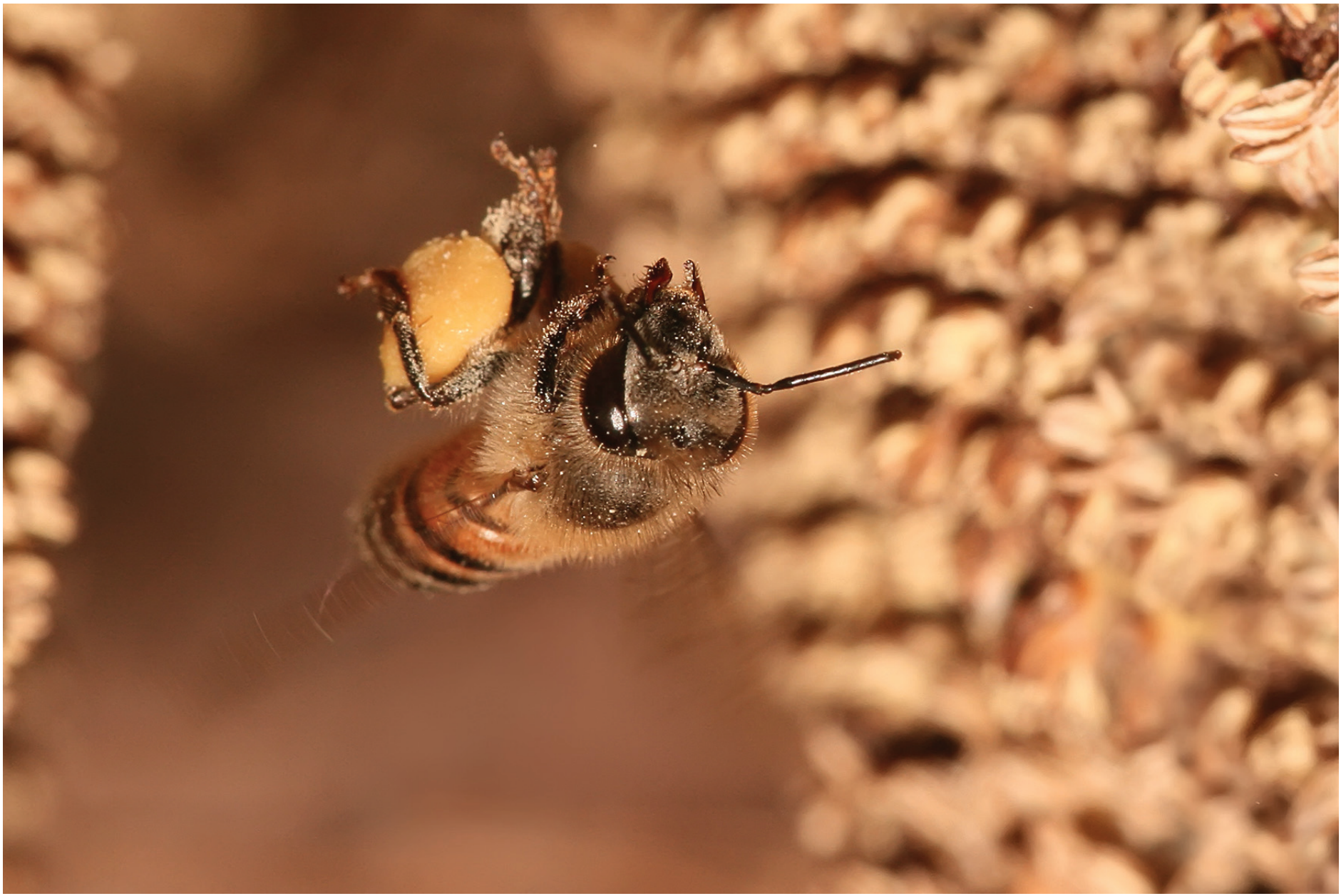
12 mm long Apis mellifera flying back to its hive carrying pollen in a pollen basket. Pictured in Dar es Salaam, Tanzania on a private facility