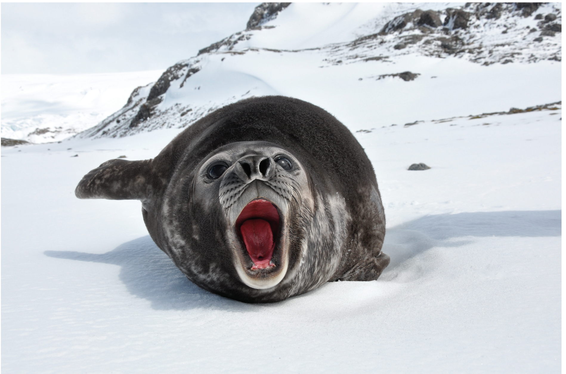
A young Southern Elephant Seal ( Mirounga leonina ) in South Georgia