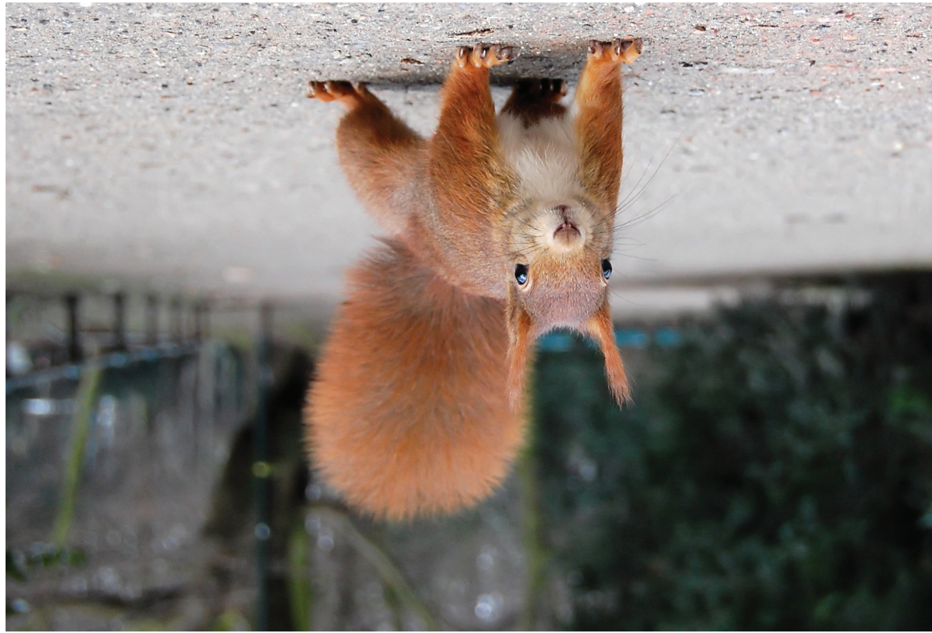
Red Squirrel with pronounced winter ear tufts in the Hogarten in Düsseldorf, Germany

User:Ray eye Third place, 2007 CC BY-SA 2.0 DE