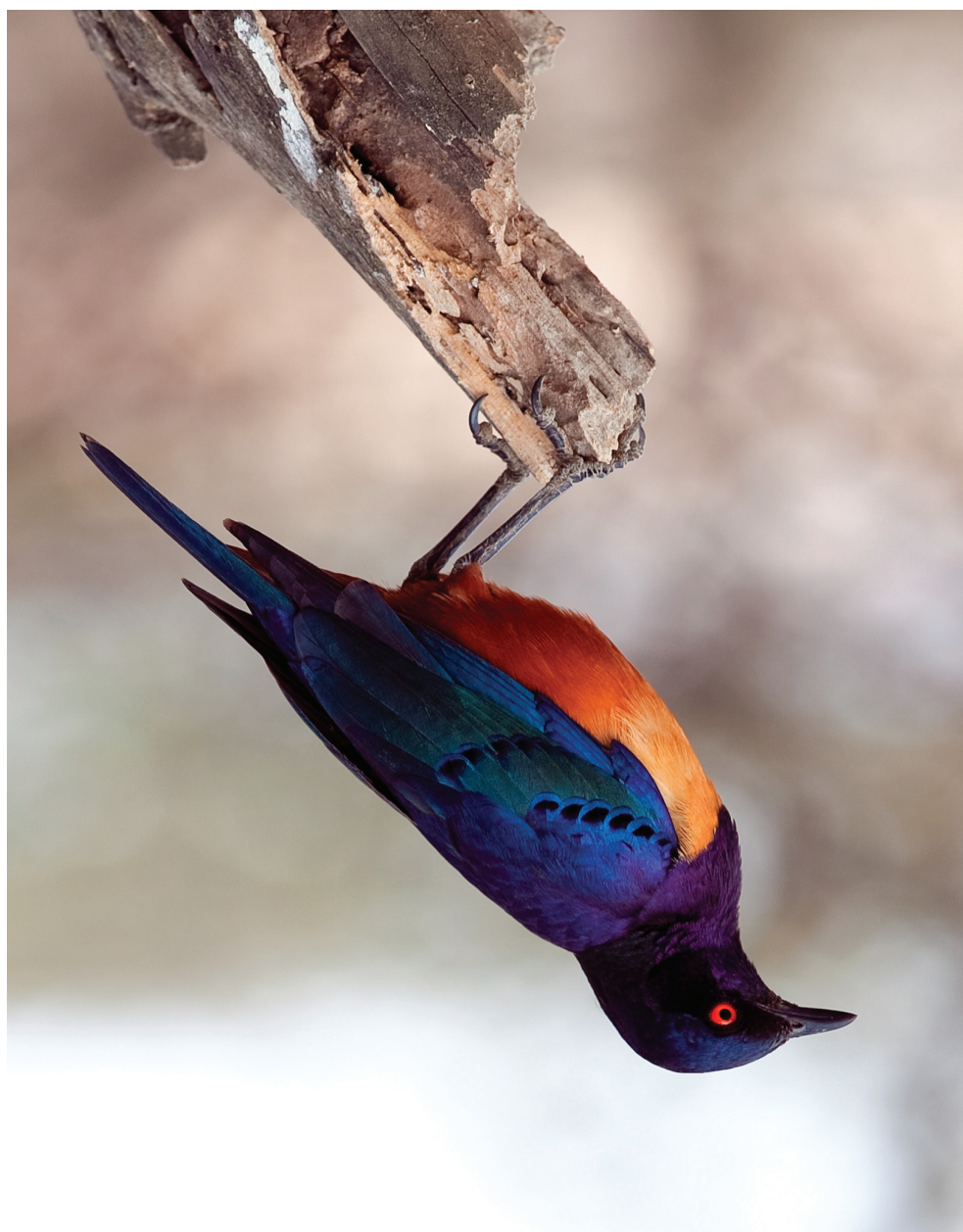
A Hildebrandt's Starling ( Lamprolornis hildebrandti ) in Tanzania

Noel Feans on Flickr Twenty-eighth place, 2010 CC-BY 2.0