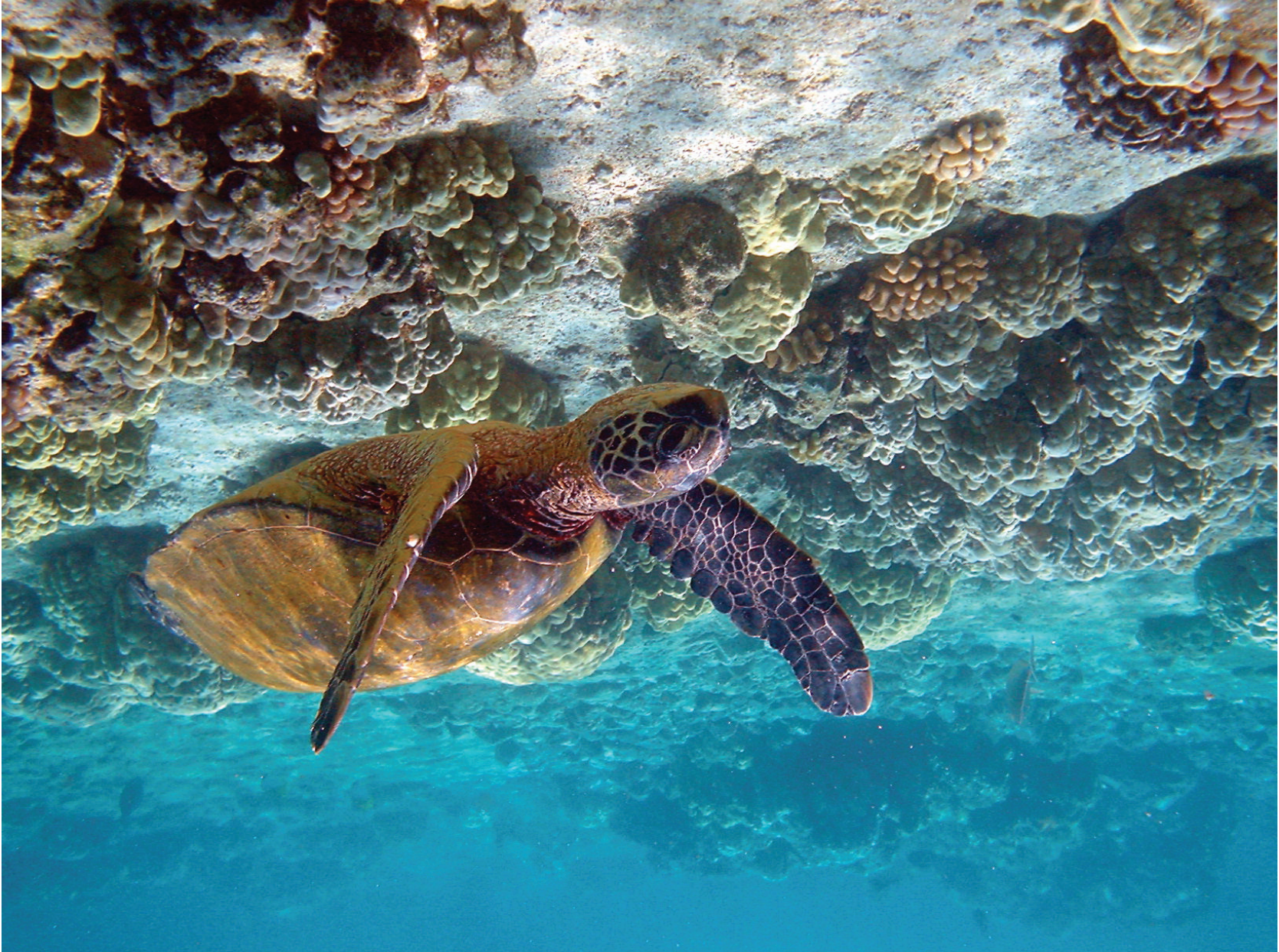
Green turtle, Hawaii, USA