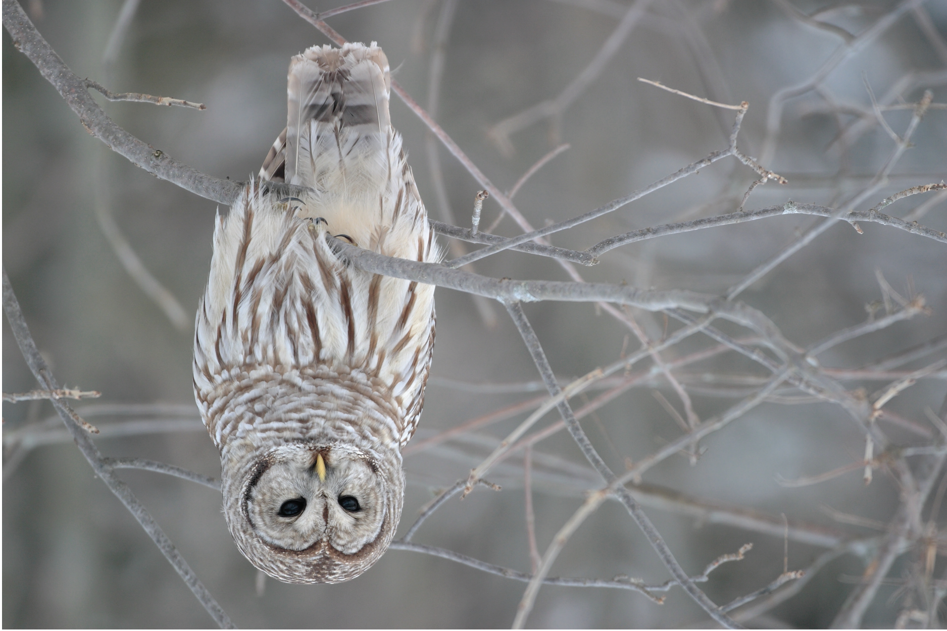
A Barred owl ( Strix varia ), photographed in Canada

User:Mdf Seventh place, 2006 CC-BY-SA 3.0 and GFDL 1.2+