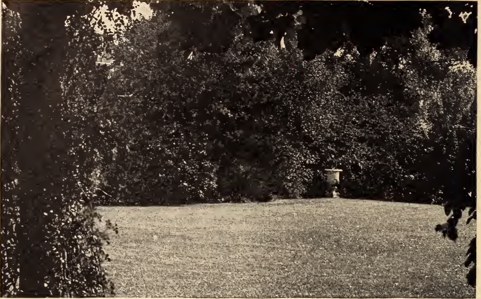
Best quality seeds and proper care make permanently beautiful lawns.

Autumn as well as spring is lawn making time. The cool nights of September and October are especially favorable for growing grass seed. Sow just before fall rains set in and early enough so that the young grass will become well established before cold weather.