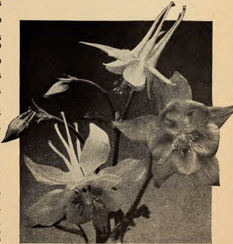
Long Spurred Columbine and Iris are delightful together, either in contrasting or blending colors.

Start a cutting garden of annuals this fall. Sow the seed in rows just before the ground freezes, and give the seed bed a light mulch. You will have earlier flowers than if you wait until the ground can be worked next spring. Flowers in this list that are starred (*) are annuals suit- able for fall planting.