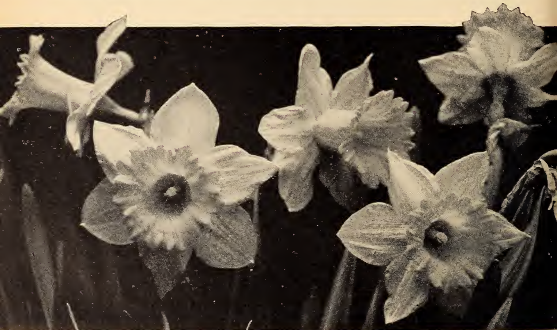
The popular King Alfred,—one of the best of the deep yellow Trumpet Daffodils.

Will's Scarlet A striking flower with creamy white reflexed perianth and large bright orange-red cup which opens widely at the mouth and is beautifully crimped. 12c each; $1.20 per dozen; $8.50 per 100.