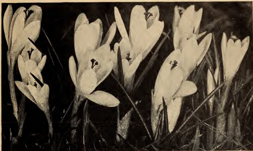
In the lawn, in the border, and under trees large groupings of Crocus are always bright and cheerful in early spring.