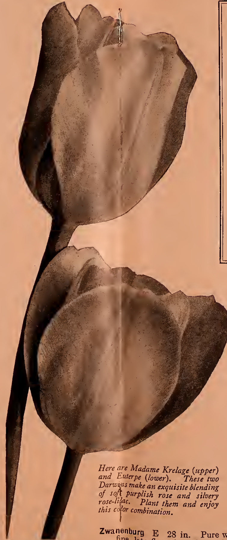
Here are Madame Krelage (upper) and Euterpe (lower). These two Darwins make an exquisite blending of soft purplish rose and silvery rose-lilac. Plant them and enjoy this color combination.