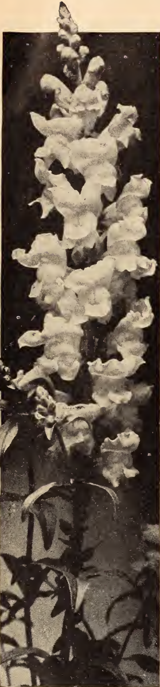
We are now able to offer seed of our Rust Resistant Antirrhinum (Snapdragon) in separate colors and shades. Look for them on this page. These "Snaps" have a high percentage of resistance against the rust blight.

Where the climate is fairly mild, many of the hardy perennials, annuals, and biennials bring excellent results if seeds are sown in the open ground in August, September, and October. Seeds of annuals should be sown late enough so that they will lie dormant during the winter. They will then begin to grow earlier in spring, the plants will be stronger and will blossom sooner than if the seed is sown in spring. Plants like Columbine, Delphinium, Foxglove, and Hollyhock that do not bloom until the second year unless planted very early in spring are especially satisfactory for fall planting. Start them not later than the middle of September. Give them protection if the weather is at all severe.