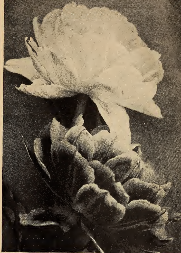
The deep rich scarlet of Imperator Rubrorum contrasts well with a pure white variety such as Snowball.

Tournesol A m. These bright red flowers with broad yellow borders give a very gay appearance to a garden. Tournesol is the easiest double tulip to grow indoors. 10c each; 80c per dozen; $5.50 per 100.