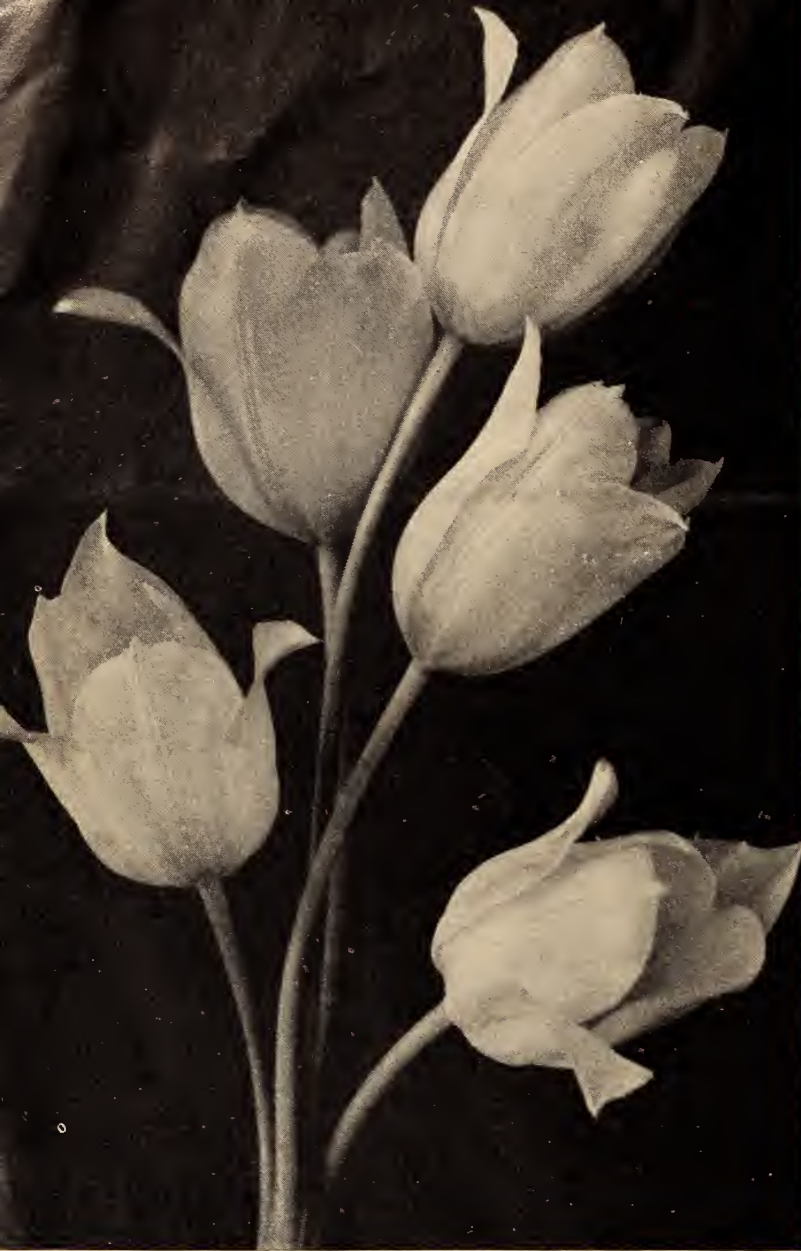
The graceful recurving blossoms and clear yellow color of Mrs. Moon are always admired.

Fairy Queen F 21 in. Rosy heliotrope, beautifully margined with amber. Very large flowers. 9c each; 70c per dozen; $5.00 per 100.