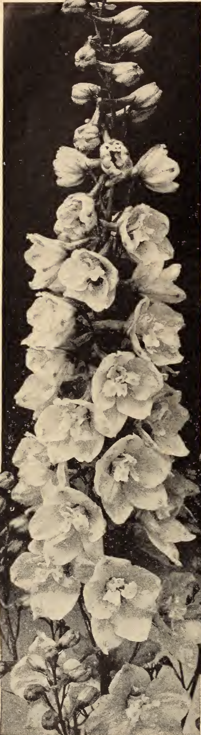
Wherever delphiniums can safely be planted in fall, the magnificent Blackmore and Langdon Hybrids are a wise choice.