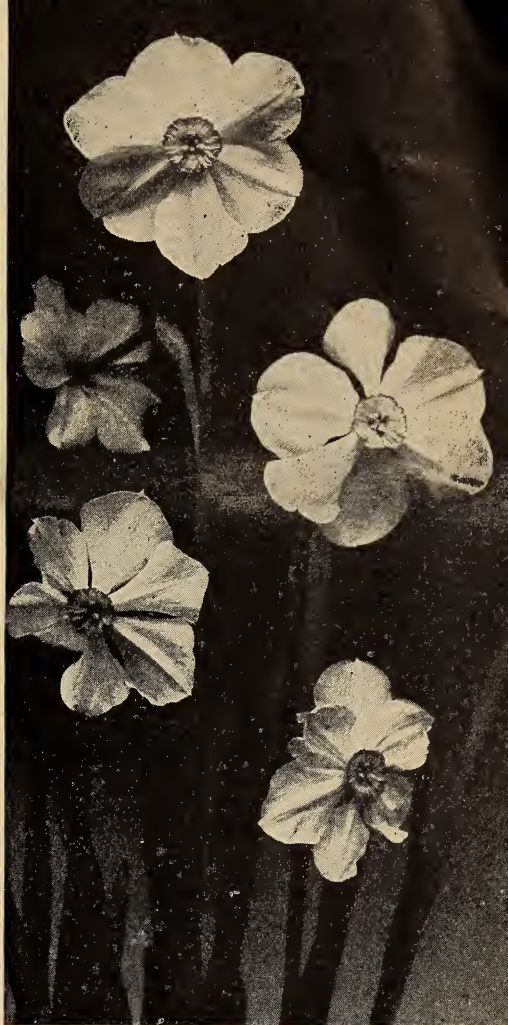
Tuck some Poeticus bulbs beneath the shrubs, or scatter them along the perennial border. This is Horace with flaming red center.

Double Campernelle (Odorus Plenus) The true and rare form of double Campernelle. Flowers fragrant, and quite double. 10c each; 85c per dozen; $5.75 per 100.