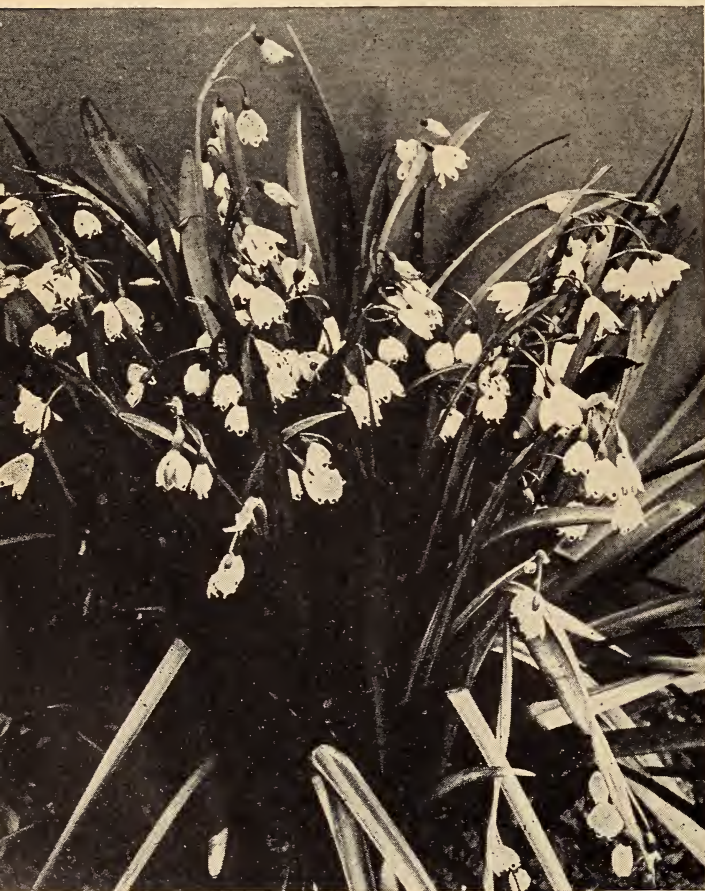
Plant these unusual little flowers,—the Snowflake,—in masses for the first spring showing in the garden.

Pure white with green tips, these dainty blossoms resemble the Snowdrops. They are larger, though, and stronger in growth. Plant three inches deep and five inches apart. When once established they will take care of themselves. 80c per dozen; $6.00 per 100.