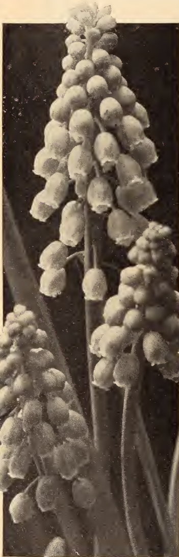
Grape hyacinths (See Muscari, next page) are so dainty and so hardy that they should be better known. Plant a dozen bulbs or more and see how pretty they are.

Maleagris Mixed The large drooping bell-shaped flowers are oddly splashed and striped. The plants grow only about 12 inches tall. Fine for rock gardens, for naturalizing, and for the border. Plant two inches deep and six inches apart. 50c per dozen; $3.00 per 100.