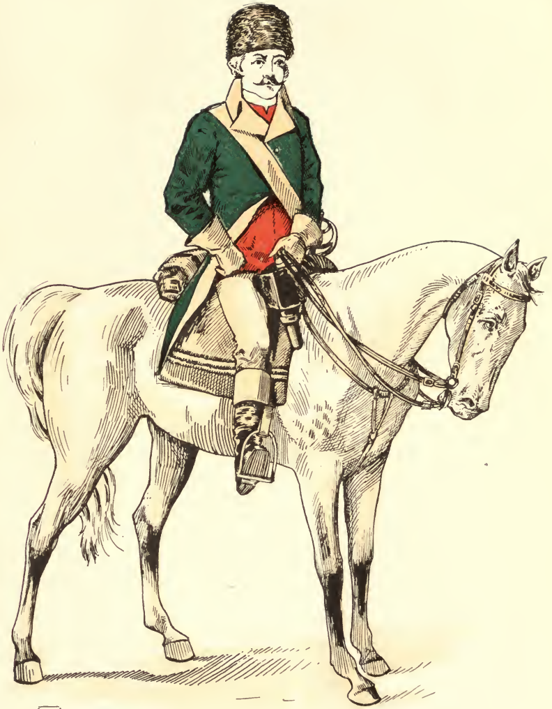
A MOYLAN DRAGOON