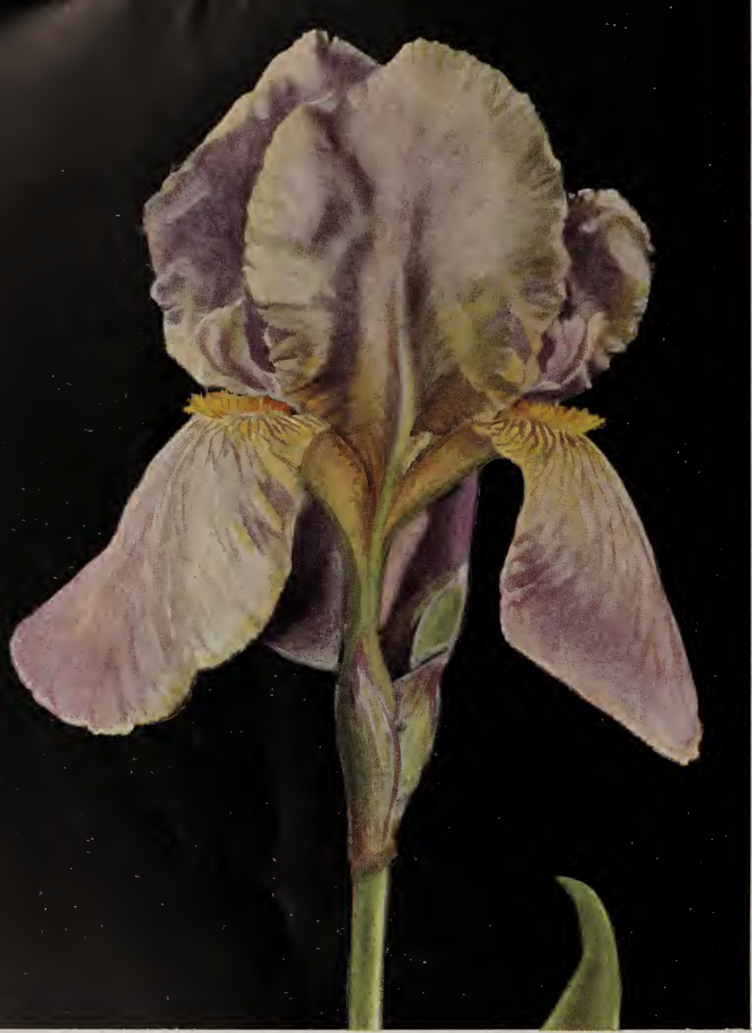
ZAHAROON (Dykes 1927)