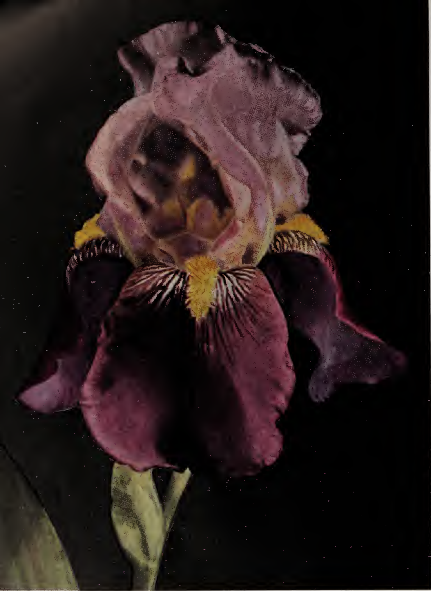
DEPUTE NOMBLOT (Cayeux 1929)