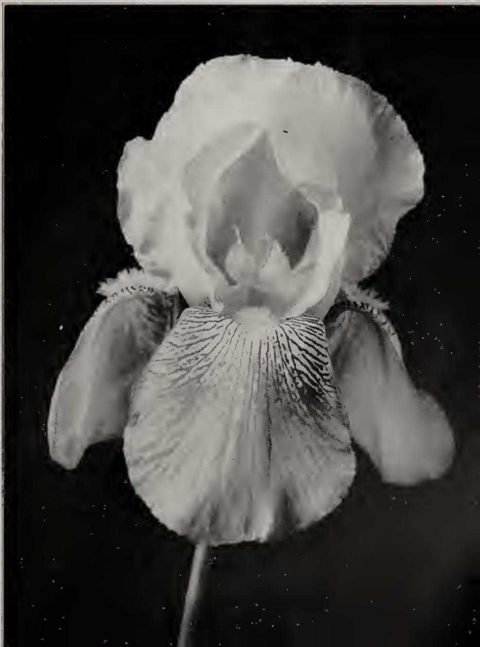
SPRING MAID (Loomis 1933)

SUMMER CLOUD (Kirkland 1931) M. 36". A dainty iris appropriately named. S. pale blue which changes to a soft blue-white like a cloud in the summer sky. F. sky blue. Flower large. One must see this iris to appreciate its charm. Beautiful with dark blues and whites. $1.00