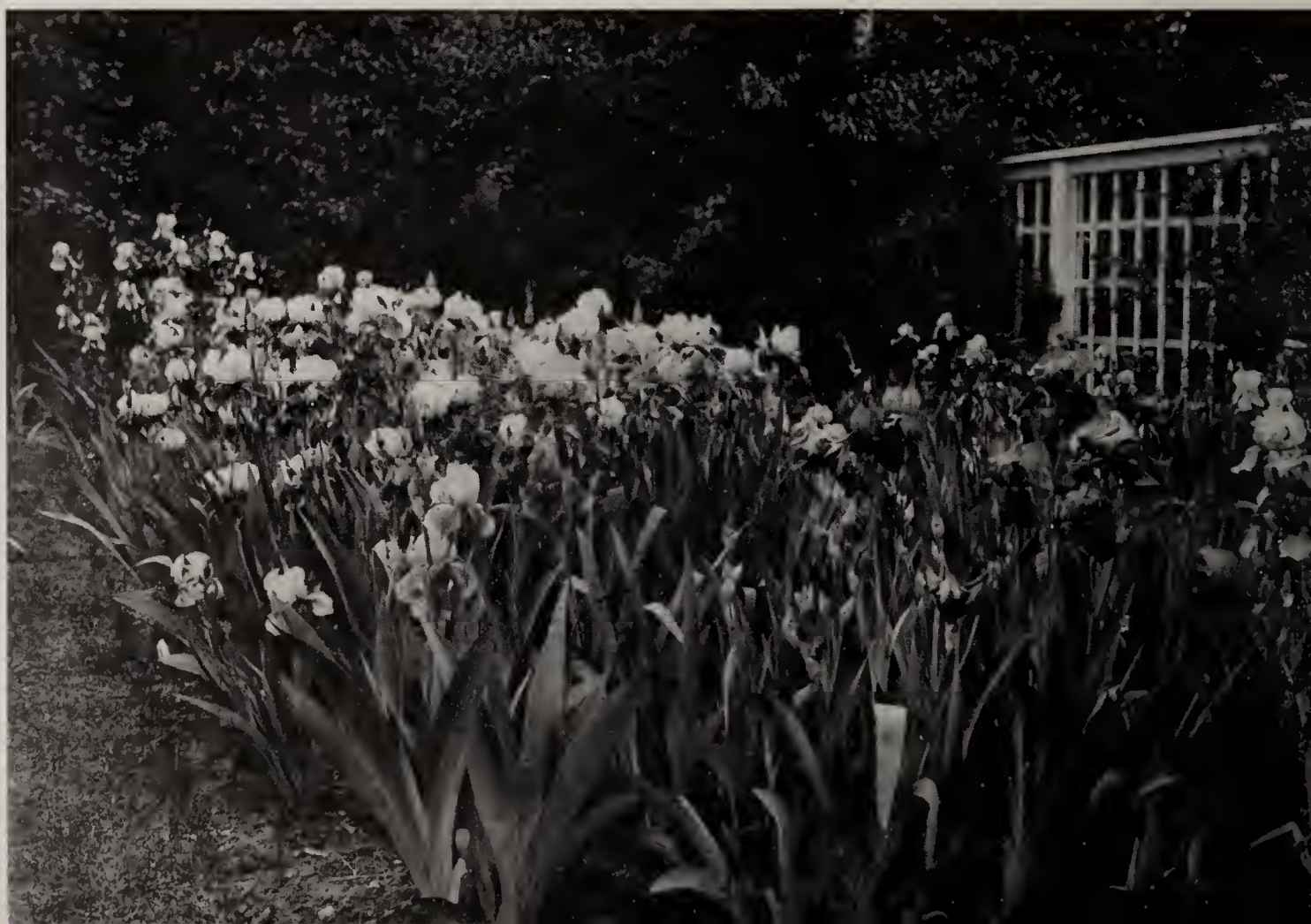
A Quality Gardens planting of Depute Nomblot, Blue Velvet, Grace Sturtevant, Sir Michael, and in the distance, Spring Maid. . . One-year plants.

DISCOUNT: A 10% discount will be given for cash on all orders received up to June 20th, except on bargain lists, clearance lists and collections.