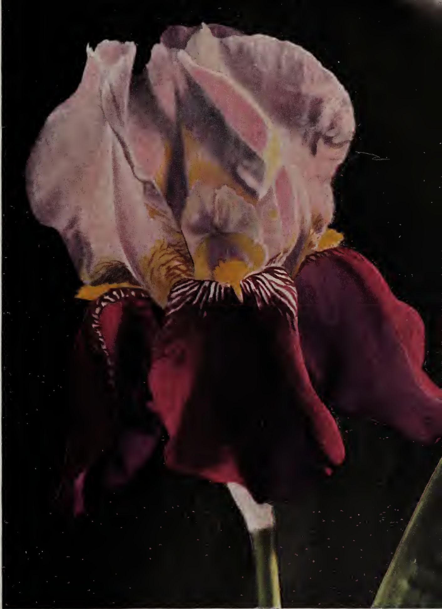
INDIAN CHIEF (Ayres 1929)