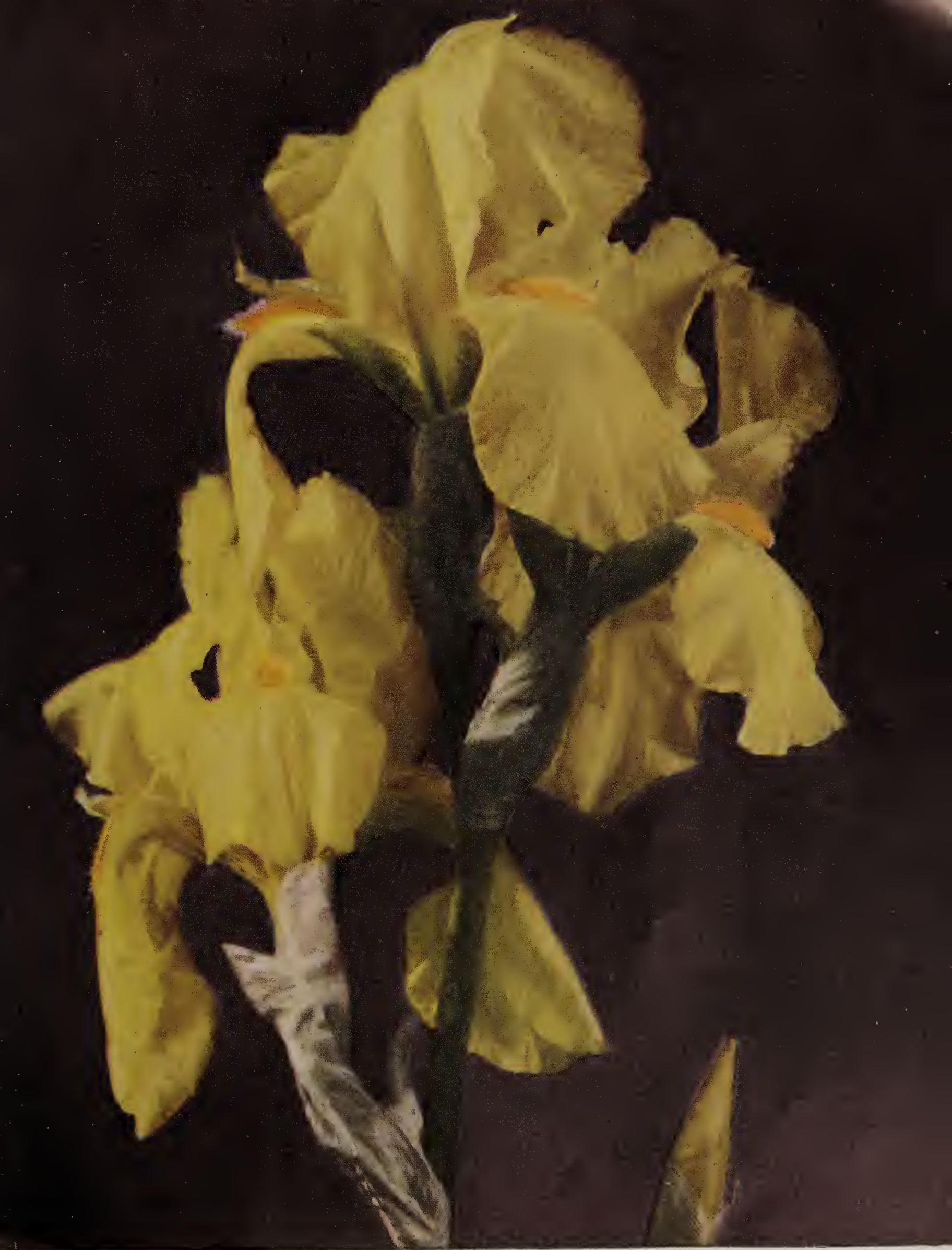
PLUIE D'OR (Golden Rain, Cayeux 1928)