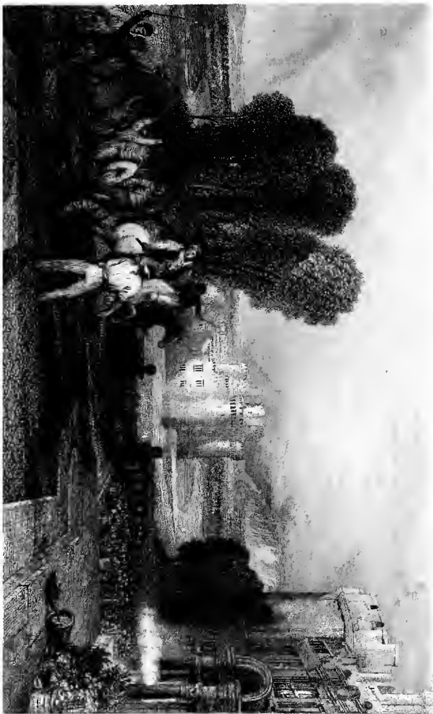
Fig. 1. Herringston, England, & the 'Wings'.