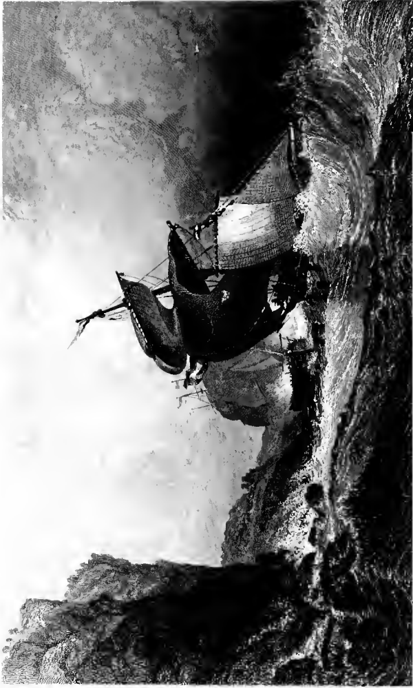
Ship "Tunis" wrecked by the "Cape of St. 167"