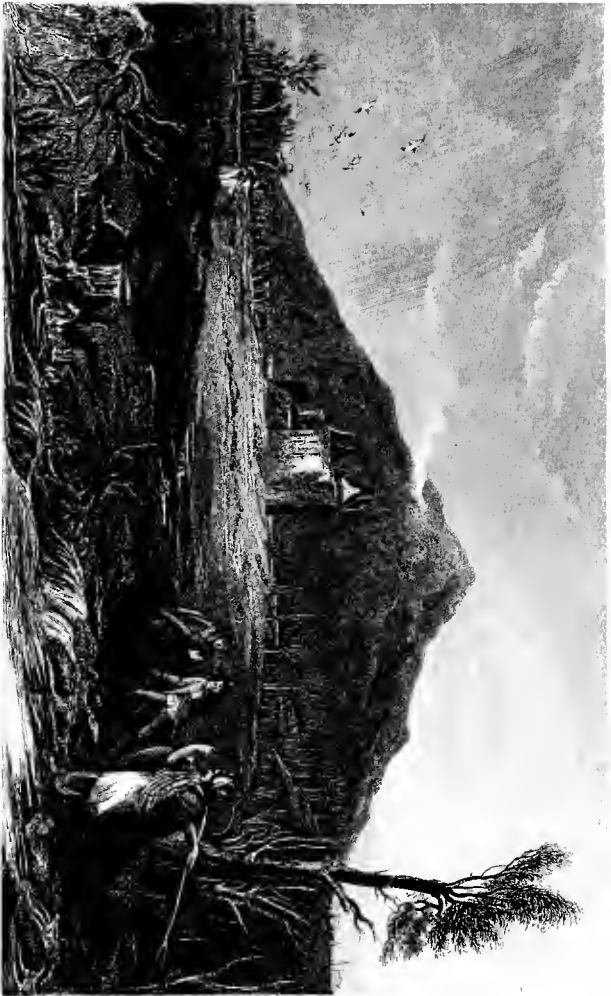
Edwards's Falls. The Town of 'Haugpouen