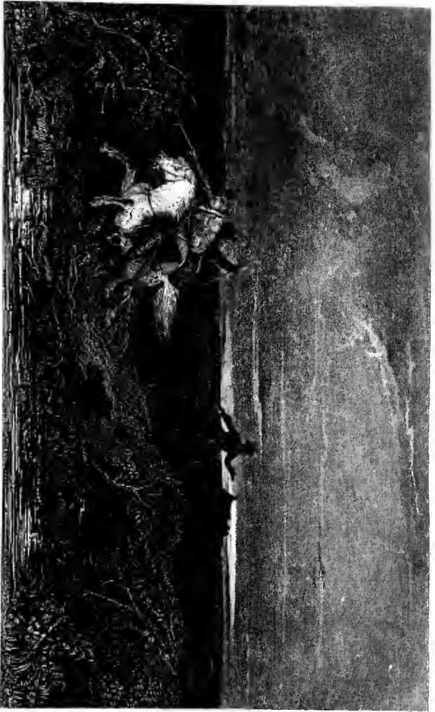
The Master of the Mountain