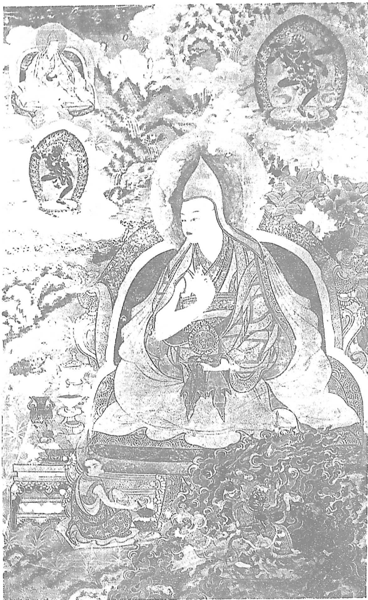
A Picture of the Sixth Dalai Lama Tshangs dbyangs rgya mtsho 第六代達賴喇嘛倉洋嘉錯畫像